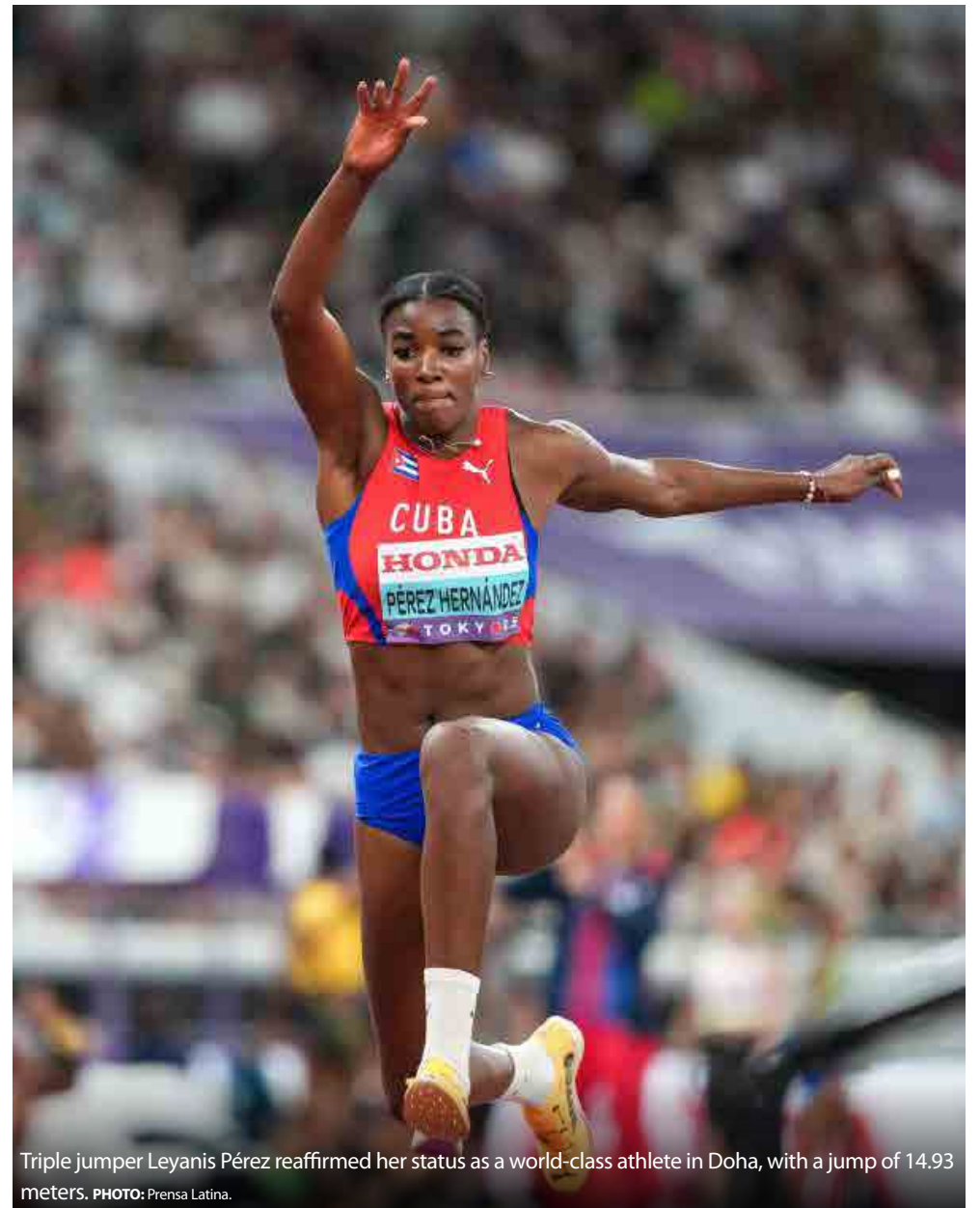
Triple jumper Leyanis Pérez reaffirmed her status as a world-class athlete in Doha, with a jump of 14.93 meters.