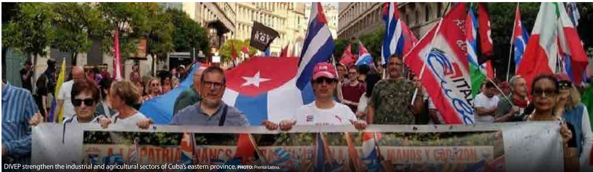
DIVEP strengthen the industrial and agricultural sectors of Cuba's eastern province.

In this regard, it urges "the Italian government and the European Union to reject the sanctioning measures contained in that resolution, as well as to maintain their firm commitment to bilateral dialogue and mutual respect, and demand the immediate end to the U.S. blockade, the true and only cause of the Cuban people's suffering."