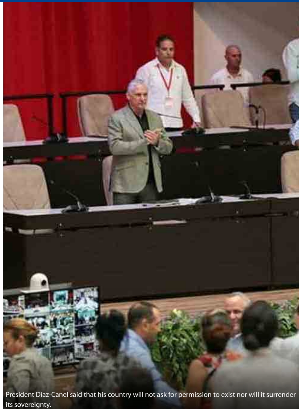
President Díaz-Canel said that his country will not ask for permission to exist nor will it surrender its sovereignty.