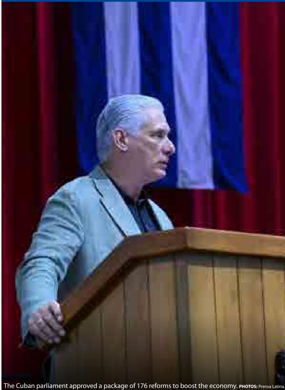
The Cuban parliament approved a package of 176 reforms to boost the economy.