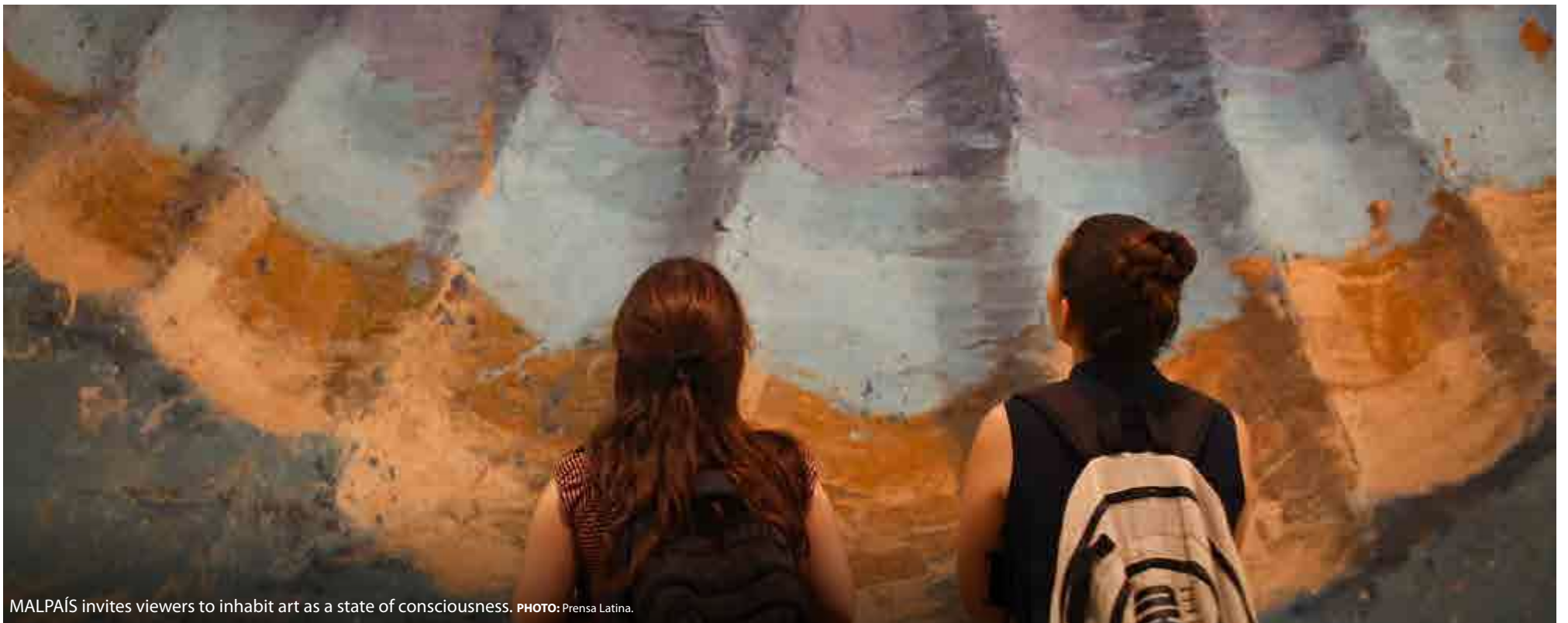
MALPAÍS invites viewers to inhabit art as a state of consciousness.

"Faced with the dynamics of acceleration and visual saturation of the present, the proposal advocates another way of connecting with image and time."