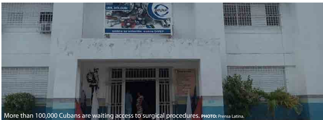
More than 100,000 Cubans are waiting access to surgical procedures.

With more than six decades of work in the Caribbean nation, the WFP promotes food security through agroecological resilience and the strengthening of community protection networks.