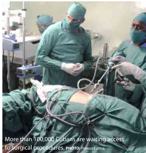
More than 100,000 Cubans are waiting access to surgical procedures.

The official also noted that from March 2024 to February 2025, economic losses in the health sector exceeded 288 million dollars, a figure that is part of the more than 4.183 billion dollars accumulated by the national system as a consequence of the U.S. blockade, which has been in effect for over six decades.