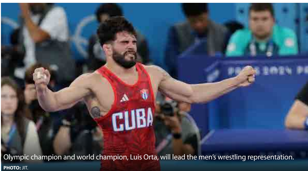
Olympic champion and world champion, Luis Orta, will lead the men's wrestling representation.