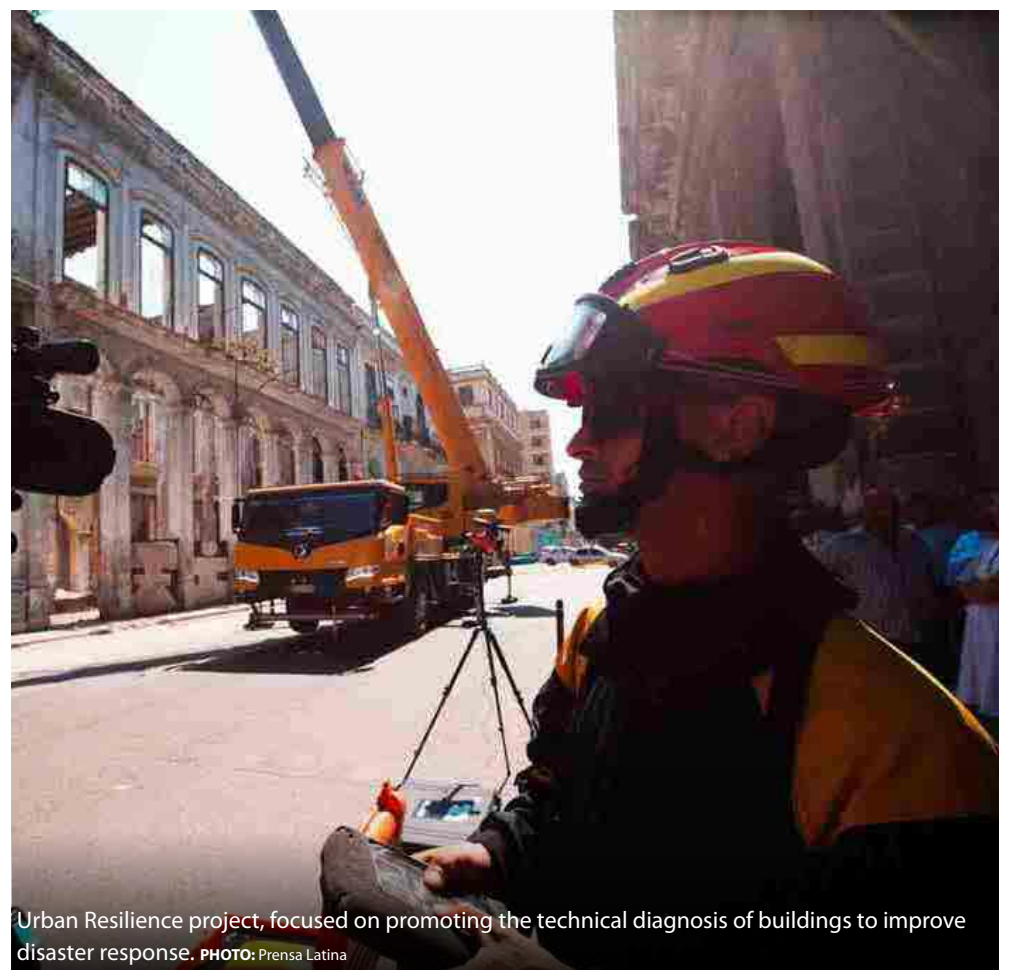
Urban Resilience project, focused on promoting the technical diagnosis of buildings to improve disaster response.

The sources added that in the province of Pinar del Río, the project benefited eight local enterprises dedicated to the production of housing construction materials.