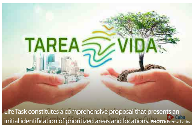
Life Task constitutes a comprehensive proposal that presents an initial identification of prioritized areas and locations.