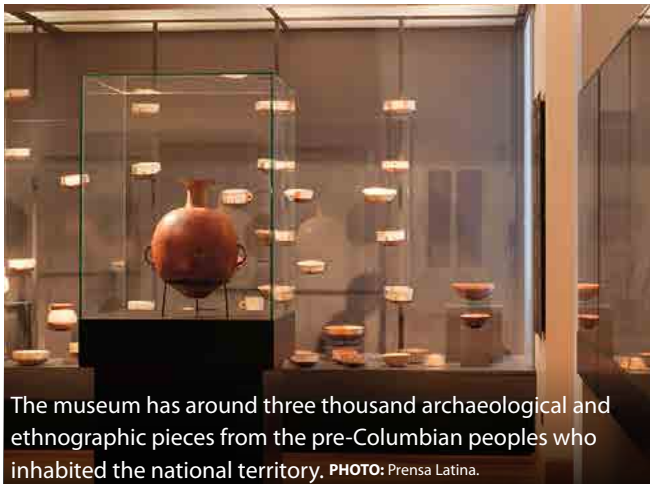
The museum has around three thousand archaeological and ethnographic pieces from the pre-Columbian peoples who inhabited the national territory.

national territory are exhibited in this museum, founded in 2006.