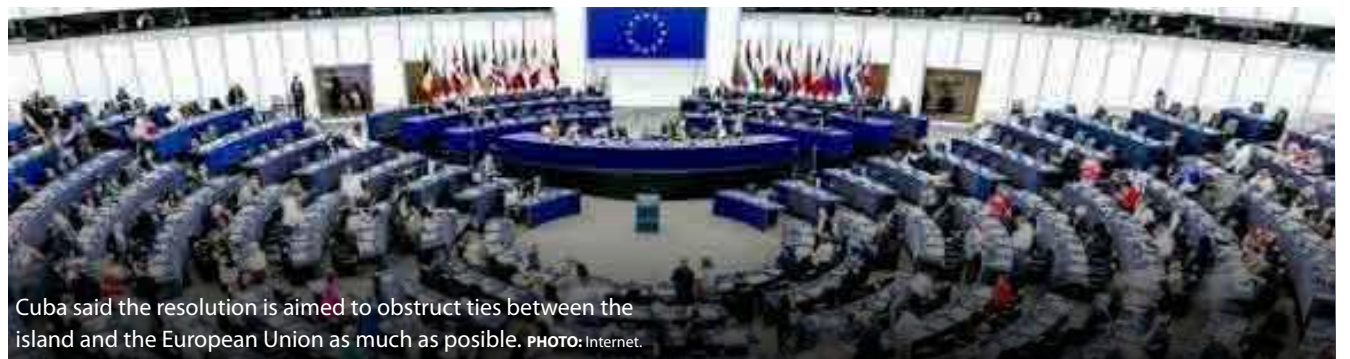
Cuba said the resolution is aimed to obstruct ties between the island and the European Union as much as possible.

Faced with the difficulties caused by a renewed U.S. blockade, the European Parliament has once again opted for confrontation, political manipulation, and hostility, rather than defending dialogue, mutual understanding, and international law, the statement notes.