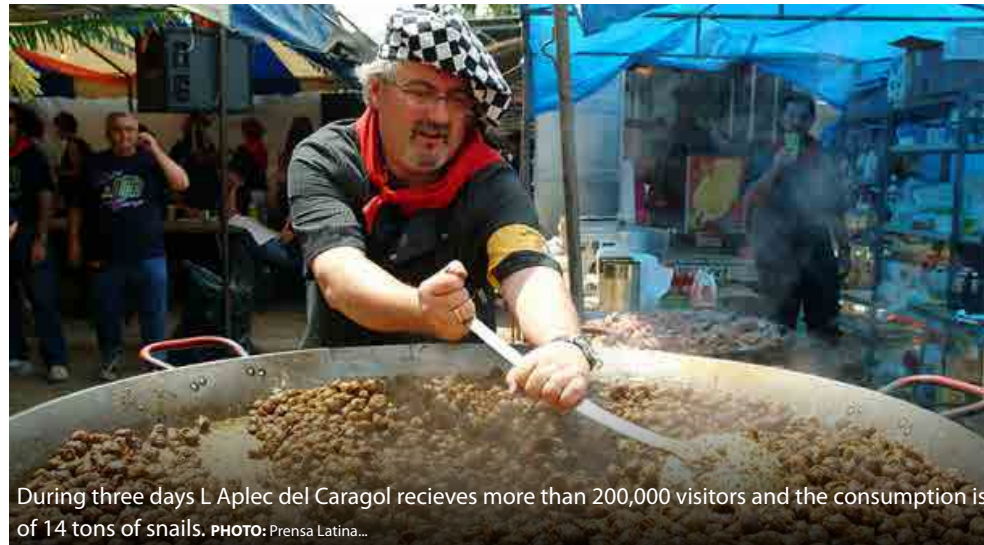
During three days L Aplec del Caragol receives more than 200,000 visitors and the consumption is of 14 tons of snails.

From the imposing hilltop, people can appreciate La Seu Vella, a Gothic relic that offers as many interpretations as a UNESCO World Heritage candidate can. Also astonishing are the historical remains of