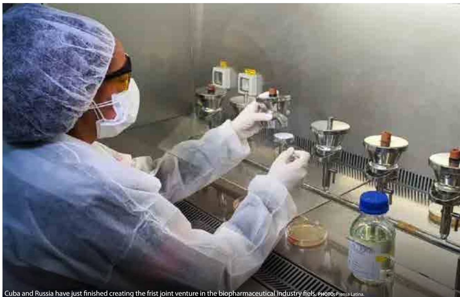
Cuba and Russia have just finished creating the first joint venture in the biopharmaceutical industry fields.

pharmaceutical industry field, which is intended to turn our plans into products, and these into commercial success, benefiting Russian patients," he concluded.