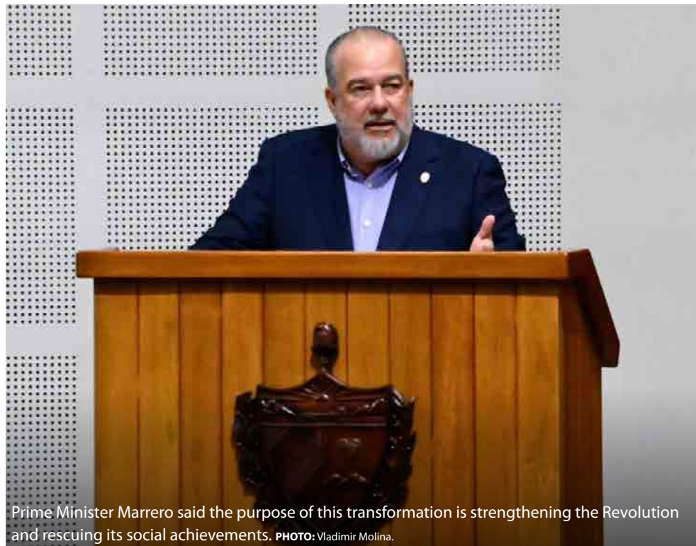
Prime Minister Marrero said the purpose of this transformation is strengthening the Revolution and rescuing its social achievements.

These transformations include leases, the granting of usufruct rights for a fee,