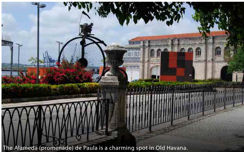
The Alameda (promenade) de Paula is a charming spot in Old Havana.