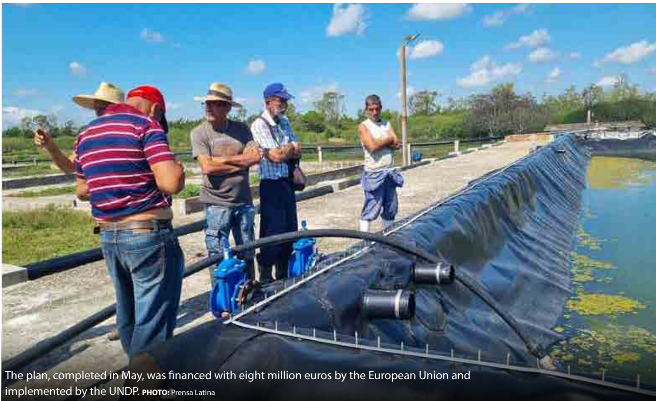
The plan, completed in May, was financed with eight million euros by the European Union and implemented by the UNDP.

“We started from the principle of giving the main role not only to the farmers, but also to territorial leaders and local governments, so that they could recognize the needs of their people and understand the new technology being installed,” she affirmed.