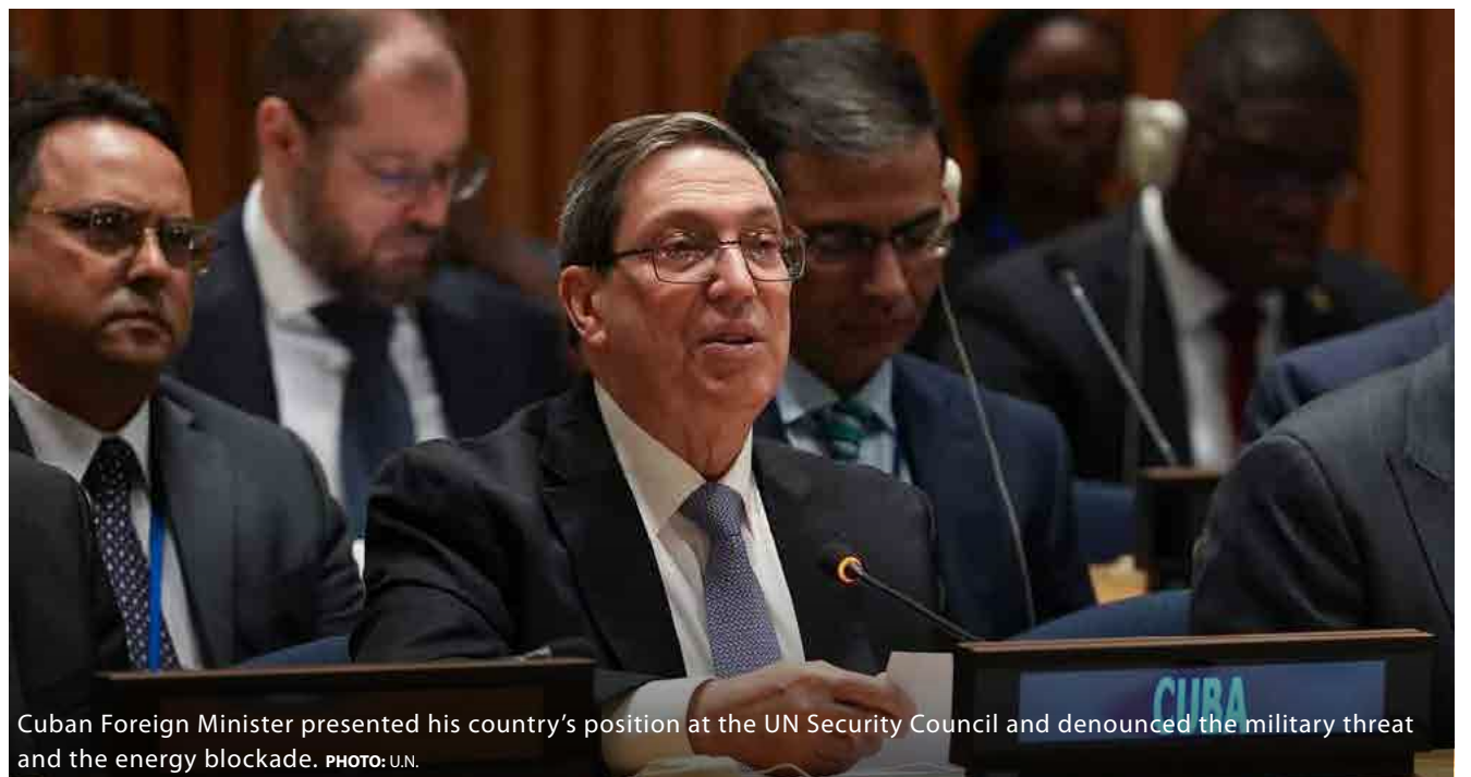
Cuban Foreign Minister presented his country’s position at the UN Security Council and denounced the military threat and the energy blockade.

Currently, he pointed out, the majority of Americans and Cubans living in the United States oppose a military adventure against Cuba, which would have incalculable humanitarian and other consequences, and they fervently oppose the energy siege that causes extraordinary human harm, suffering, deprivation, and pain to Cuban families.”