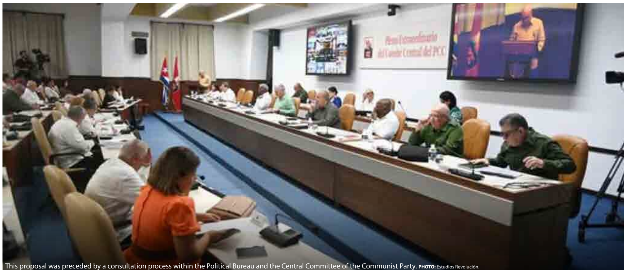
This proposal was preceded by a consultation process within the Political Bureau and the Central Committee of the Communist Party.

It was also proposed to go from regulated family food basket to controlled sales without subsidies in the retail network, creating chains of stores, restaurants and a network of light gastronomy establishments with recognized brands and others that would extend throughout the country.