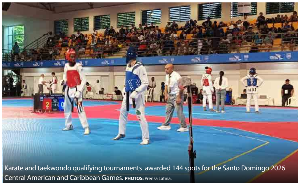
Karate and taekwondo qualifying tournaments awarded 144 spots for the Santo Domingo 2026 Central American and Caribbean Games.

Added to this result is their performance at the Dominican Open, where the team won one gold, five silver and two bronze medals, a sign of their consistent competitiveness. More than dominance, this overall result points to a position of resilience and adaptation in a region where the competition for the podium will be increasingly open at Santo Domingo 2026, starting on July 24.