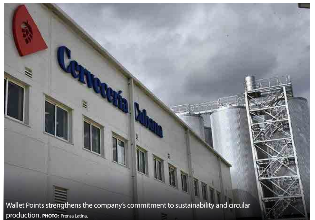
Wallet Points strengthens the company's commitment to sustainability and circular production.

Users can easily locate the nearest collection points and sale outlets using interactive maps available on the website.