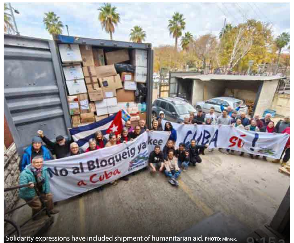
Solidarity expressions have included shipment of humanitarian aid.

Support events were also organized in Spain by the Madrid State Coordinator of Solidarity with Cuba (CESC), which, in a statement, emphasized the heroic resistance of the Cuban Revolution and described the blockade on hydrocarbons, issued by the Donald Trump administration as an "attempted genocide."