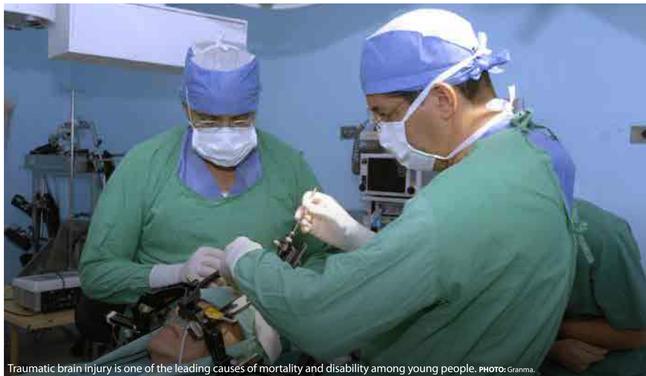
Traumatic brain injury is one of the leading causes of mortality and disability among young people.

In addition, the technological package was applied to both Cuban and foreign patients.