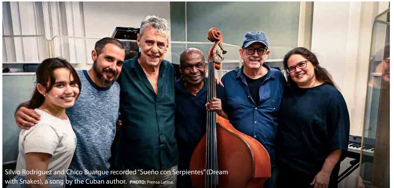
Silvio Rodríguez and Chico Buarque recorded "Sueño con Serpientes" (Dream with Snakes), a song by the Cuban author.

Originally sung on his album Días y flores (Days and Flowers), the song is rich in symbolism and metaphors in which snakes appear as challenges, representing either oppressive forces, vices or the internal struggle against one's own fears or the evils of a society.