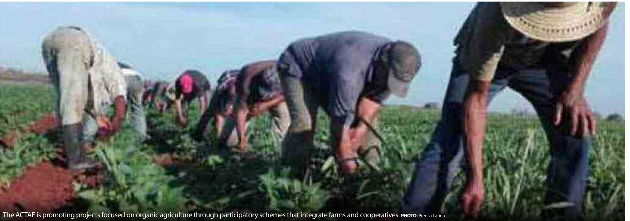
The ACTAF is promoting projects focused on organic agriculture through participatory schemes that integrate farms and cooperatives.