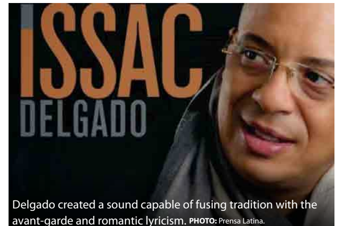
Delgado created a sound capable of fusing tradition with the avant-garde and romantic lyricism.

One of the joys the artist shares with his audience recently, arrived in the form of an album: Mira como vengo (Look how I come), a recording dedicated to celebrating life, experiences and feelings. "Made with love, with truth, with the salsa rhythm I have always played."