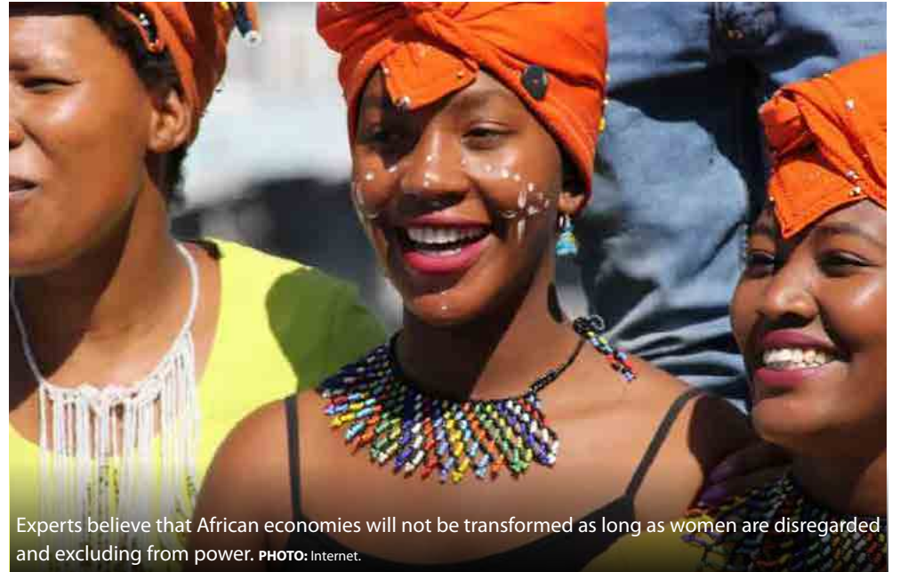
Experts believe that African economies will not be transformed as long as women are disregarded and excluded from power.