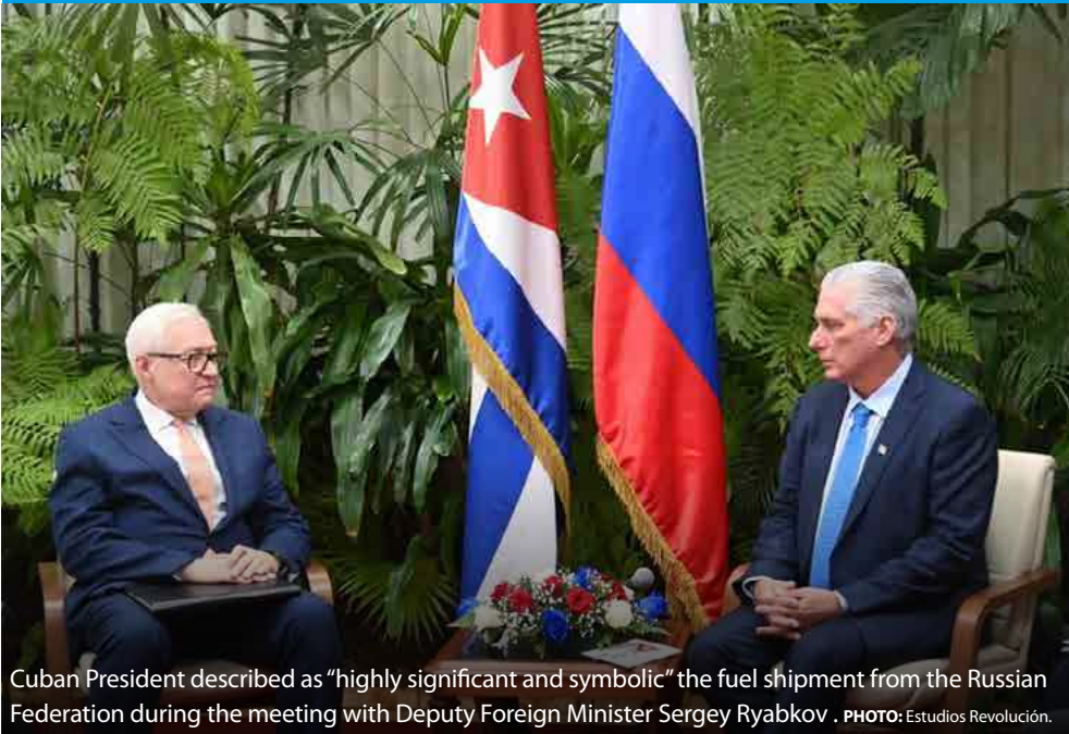
Cuban President described as "highly significant and symbolic" the fuel shipment from the Russian Federation during the meeting with Deputy Foreign Minister Sergey Ryabkov.