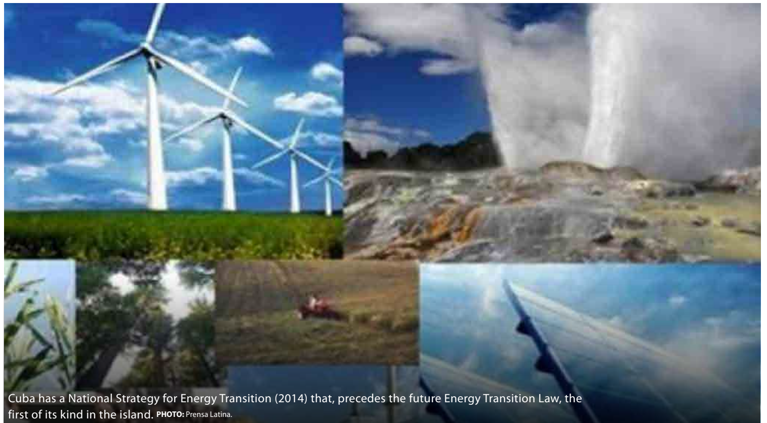
Cuba has a National Strategy for Energy Transition (2014) that, precedes the future Energy Transition Law, the first of its kind in the island.

However, the population does not perceive it that way because of the prevailing energy deficit resulting from the fuel shortage – more than 50 percent – for distributed generation, a consequence of the intensified U.S. blockade.