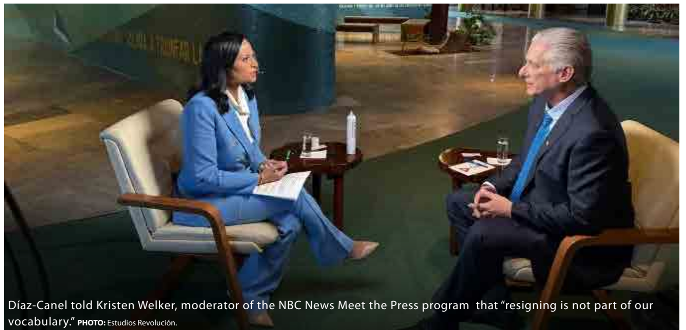
Díaz-Canel told Kristen Welker, moderator of the NBC News Meet the Press program that "resigning is not part of our vocabulary."

He also reaffirmed the policy of the Cuban Revolution regarding the fact that there can be dialogue between the two countries, and that it is possible to maintain a civilized relationship between neighbors, regardless of ideological differences.