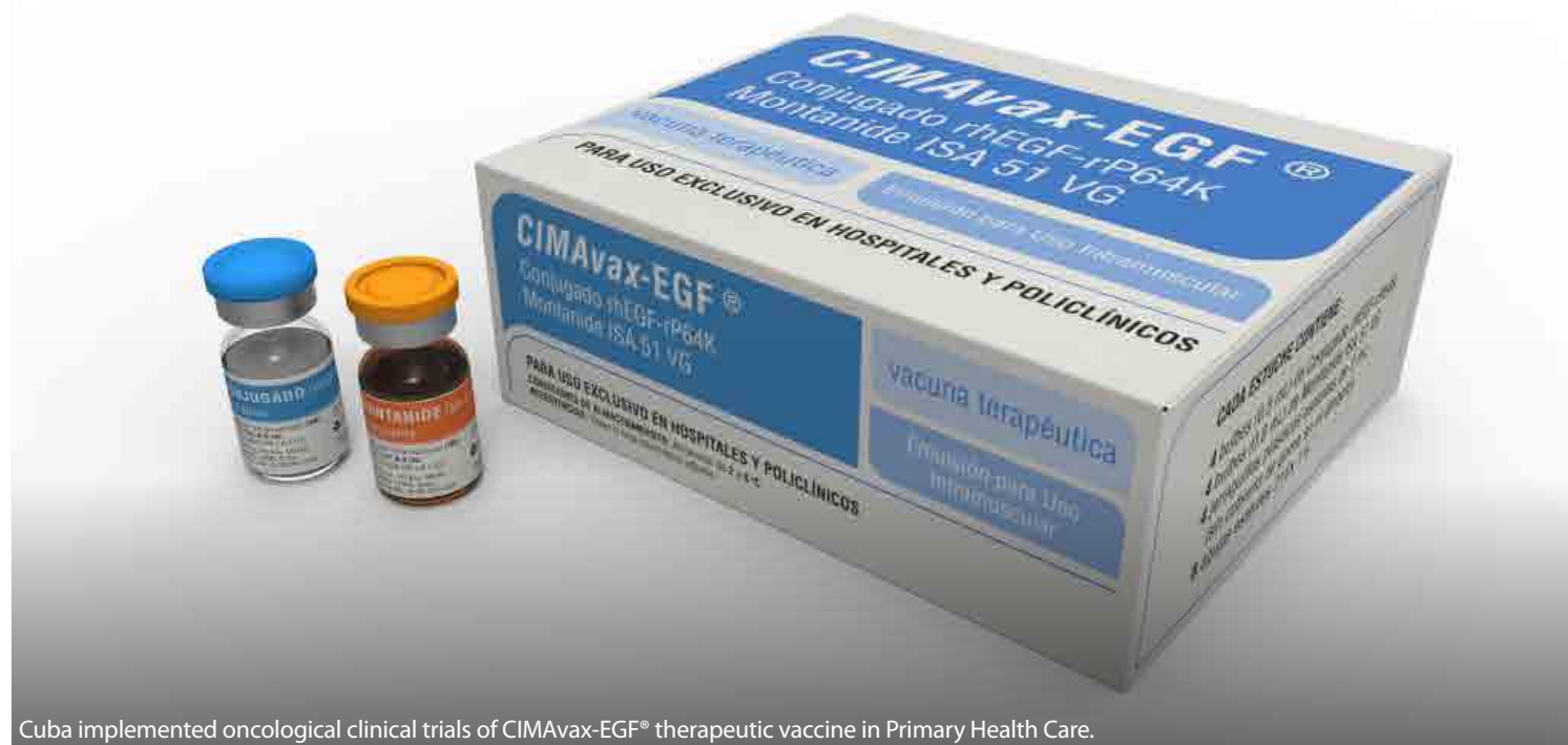
Cuba implemented oncological clinical trials of CIMAvax-EGF ® therapeutic vaccine in Primary Health Care.

In each phase, indicators were compared with both accepted standards and secondary care record. The pilot phase