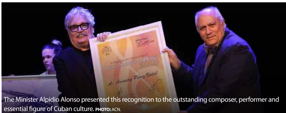
The Minister Alpidio Alonso presented this recognition to the outstanding composer, performer and essential figure of Cuban culture.

At the closing, Amaury Pérez delighted the audience with several performances, accompanied by other troubadours and thanked the jury for their unanimous decision. "Gratitude and uncertainty mix together at this moment, undoubtedly the most important of my career," the composer expressed.