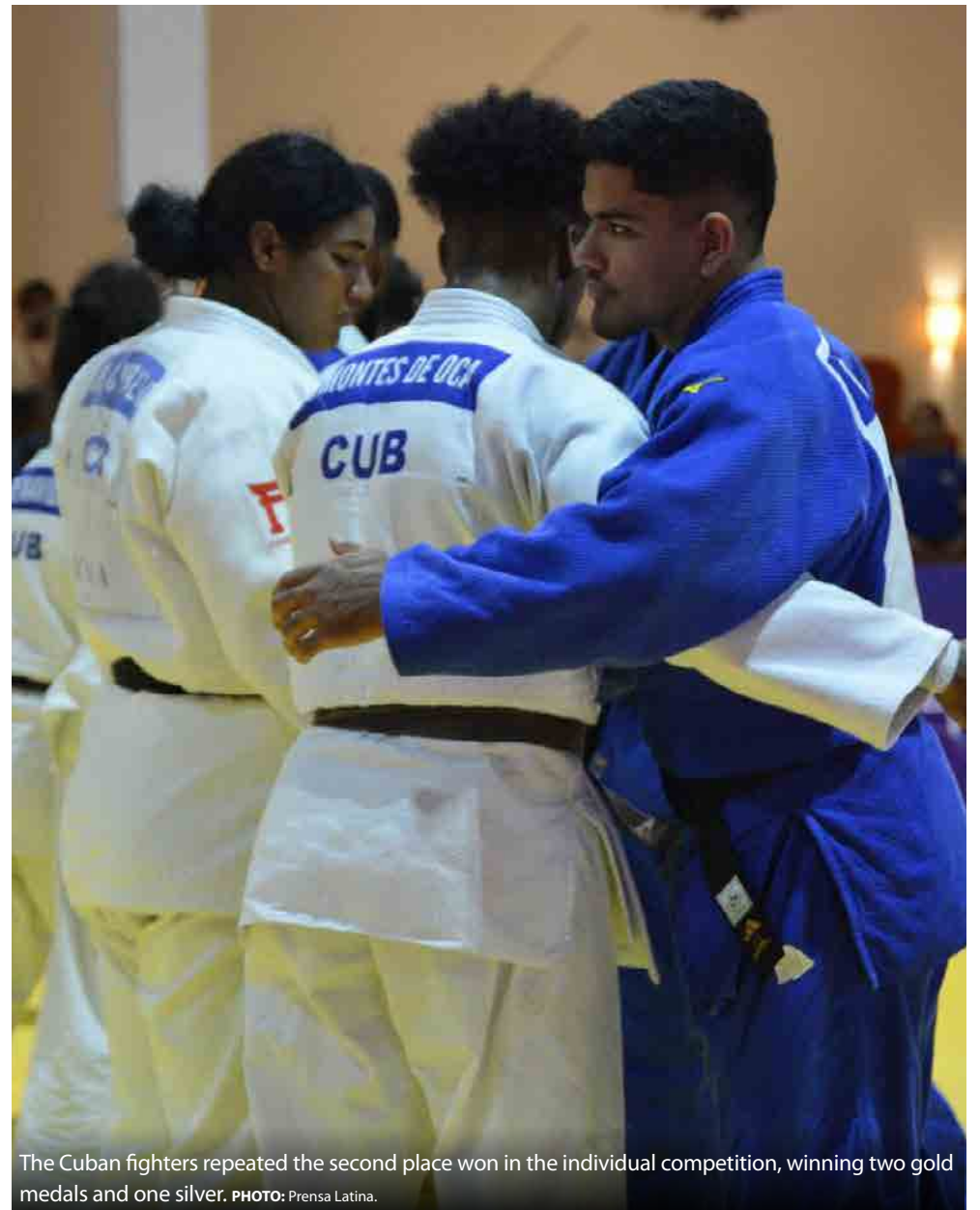
The Cuban fighters repeated the second place won in the individual competition, winning two gold medals and one silver.