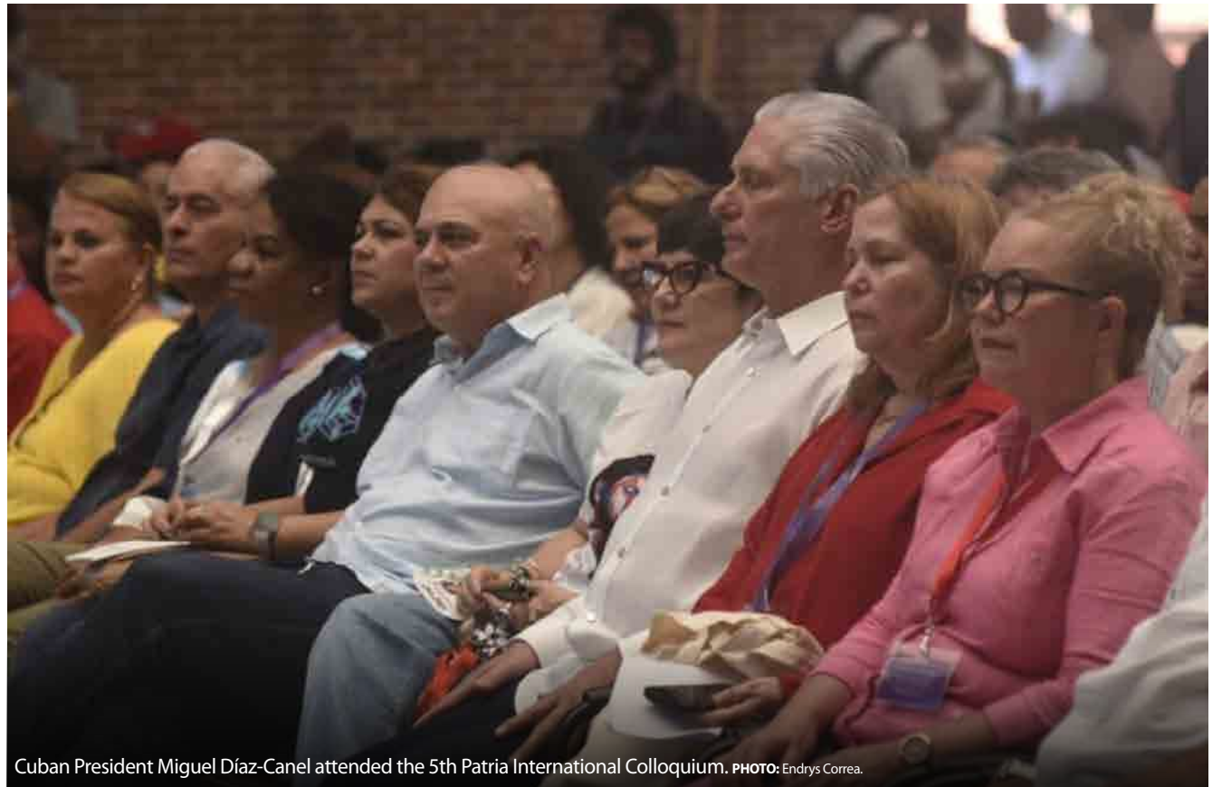
Cuban President Miguel Díaz-Canel attended the 5th Patria International Colloquium.

"Narratives are what most affect public opinion. Taking the Cuban reality as an example, the hook would be the difficulties the people face, which are true, but the narrative relies on saying that it is Cuba's own fault, that the blockade is not important," he explained.