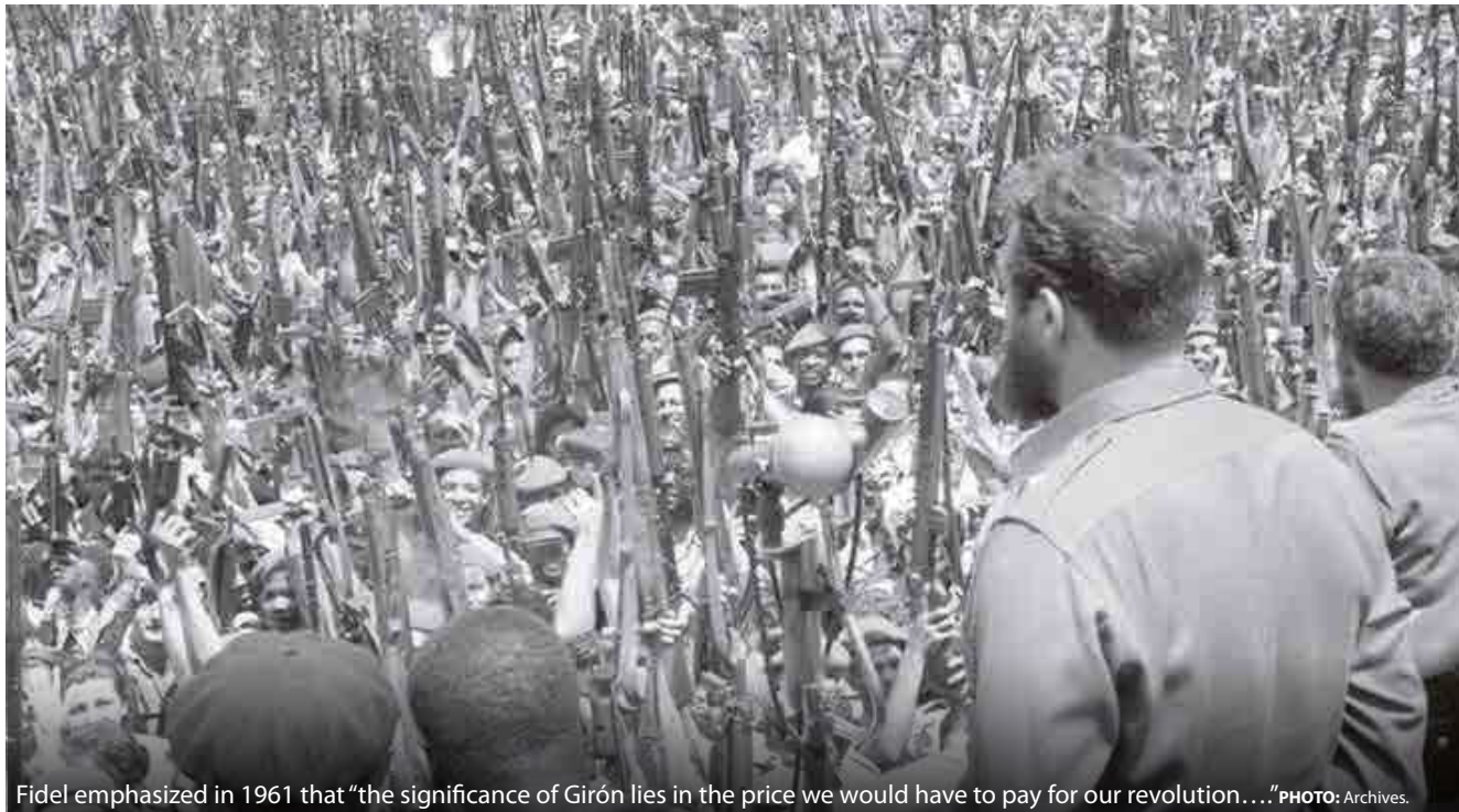
Fidel emphasized in 1961 that "the significance of Girón lies in the price we would have to pay for our revolution..."