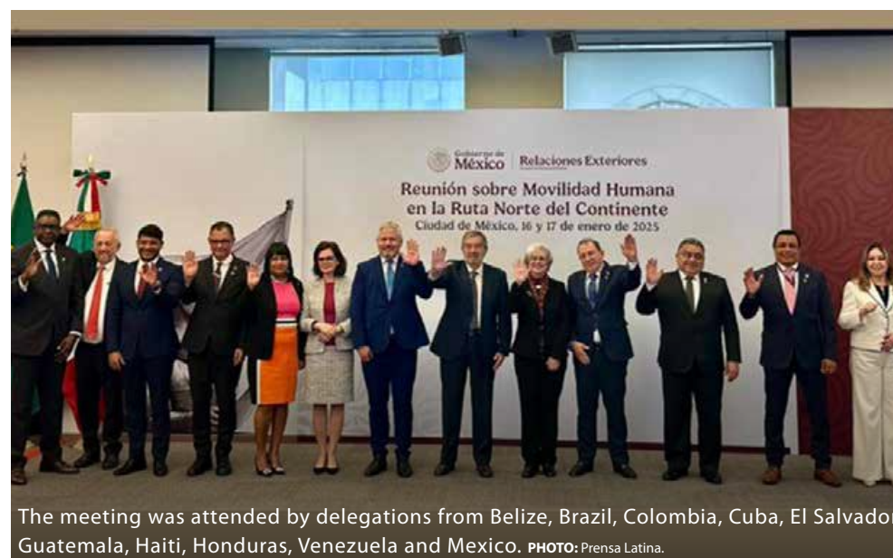
The meeting was attended by delegations from Belize, Brazil, Colombia, Cuba, El Salvador, Guatemala, Haiti, Honduras, Venezuela and Mexico.

That also requires genuine international cooperation and the political will of the developed countries, including the fulfillment of the Official Aid to Development, she stressed.