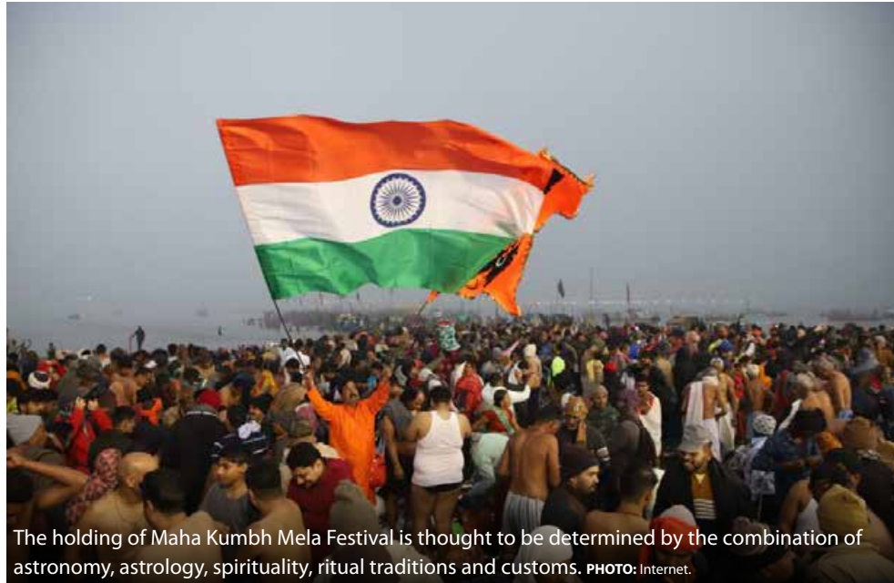
The holding of Maha Kumbh Mela Festival is thought to be determined by the combination of astronomy, astrology, spirituality, ritual traditions and customs.

In addition, the ritual's location is rotated from the cities of Haridwar, Ujjain, Nashik and Prayagraj, each at the banks of a