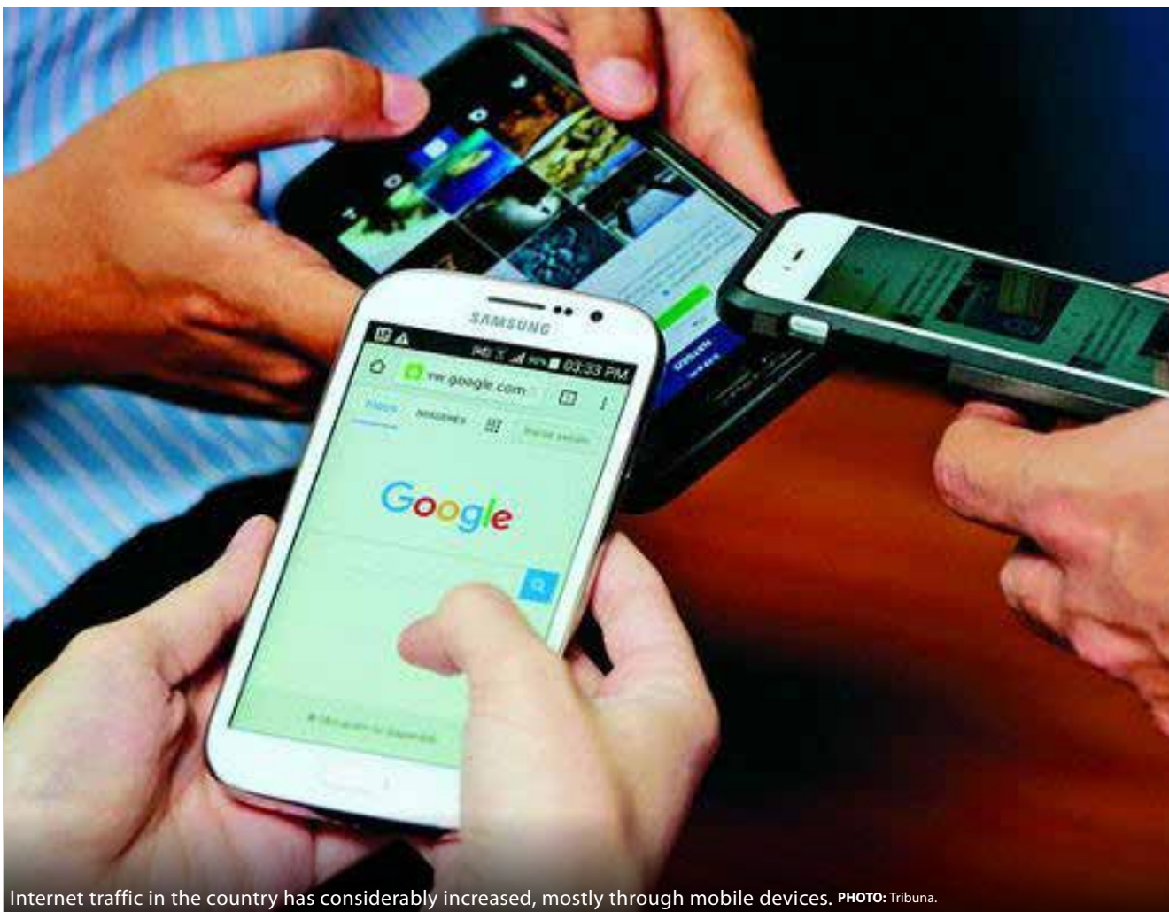
Internet traffic in the country has considerably increased, mostly through mobile devices.

In this regards, she said that projections point at taking optical fiber to homes, but the financial resources needed to meet those needs – which include not only investing to grow but also sustainability and maintenance of network elements – are not available.