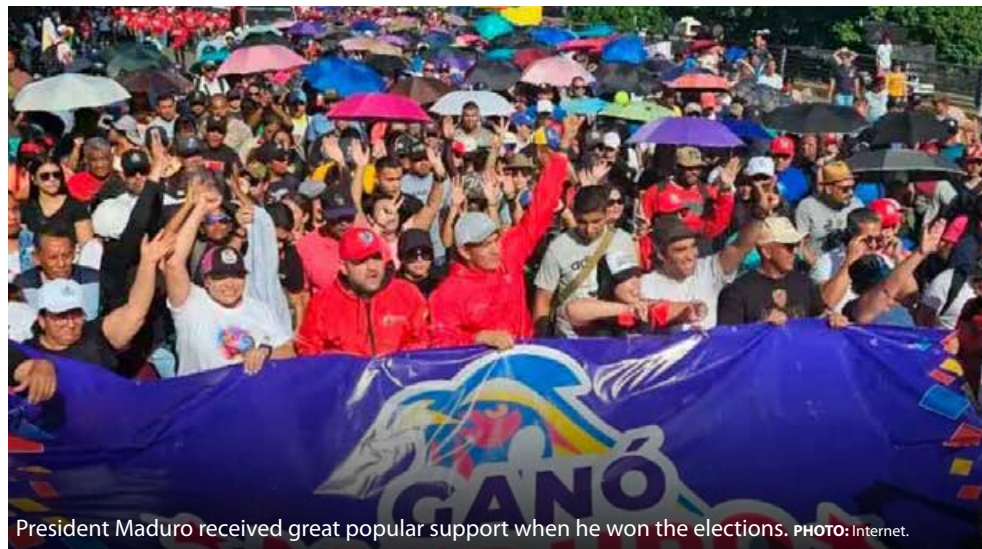
President Maduro received great popular support when he won the elections.

What the people lived on January 10, 2025 was a clear struggle between good and evil, because the U.S. imperialism and its servants turned the Venezuelan presidential election into a world election because "it was the crown's jewel", he added.