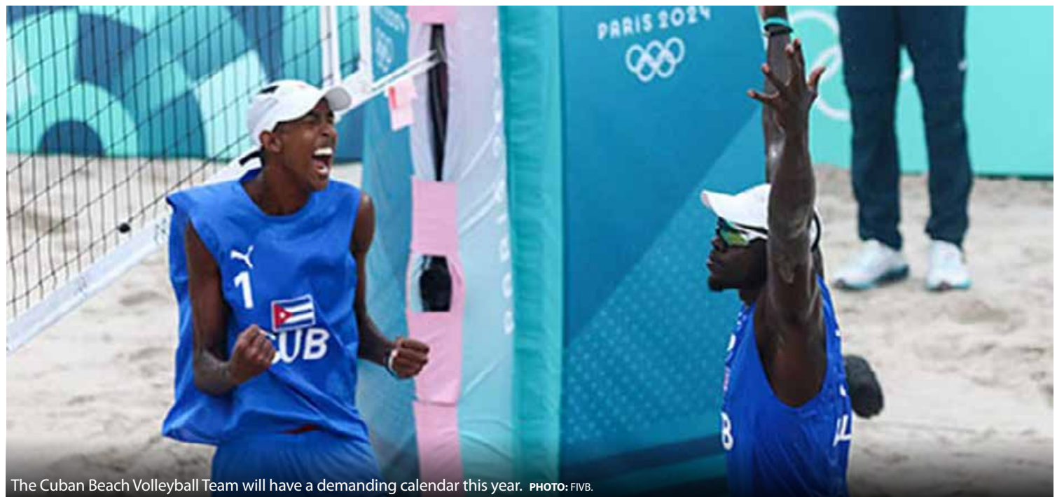
The Cuban Beach Volleyball Team will have a demanding calendar this year.

In the present Olympic cycle, their intention is not only to improve their results but also to be included among the world's Top-5 and reach the medal podium in the Los Angeles 2028 Olympic Games.