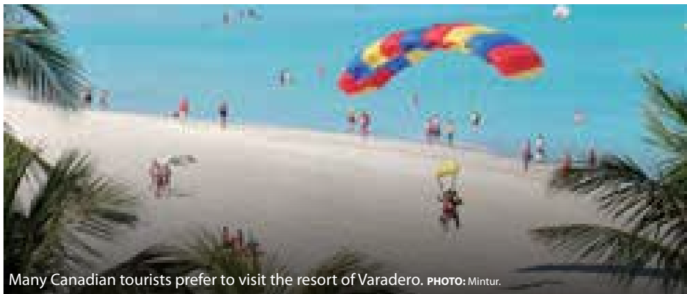
Many Canadian tourists prefer to visit the resort of Varadero.

To foster all these actions, entry requirements to the country were eased through the electronic visa, which will coexist with regular mechanisms until June 30 the present year (when the first will prevail) and the establishment of temporary telephone lines for seven days, travelers' constant request.