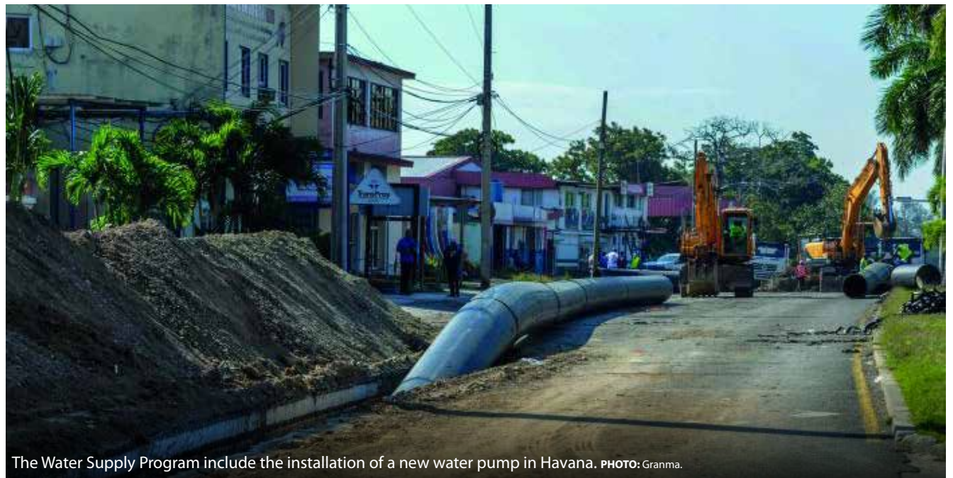
The Water Supply Program include the installation of a new water pump in Havana.

This project will favor water supply to the inhabitants of the Cerro and Plaza de la Revolución municipalities, in the capital. Chapman had previously visited the engineering works the INRH conducts at the San Luis municipality, in the Santiago de Cuba province, where this vital service must reach 15,000 inhabitants of that eastern region.