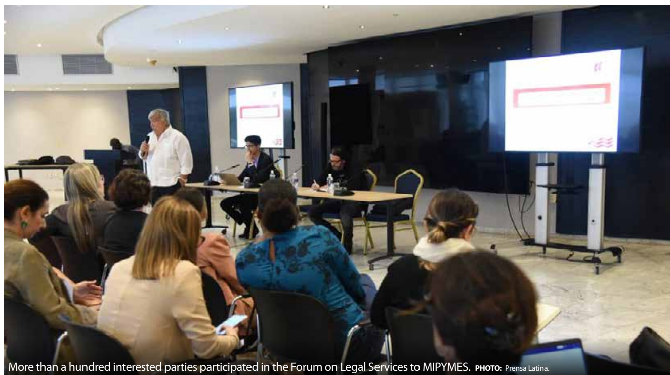
More than a hundred interested parties participated in the Forum on Legal Services to MIPYMES.