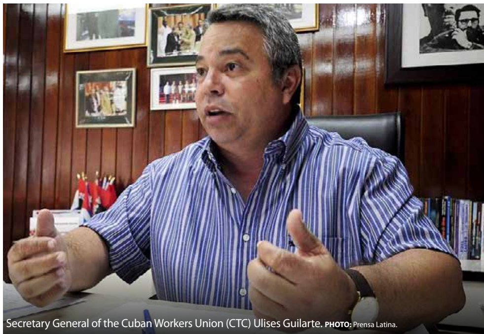
Secretary General of the Cuban Workers Union (CTC) Ulises Guilarte.

In his speech at the Havana's provincial plenary session of the CTC XXII Congress Conference to check the progress made in the municipal conferences, Guilarte highlighted the importance of strengthening trade union's municipal structures in the capital, for being the most industrialized province and the territory that should make the highest economic contribution to the country.