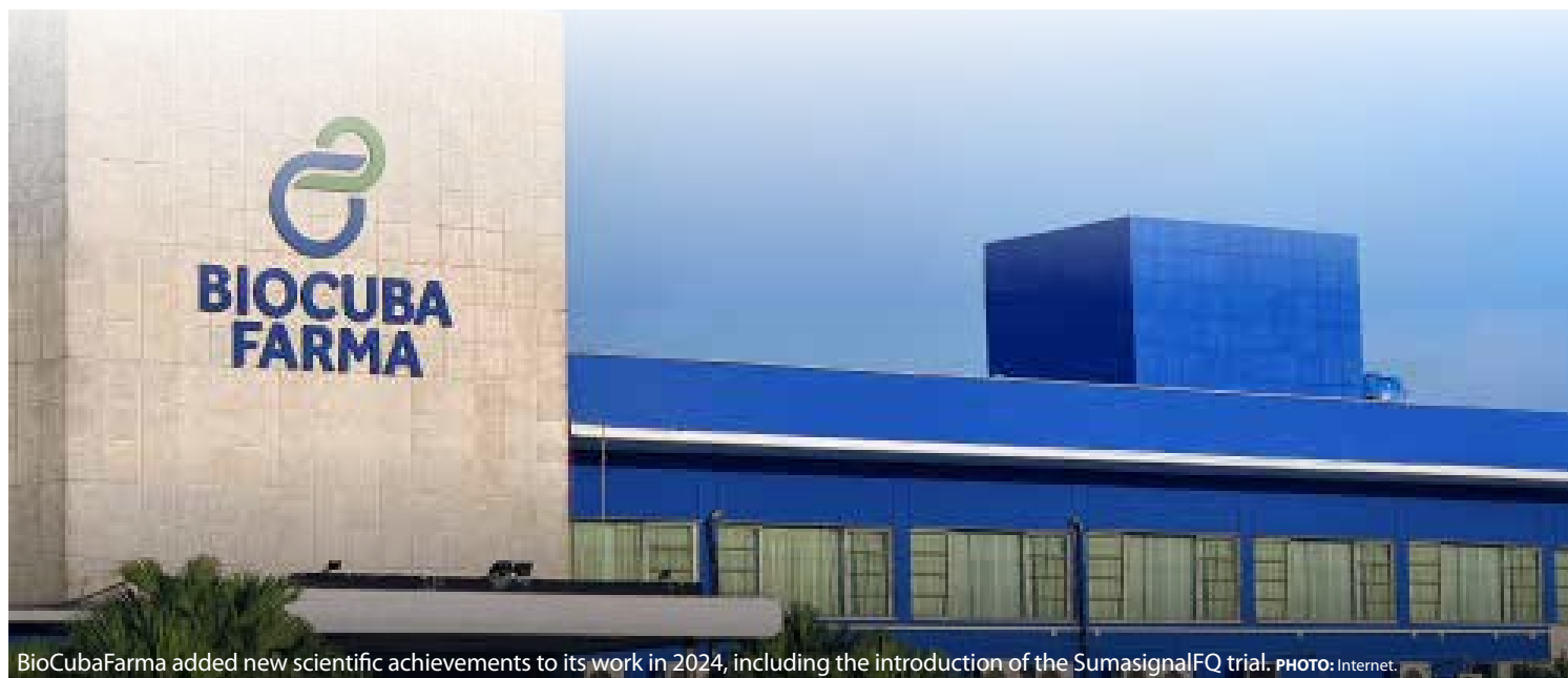
BioCubaFarma added new scientific achievements to its work in 2024, including the introduction of the SumasignalFQ trial.

Three processes developed by the Genetic Engineering and Biotechnology Center (CIGB) also stand out: first, new clinical and non-clinical evidence of the therapeutic effects of Juzvinza; second, the approval, by the United States Food and Drug Administration, of a new medication under research for clinical study phase three of the Heberprot-P in that country. The third is the transfer of technology of the Hebernem/Aikexian product to the Shandong Lukang Heber Biotec, Co Ltd. joint company, for introduction in China's agricultural production.