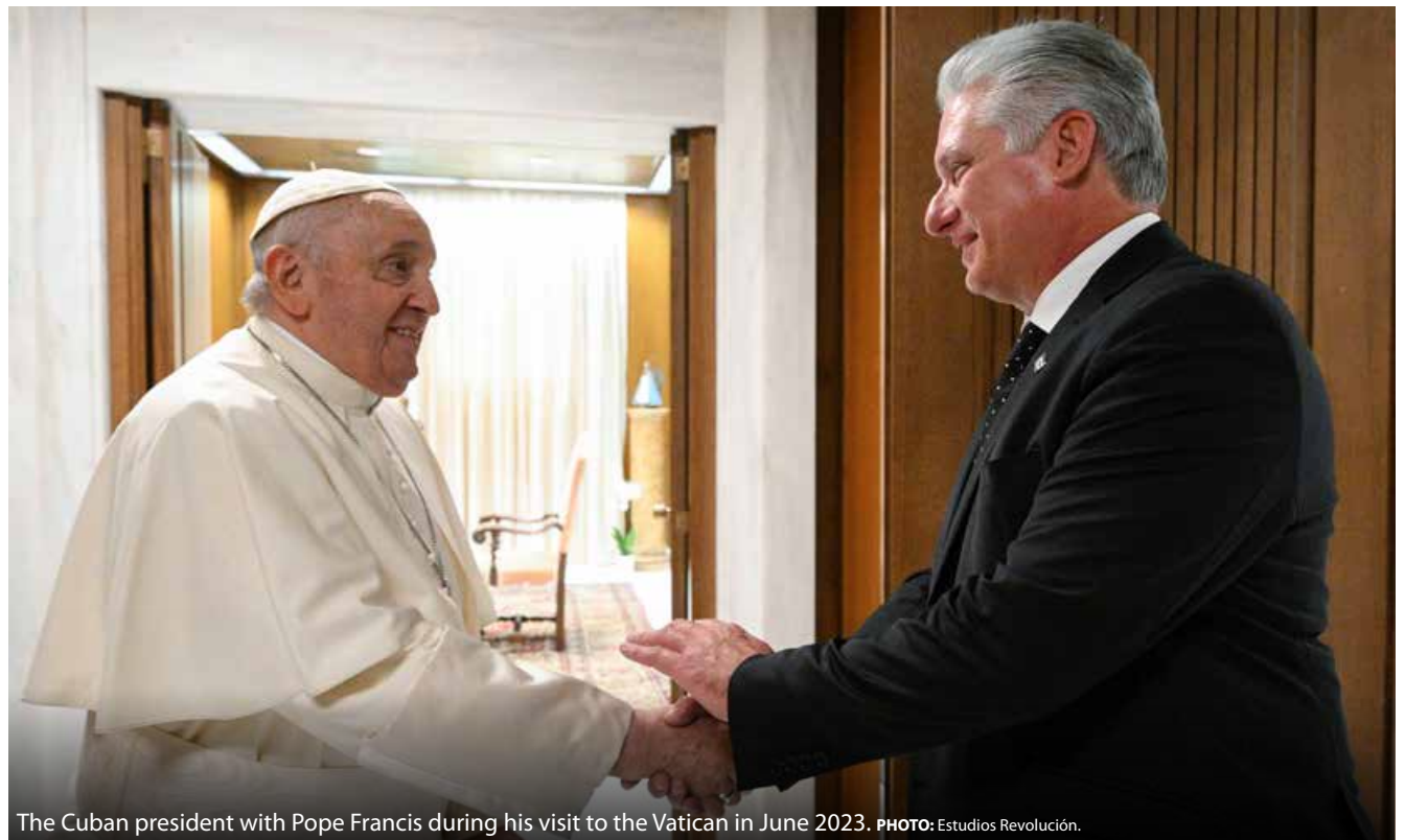
The Cuban president with Pope Francis during his visit to the Vatican in June 2023.

Relations between Cuba and the Vatican were established in 1935 during the pontificate of His Holiness Pius XI. The Caribbean nation was one of the first Latin American countries to establish relations with the Vatican.