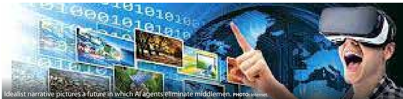
Idealist narrative pictures a future in which AI agents eliminate middlemen.

However, an in-depth analysis shows that online travel agencies (OTAs) will not only survive this transition but could also grow stronger.