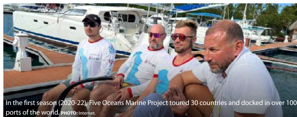
In the first season (2020-22), Five Oceans Marine Project toured 30 countries and docked in over 100 ports of the world.

Their stop in Cuba was endorsed by the Russian house of the Havana city Historian Office, the Russian Embassy in Cuba, the Russian Agency for Cooperation, the Cuban Environmental Agency, among other organizations.