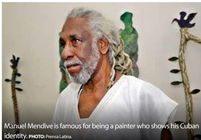
Manuel Mendive is famous for being a painter who shows his Cuban identity.

Born in Havana, on December 15, 1944, Mendive graduated from the San Alejandro Academy in 1963. A year later, he presented his first individual exhibition and since then, his work has toured some of the most important art institutions in the world.