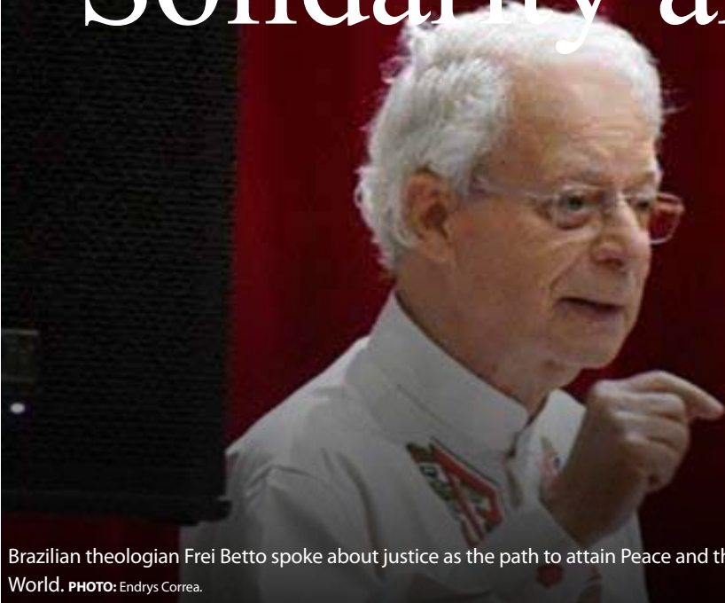
Brazilian theologian Frei Betto spoke about justice as the path to attain Peace and the Balance of the World.