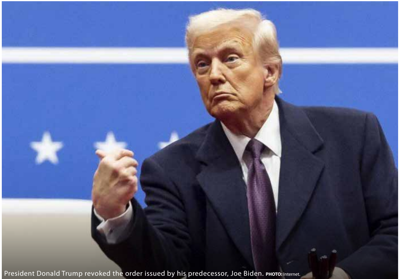
President Donald Trump revoked the order issued by his predecessor, Joe Biden.

They denounced that Trump's action tries to strengthen the economic war Washington triggered,