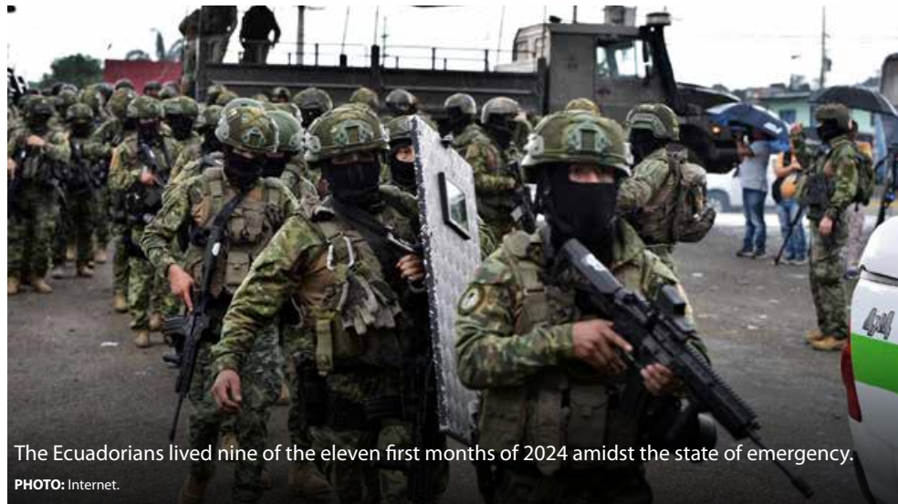
The Ecuadorians lived nine of the eleven first months of 2024 amidst the state of emergency.

According to that body, 34,952 persons were arrested until May 2024 as part of the questionable security strategy, called Plan Félix, while the district attorney's office registered 226 reports of authority abuse on the part of the security forces until June and opened 12 investigations of potential extrajudicial executions.