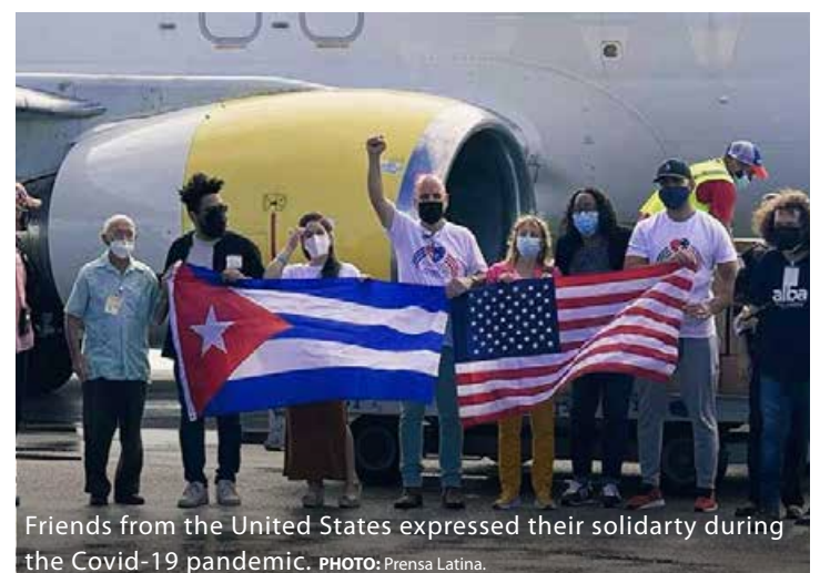
Friends from the United States expressed their solidarity during the Covid-19 pandemic.