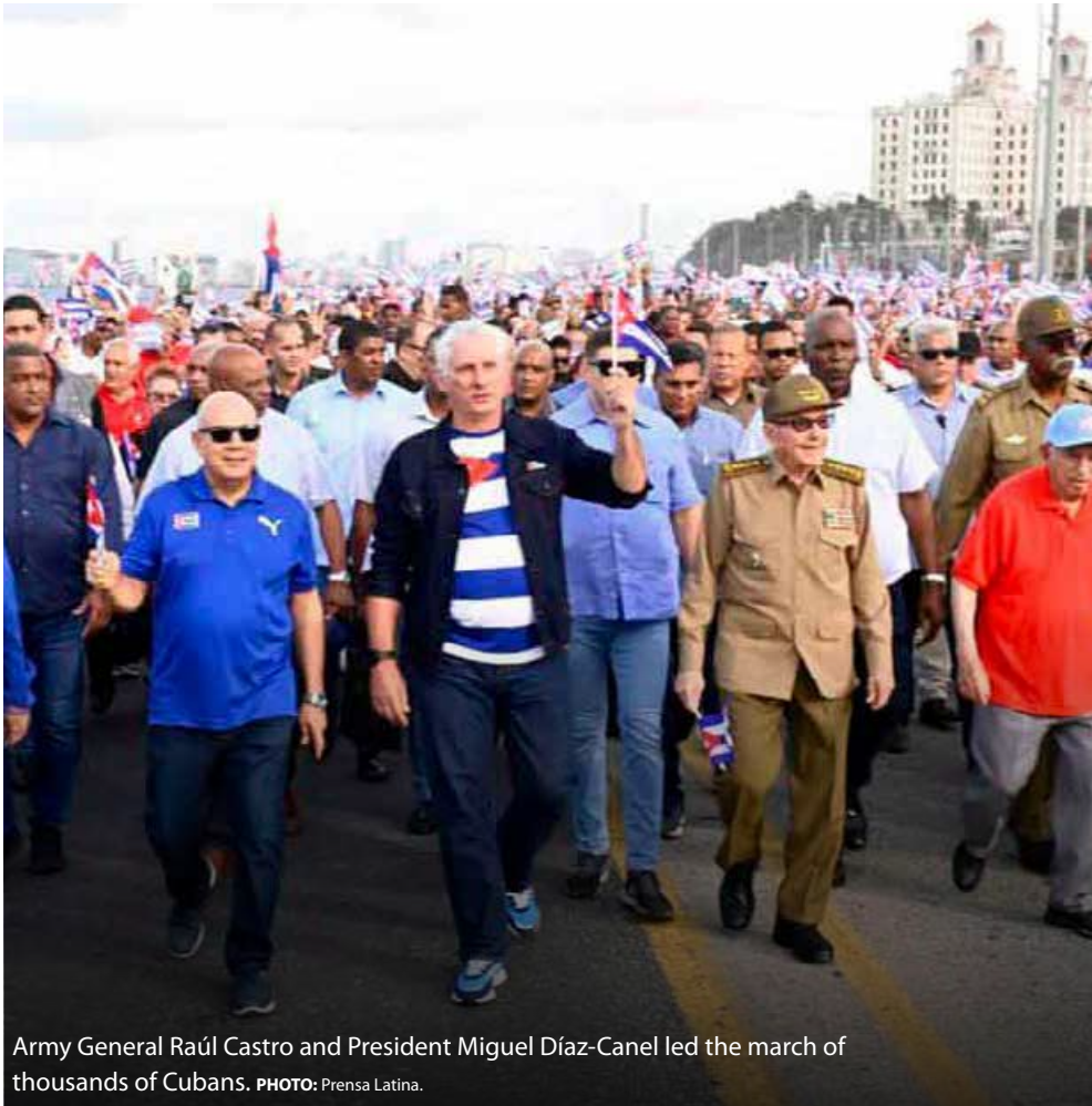
Army General Raúl Castro and President Miguel Díaz-Canel led the march of thousands of Cubans.