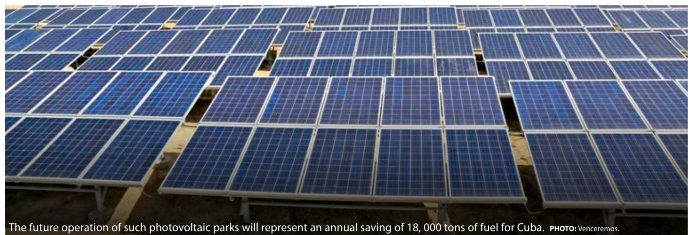
The future operation of such photovoltaic parks will represent an annual saving of 18, 000 tons of fuel for Cuba.