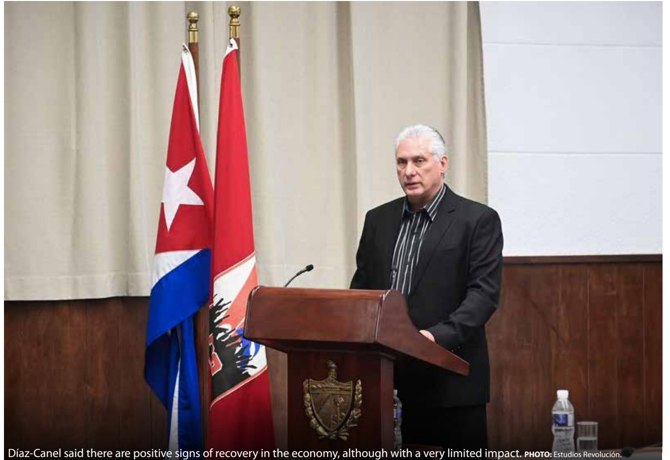
Díaz-Canel said there are positive signs of recovery in the economy, although with a very limited impact.

The country must eliminate dependence on imports, assuming those that are strictly necessary, such as raw materials and consumables for productive processes, highlighted the head of State.