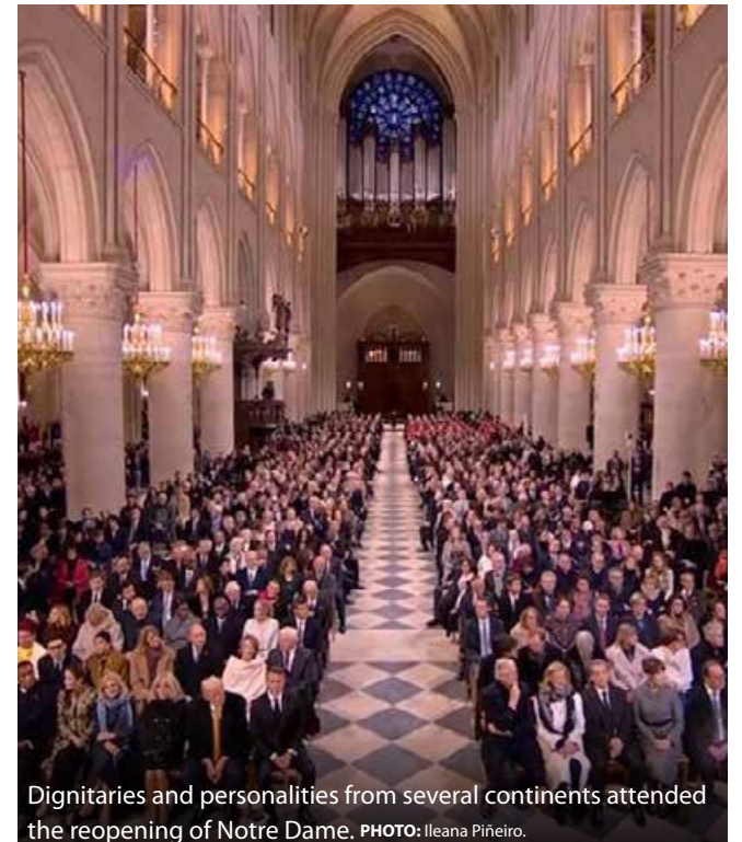
Dignitaries and personalities from several continents attended the reopening of Notre Dame.

Culture minister Rachida Dati (outgoing) caused controversy after suggesting charging an entrance fee to the famous cathedral.