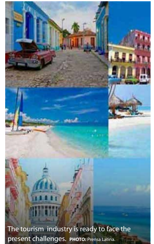
The tourism industry is ready to face the present challenges.