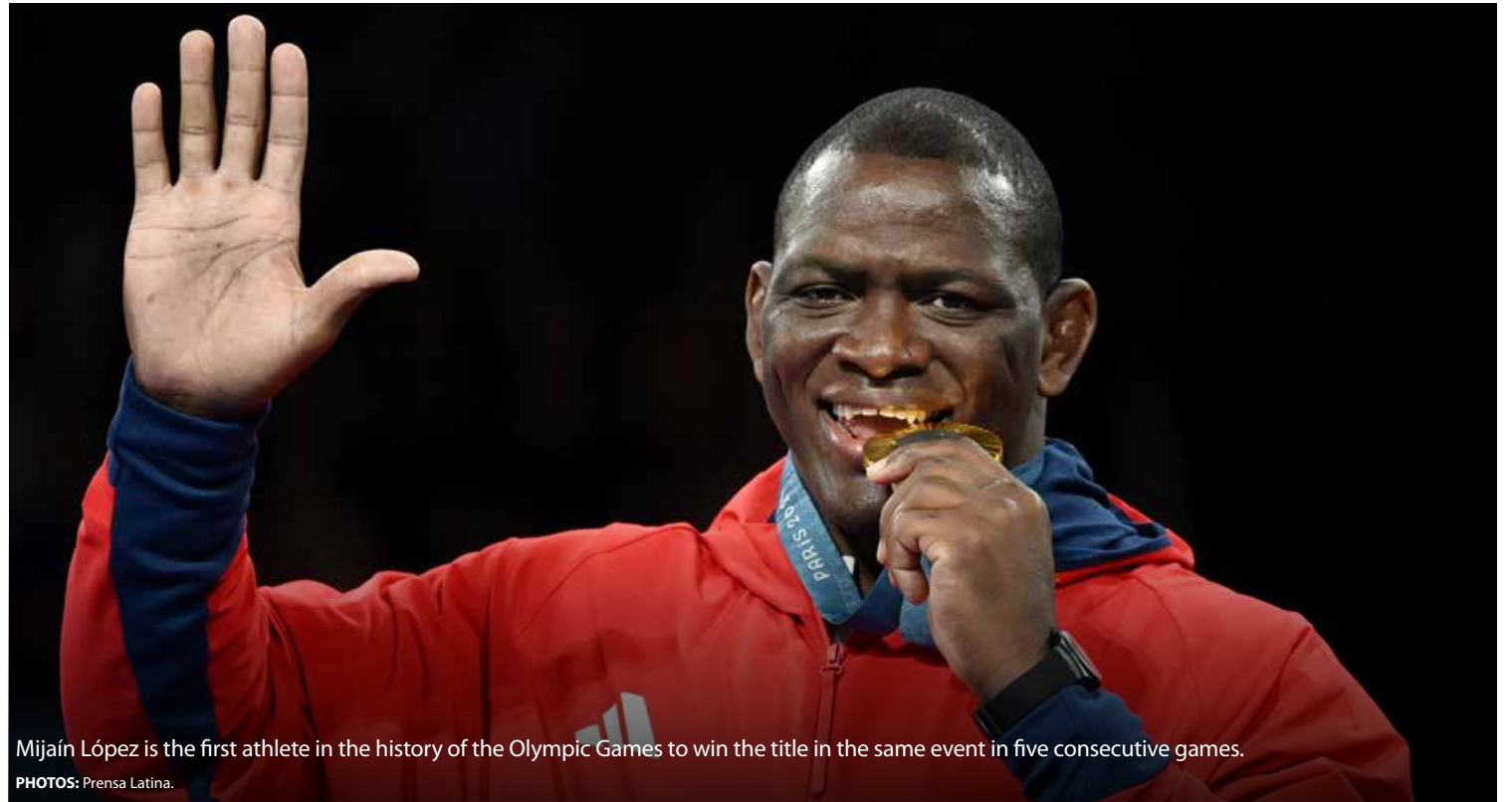
Mijaín López is the first athlete in the history of the Olympic Games to win the title in the same event in five consecutive games.

With the conclusion of this 60th edition, historical list of winners is still headed by Jamaican sprinter Usain Bolt among the men (six nominations), followed by