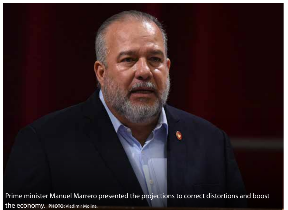
Prime minister Manuel Marrero presented the projections to correct distortions and boost the economy.

He stated that overcoming the obstacles Washington's policy imposes on Cuba "depends on what we are capable of doing and promoting, with the heroism, intelligence and creativity that characterizes us as a people."