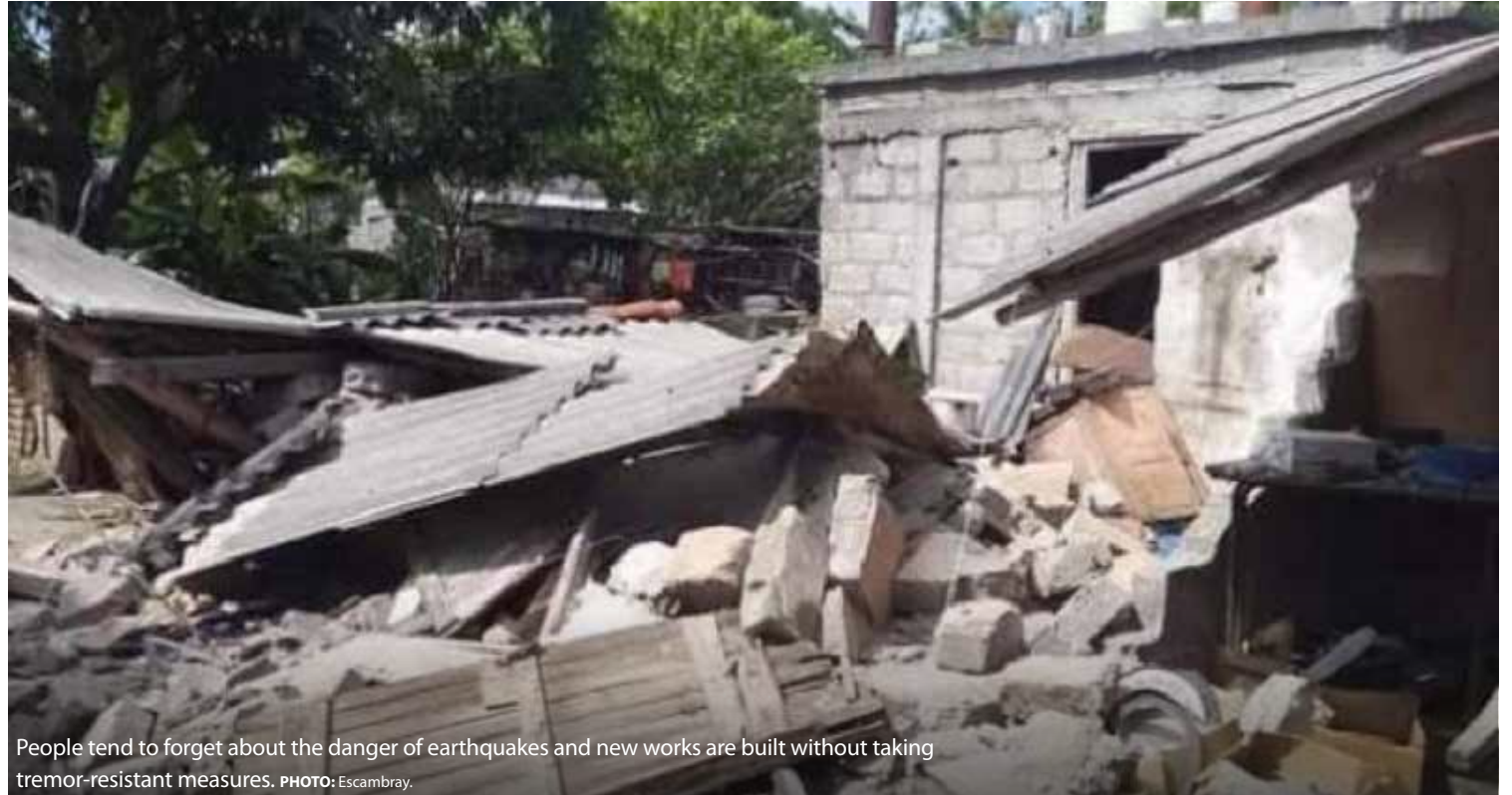
People tend to forget about the danger of earthquakes and new works are built without taking tremor-resistant measures.

Specialists stress that although aftershocks can or cannot be perceived by people, the truth is that those vibrations continue