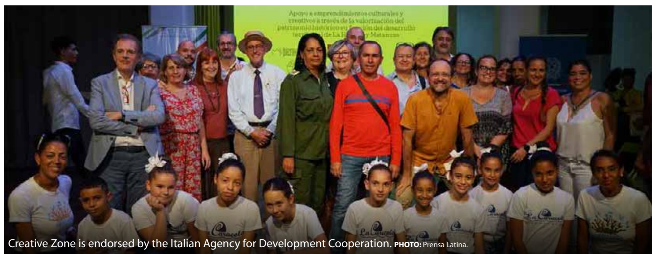
Creative Zone is endorsed by the Italian Agency for Development Cooperation.

"Through our investment of three million euros and a strategic alliance with Italian NGOs, we try to create a lasting impact on the creation of jobs, the formation and sustainability of cultural projects in Cuba," he said.