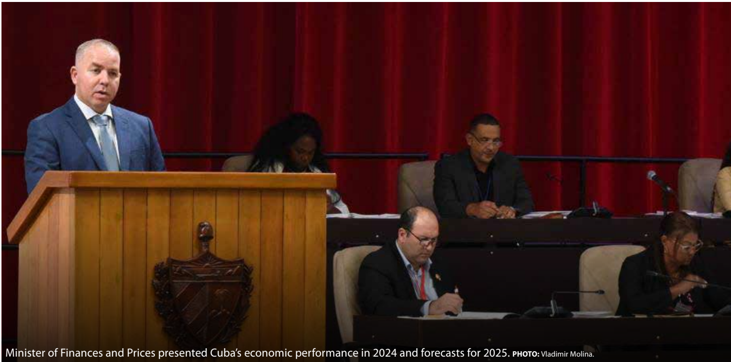
Minister of Finances and Prices presented Cuba's economic performance in 2024 and forecasts for 2025.

"The budget allocated to Public Administration, communal services and defense is essential to guarantee the correct functioning of government institutions and national security protection, to which 93,237,000,000 will be allocated," the minister affirmed.