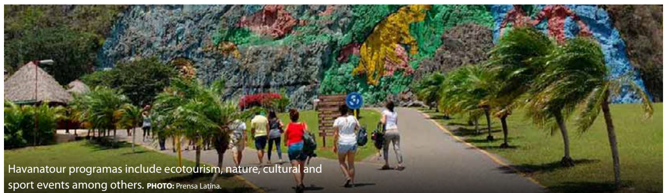
Havanatur programas include ecotourism, nature, cultural and sport events among others.

At the launch of the catalog, the young executive explained that the program is made under the principle of promotion, coordination and facilitation, in order to attain higher efficiency and quality in their work.