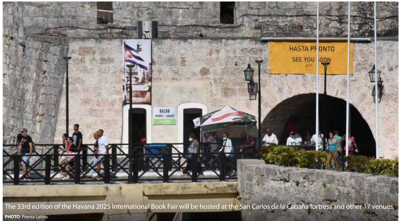
The 33rd edition of the Havana 2025 International Book Fair will be hosted at the San Carlos de la Cabaña fortress and other 17 venues.

With the Federal Republic of Brazil as guest country of honor in February 2024, over 450,000 people attended the 32nd edition of the Havana Fair, which received 435 publishing houses representatives and booksellers from 56 countries, a record of representation in Cuba's most important editorial and literary forum, the ICL president said.