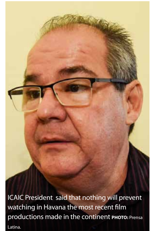
ICAIC President said that nothing will prevent watching in Havana the most recent film productions made in the continent.

To the young public, the La Renga rock band filled the emblematic Havana corner of 23 y 12 with its music. In this site, hundreds of rock fans, national and foreign, enjoyed for hours a selection of the band's discs, unpublished themes and other songs included in its current tour.