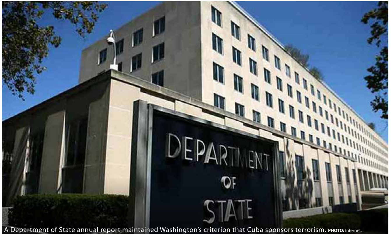
A Department of State annual report maintained Washington's criterion that Cuba sponsors terrorism.

That is how he reduced U.S. people's visits to Cuba; prohibited cruise ships, flights, educational trips, and in February 2017, the then new administration accused the island, without any evidence, of an alleged acoustic attacks against their diplomats in Havana.