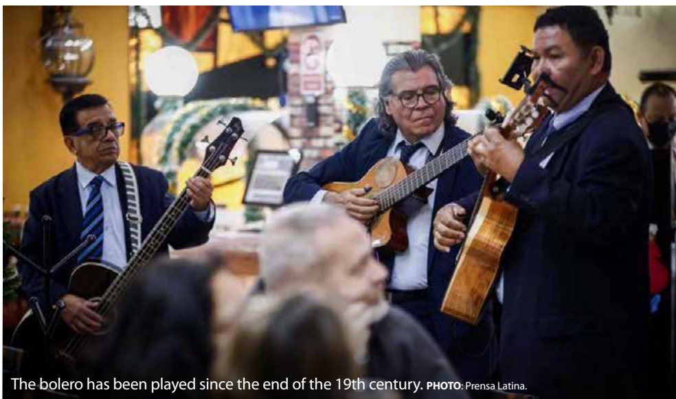
The bolero has been played since the end of the 19th century.

That is the only Cuban song variant that is danced slowly, a feature that is also part of courtship, that romantic and seductive relationship, the expert concluded.