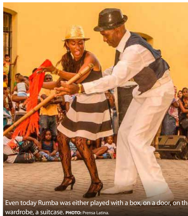
Even today Rumba was either played with a box, on a door, on the wardrobe, a suitcase.

One of rumba's main exponents was percussionist Federico Arístides Soto (Tata Güines, 1930-2008), who followed the path of another big name – Chano Pozo – and stood out for