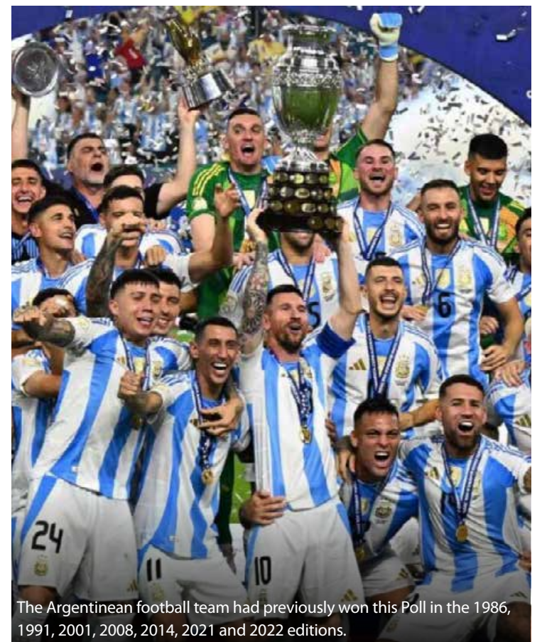
The Argentinean football team had previously won this Poll in the 1986, 1991, 2001, 2008, 2014, 2021 and 2022 editions.

Cuban Javier Sotomayor, aka the “Prince of Heights” (5). In the case of women, the list is headed by Colombian Caterine Ibargüen and Venezuelan Yulimar Rojas (five each), followed by Cuban Ana Fidelia Quirot (4).