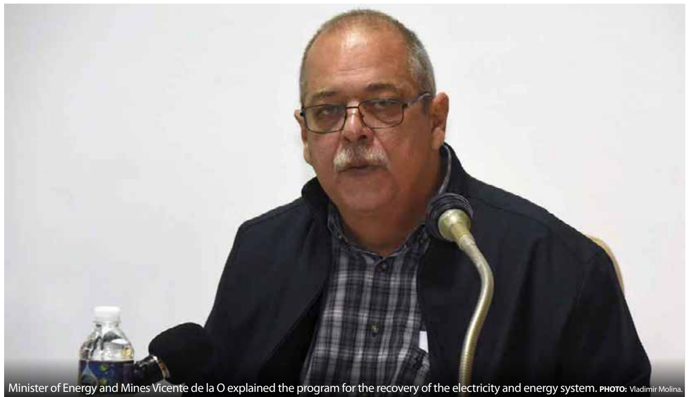
Minister of Energy and Mines Vicente de la O explained the program for the recovery of the electricity and energy system.

De la O reiterated that the Government program to recover SEN is part of a constant work system that establishes the path to electricity generation and fuel supply, not only to meet the current demand but also to allow "the development of our economy and our people's access, 24 hours a day, to the electricity service".