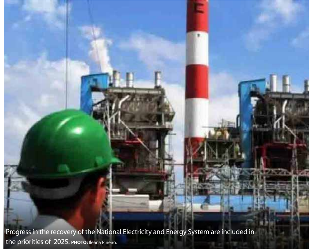
Progress in the recovery of the National Electricity and Energy System are included in the priorities of 2025.

alternative to face the recovery challenges and boost the economy again, in conditions of economic war and strengthening of the economic and financial crisis worldwide," Marrero stressed.