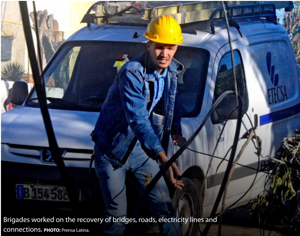
Brigades worked on the recovery of bridges, roads, electricity lines and connections.