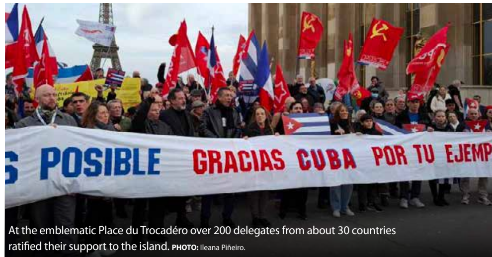
At the emblematic Place du Trocadéro over 200 delegates from about 30 countries ratified their support to the island.