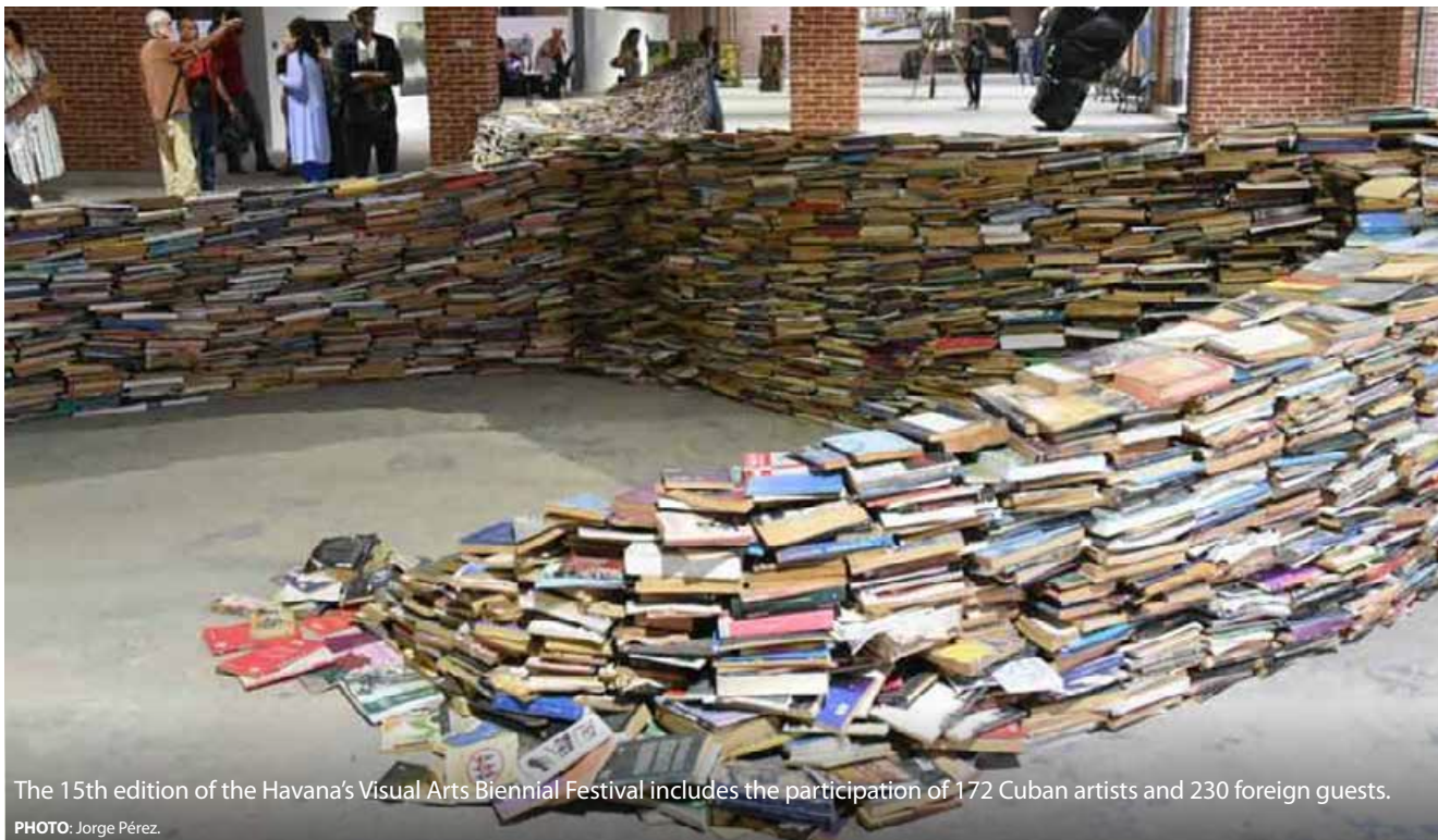
The 15th edition of the Havana's Visual Arts Biennial Festival includes the participation of 172 Cuban artists and 230 foreign guests.

The present edition includes creators from Mexico, Venezuela, Cuba, Peru, Brazil, Colombia, Mongolia, Turkey, Iran, Germany, Austria, Japan, among others.