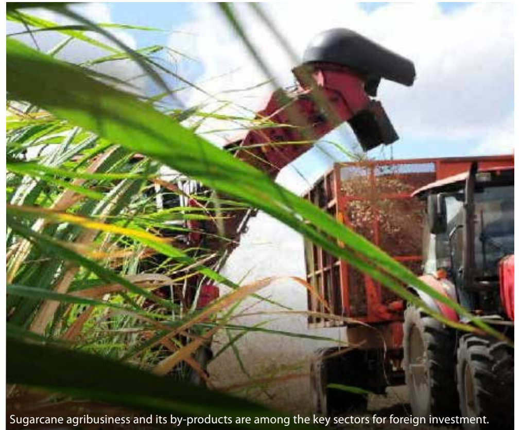
Sugarcane agribusiness and its by-products are among the key sectors for foreign investment.