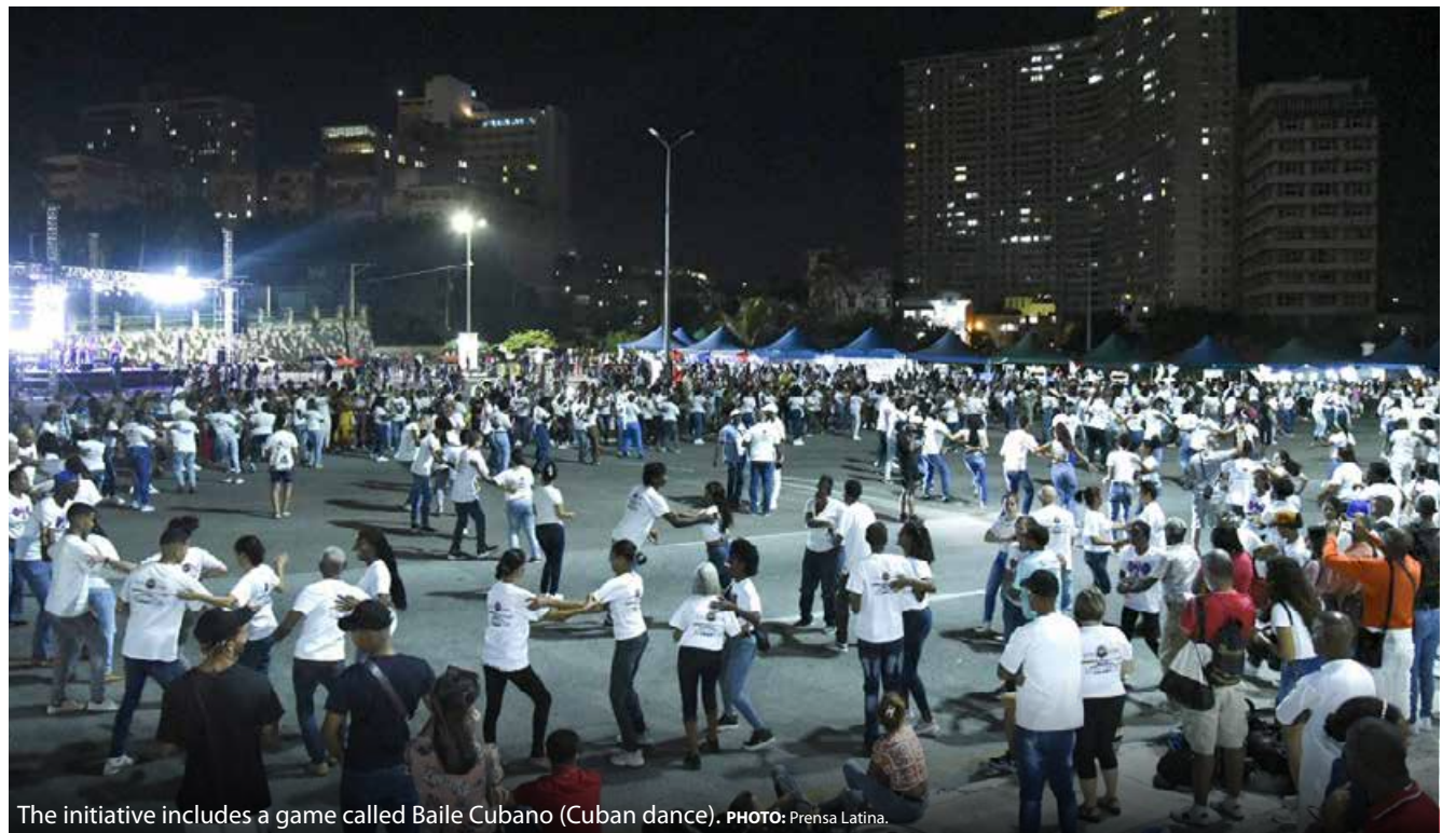
The initiative includes a game called Baile Cubano (Cuban dance).

In the meantime, the rueda de casino (salsa music dance) continues to captivate dancers of all ages and from all over the world, as the recent Mega-Meeting which included the participation of 660 dancers from Havana and other countries via online, such as Spain, Italy, Sweden and Mexico, a present to the 505th anniversary of the Cuban capital.