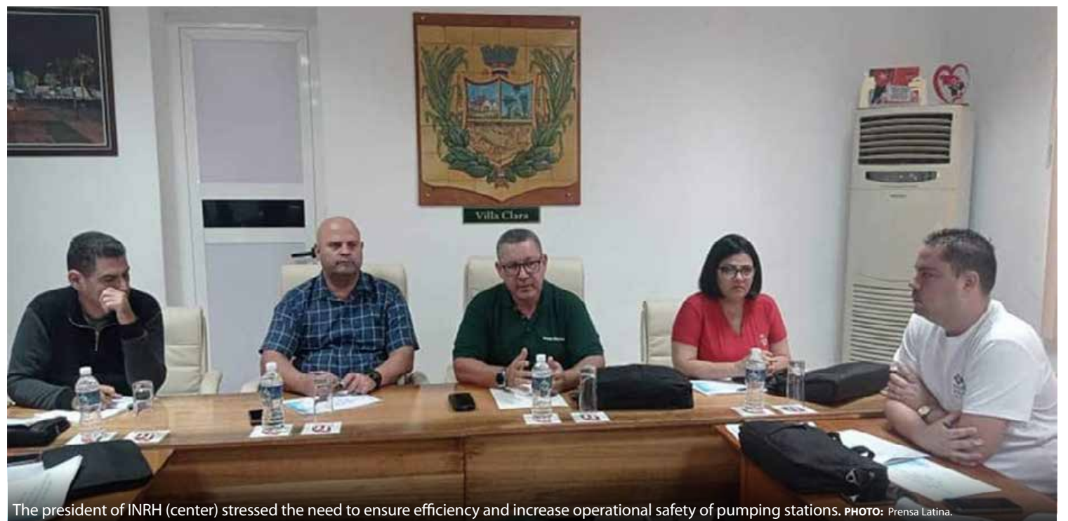
The president of INRH (center) stressed the need to ensure efficiency and increase operational safety of pumping stations.

Villa Clara province is one of the Cuban territories that faces main problems in the supply of water to the population, a reality that is gradually changing thanks to the execution of investments in the sector.