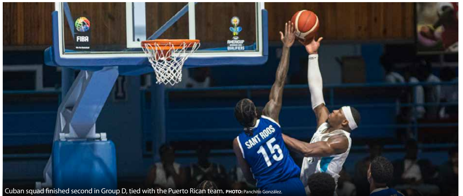
Cuban squad finished second in Group D, tied with the Puerto Rican team.