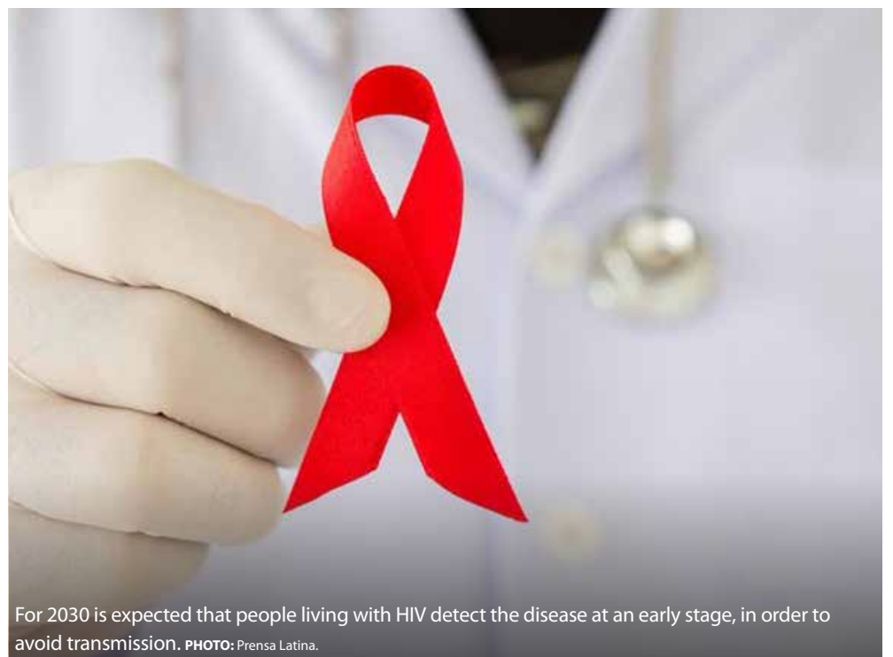
For 2030 is expected that people living with HIV detect the disease at an early stage, in order to avoid transmission.

acknowledge so, receive antiretroviral treatment and also detect the disease at an early stage, in order to avoid transmission.