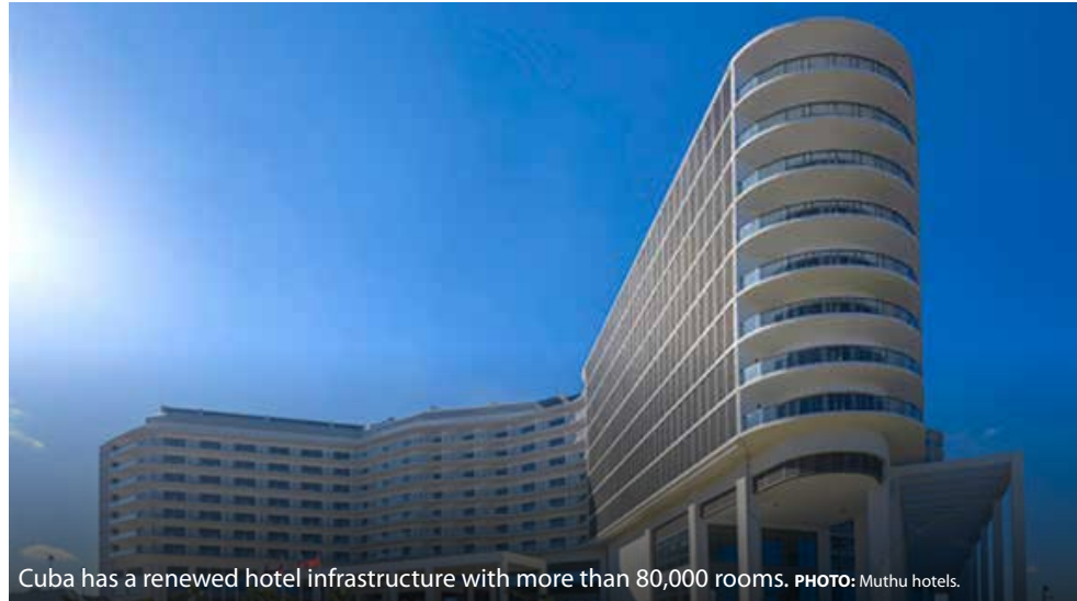
Cuba has a renewed hotel infrastructure with more than 80,000 rooms.

Up to the present, Cuba operates with 24 joint ventures set up in the national territory for the construction of new hotel and real estate developments associated to the tourism sector.