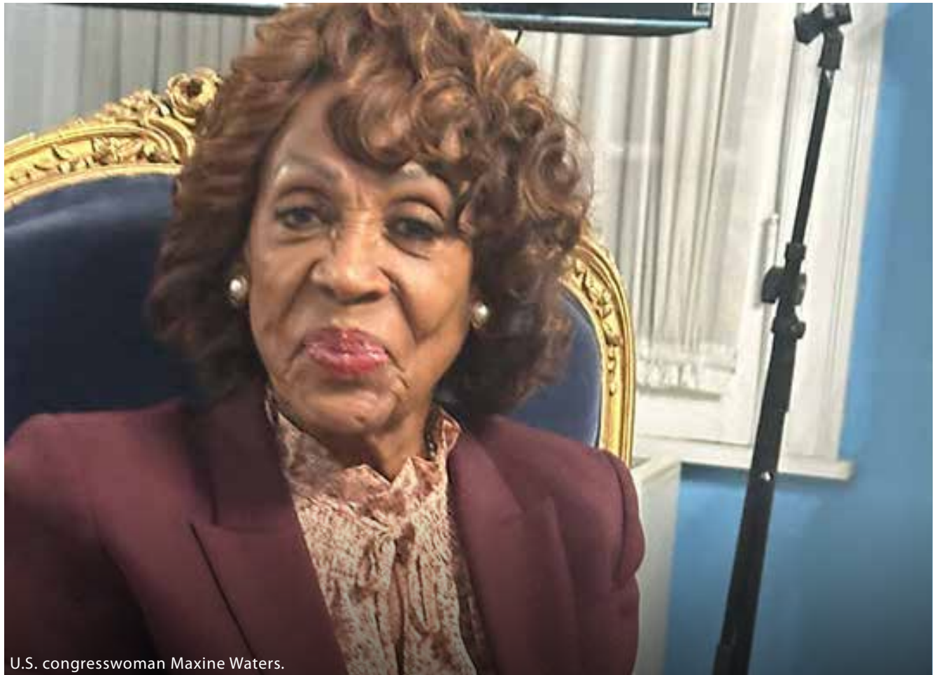
U.S. congresswoman Maxine Waters.

The diplomat also explained that the Trade Sanction Reform and Export Enhancement Act of 2000 allowed the Caribbean island, for the first time since the 1960s, to make purchases in the United States;" however, "the