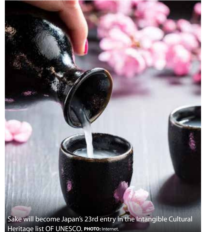
Sake will become Japan's 23rd entry in the Intangible Cultural Heritage list OF UNESCO.

In the 20th century, the technology used for the preparation of this beverage made significant progress and in 1904, the Japanese government set up the Research Institute for Sake Preparation and in 1907, the first governmental tasting test was conducted.