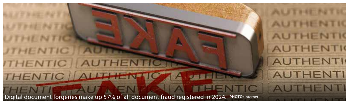
Digital document forgeries make up 57% of all document fraud registered in 2024.

Entrust Cybersecurity Institute estimates that the main targets of these attacks are the financial services sector, cryptocurrency platforms, lending and mortgage and traditional banks.