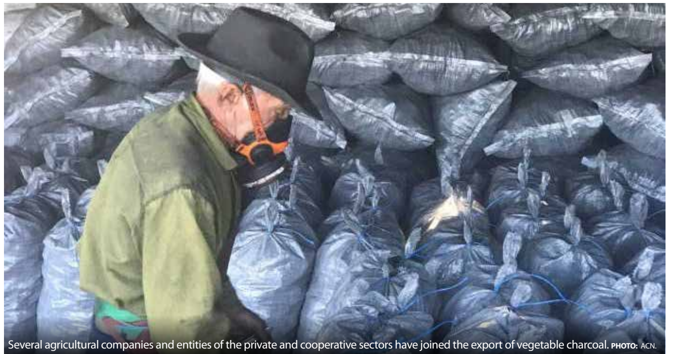
Several agricultural companies and entities of the private and cooperative sectors have joined the export of vegetable charcoal.

This new endeavor is developed without giving up our specific tasks, such as nature, adventure and rural tourism, while we are joining other economic activities such as cattle raising, agricultural production and the promotion of a new way of life in the Plan Turquino zone.