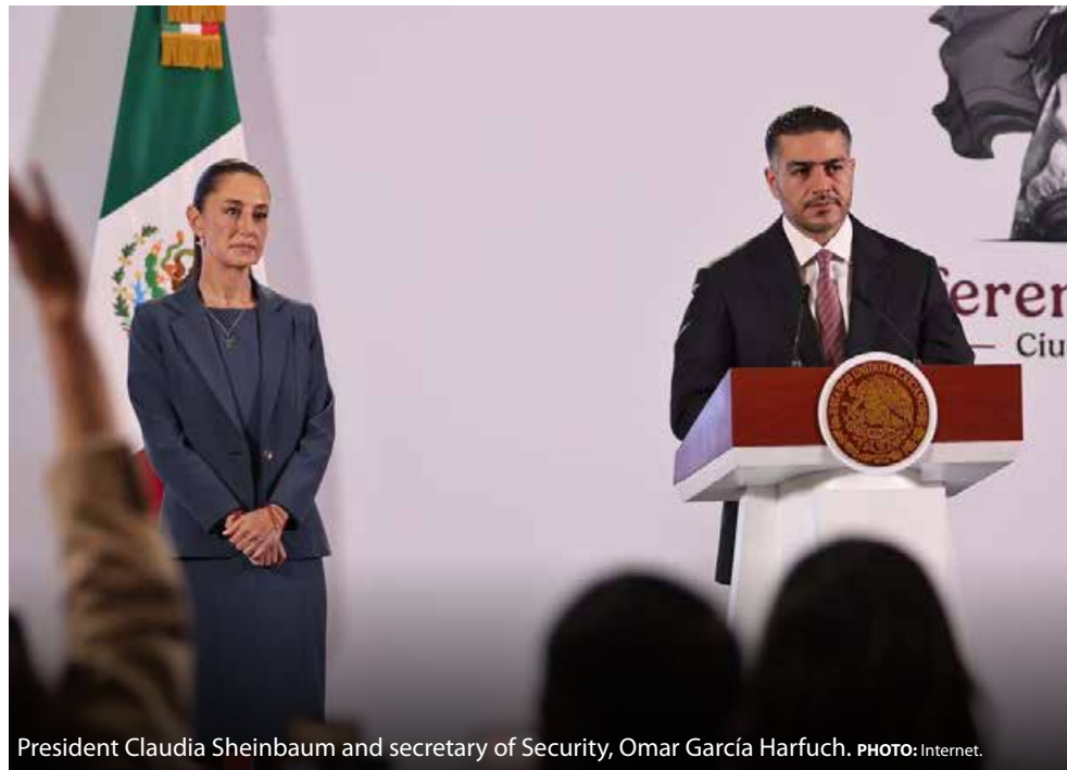
President Claudia Sheinbaum and secretary of Security, Omar García Harfuch.

In order to build a lasting peace in the country, authorities agreed on several objectives, including reduction of criminal incidence, mostly fraudulent homicides and high-impact crimes such as extortion.