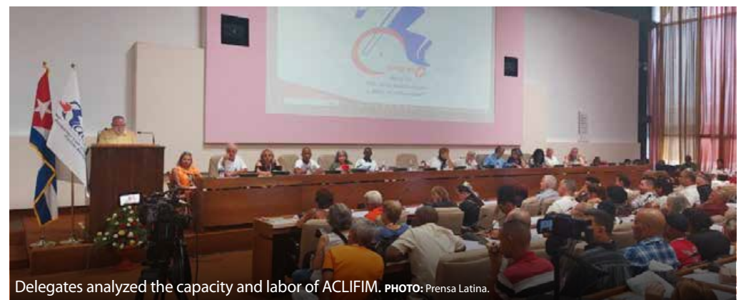
Delegates analyzed the capacity and labor of ACLIFIM.