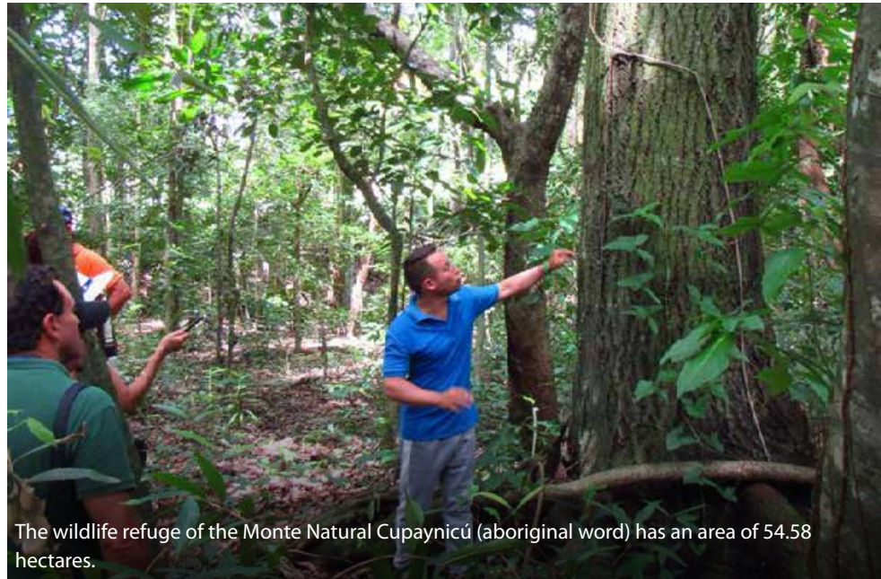
The wildlife refuge of the Monte Natural Cupaynicú (aboriginal word) has an area of 54.58 hectares.

TURNAT participants were able to appreciate the green scenario of this location and were eager to continue walking through the forest to catch as much as possible the institution specialists' accumulated knowledge on nature.