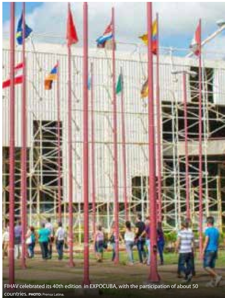
FIHAV celebrated its 40th edition in EXPOCUBA, with the participation of about 50 countries.

FIHAV 2024 was focused on the promotion of Cuba's export items (by state and private entities), with representation of its 13 export producing centers.