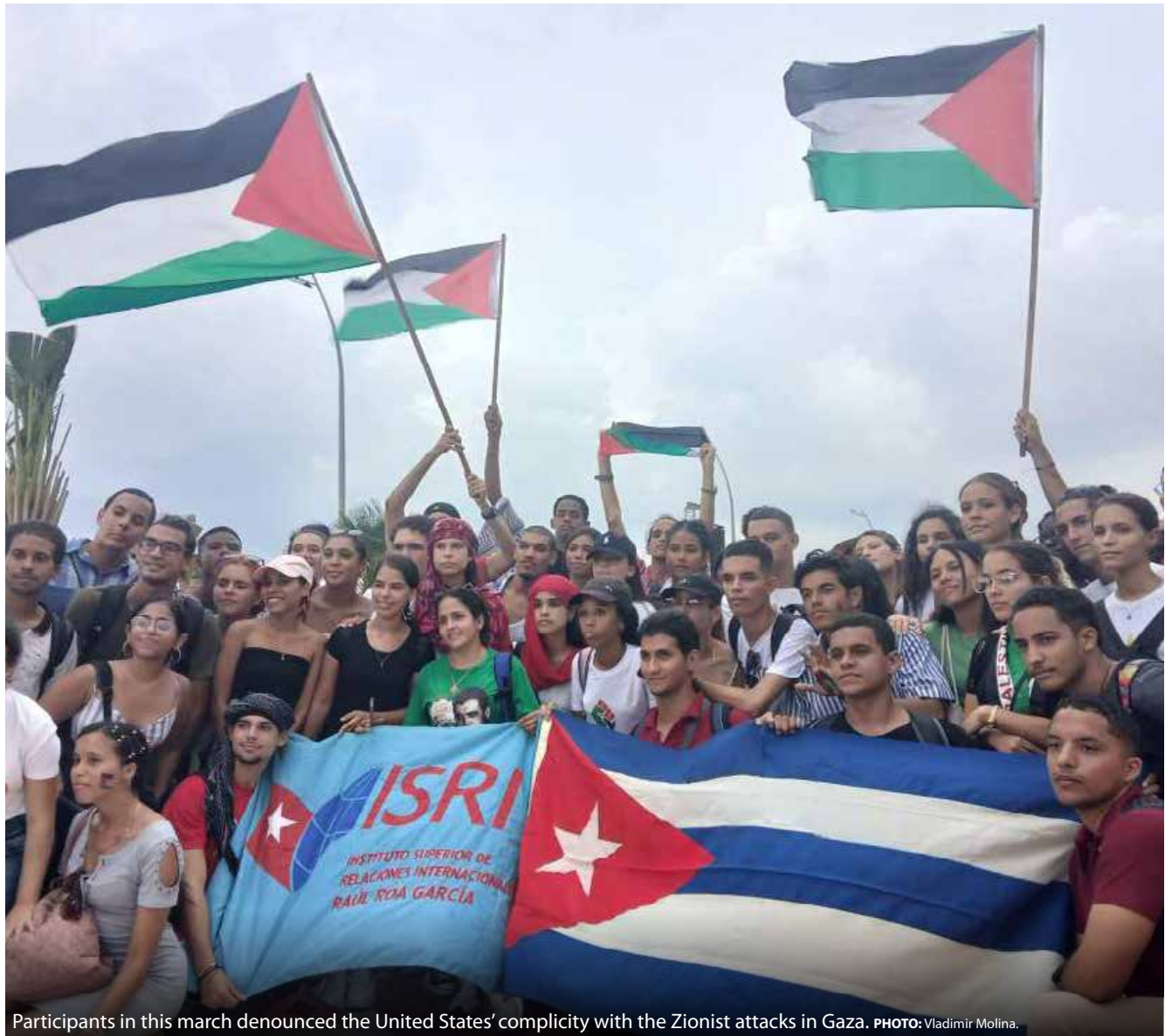
Participants in this march denounced the United States' complicity with the Zionist attacks in Gaza.

We will not close our eyes in the face of this massacre; we will not forget neither the heroism of those attacked nor the brutality of the aggressors, she said.