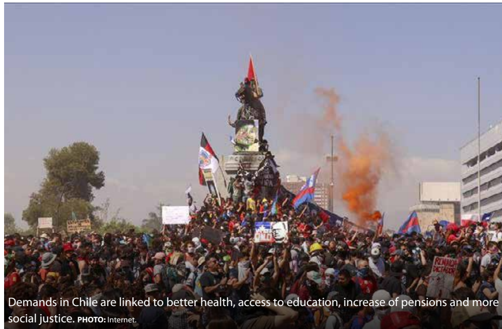
Demands in Chile are linked to better health, access to education, increase of pensions and more social justice.

On a question THR made about a recent survey by the Public Studies Center, according to which 50 percent of the population considers the consequences of these demonstrations as bad or very bad, the writer said that "it is clear that a sustained marketing campaign has been conducted to try that only violence remains for posterity and to hide the reasons of its origin."