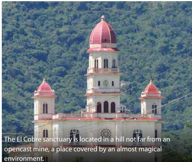
The El Cobre sanctuary is located in a hill not far from an opencast mine, a place covered by an almost magical environment.

The El Cobre sanctuary, located in a hill overlooking the town named the same and not far from an opencast mine, is a place covered by an almost magical environment, with several stories of famous visitors, where the offerings of personalities of different origin are shown.