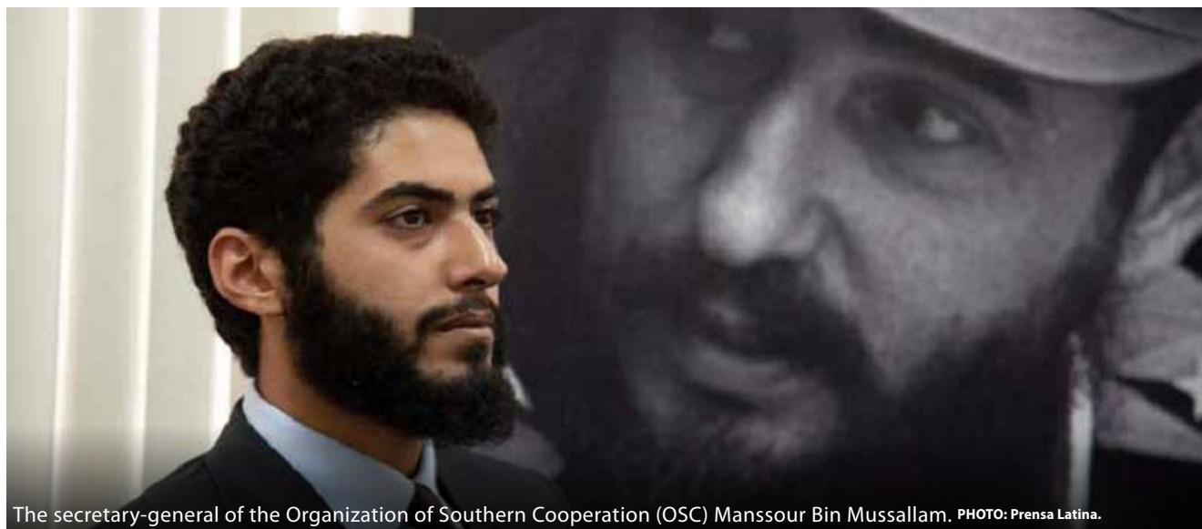
The secretary-general of the Organization of Southern Cooperation (OSC) Manssour Bin Mussallam.

The official highlighted that "we know very well that talking about a south-south cooperation, about regional integration, without the infrastructure that connects it, would mean talking about something pretty abstract."