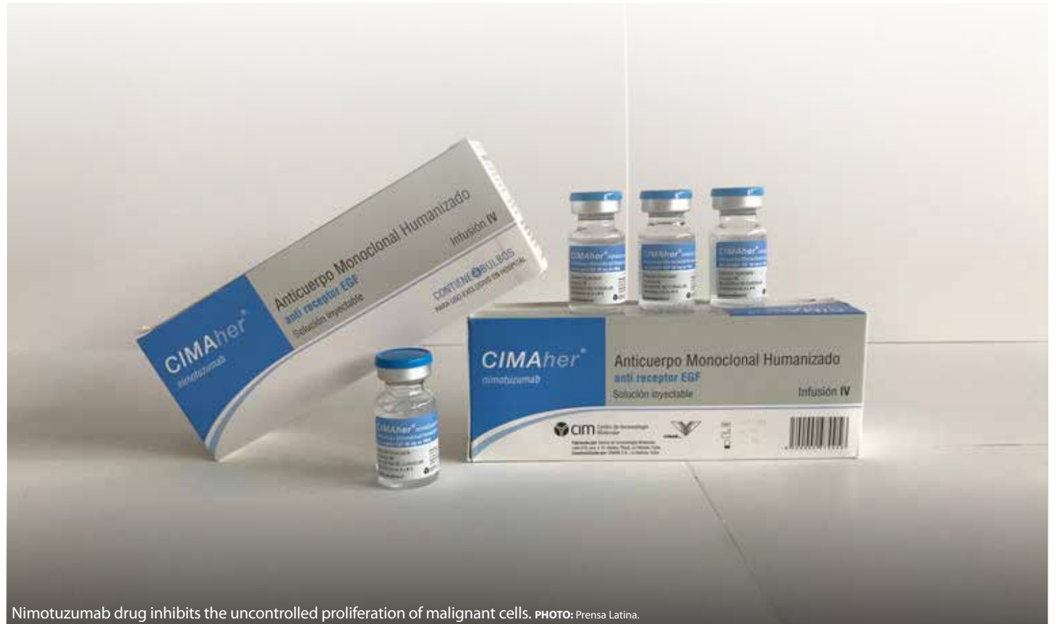
Nimotuzumab drug inhibits the uncontrolled proliferation of malignant cells.

One of its main advantages is that it differentiates from tumor and healthy cells; that is, it specifically acts on malignant cells. In most of the cancer locations, Nimotuzumab is used in combinations with irradiation and chemotherapy, the doctor added.