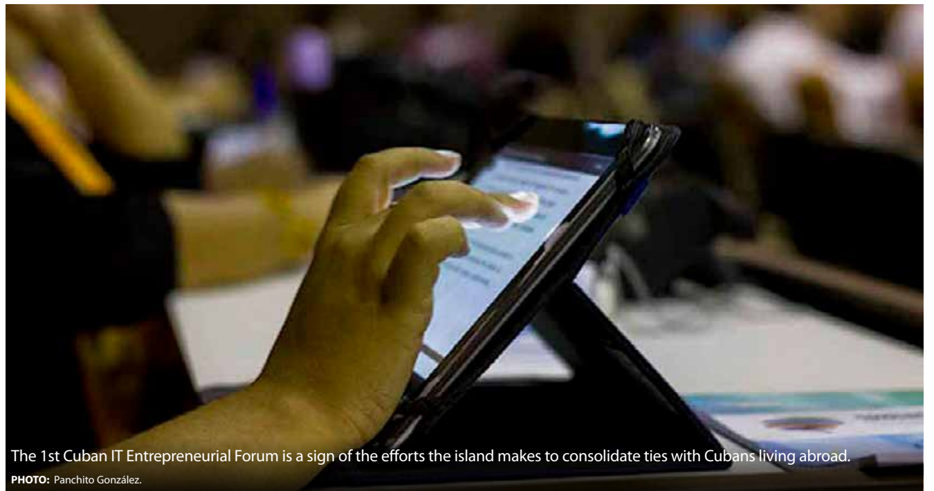
The 1st Cuban IT Entrepreneurial Forum is a sign of the efforts the island makes to consolidate ties with Cubans living abroad.

Other topics dealt with access to highly specialized human talent, with potential for remuneration based on results and an advanced infrastructure that includes over 1,200 jobs, offices, labs and project-tailored common areas.