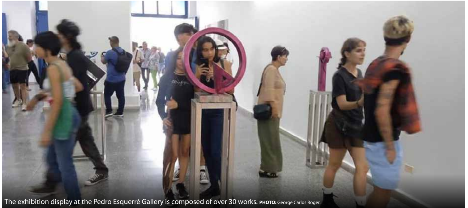
The exhibition display at the Pedro Esquerré Gallery is composed of over 30 works.