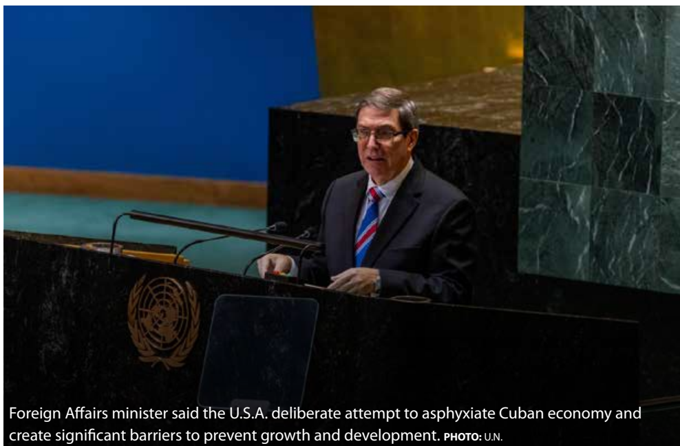
Foreign Affairs minister said the U.S.A. deliberate attempt to asphyxiate Cuban economy and create significant barriers to prevent growth and development.