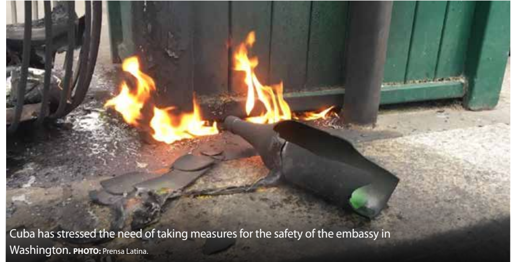
Cuba has stressed the need of taking measures for the safety of the embassy in Washington.

The impunity of those terrorist acts occur in a country that has unfairly included Cuba in its unilateral list of nations that allegedly sponsor terrorism, said Tablada, who demanded clarification and justice in the face of such acts.