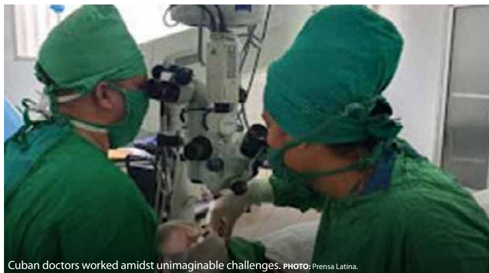
Cuban doctors worked amidst unimaginable challenges.

Today, we have 68 members, but our philosophy is doing more with what we have; thus, the fulfillment of the plans regarding consultations and operations. Notwithstanding, we went further ahead, opening family doctors' offices, rehabilitation rooms and training the human health resources the people needs. The population is familiar with your work and express their gratitude, stressed the Cuban ambassador to Haiti.