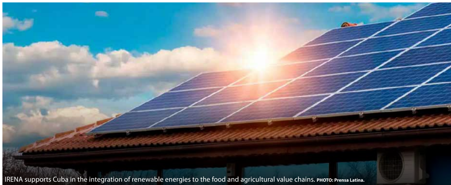
IRENA supports Cuba in the integration of renewable energies to the food and agricultural value chains.

To IRENA, the role of women within the energy transition is highly important because their participation in the development of RE grew in time and the idea is that the genre issue be precise, he stressed.