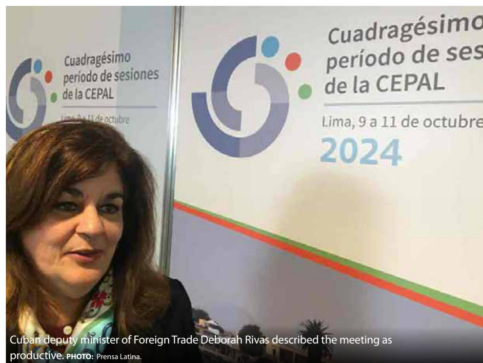
Cuban deputy minister of Foreign Trade Deborah Rivas described the meeting as productive.

At the ECLAC meeting, Cuba ratified the precepts of its politics and denounced the economic, commercial and financial blockade imposed by the United States on the island as the main obstacle for the country's development, Rivas added.