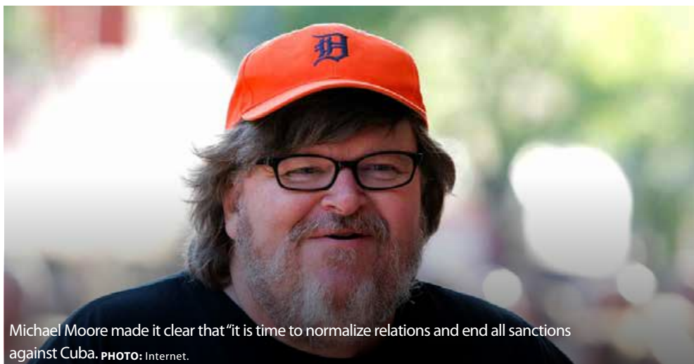
Michael Moore made it clear that "it is time to normalize relations and end all sanctions against Cuba.

"How many violations of red lines will it take until you've had enough? (...) Mass carnage, mass murder, mass destruction all being committed in America's name," he affirmed while urging "to end this madness." In the Bucket List Joe, published in his official website, Moore reiterated to the Democrat president: "You have an extraordinary opportunity to make a whole bunch of things happen. Great things. Important things. With a simple stroke or two of your presidential pen."