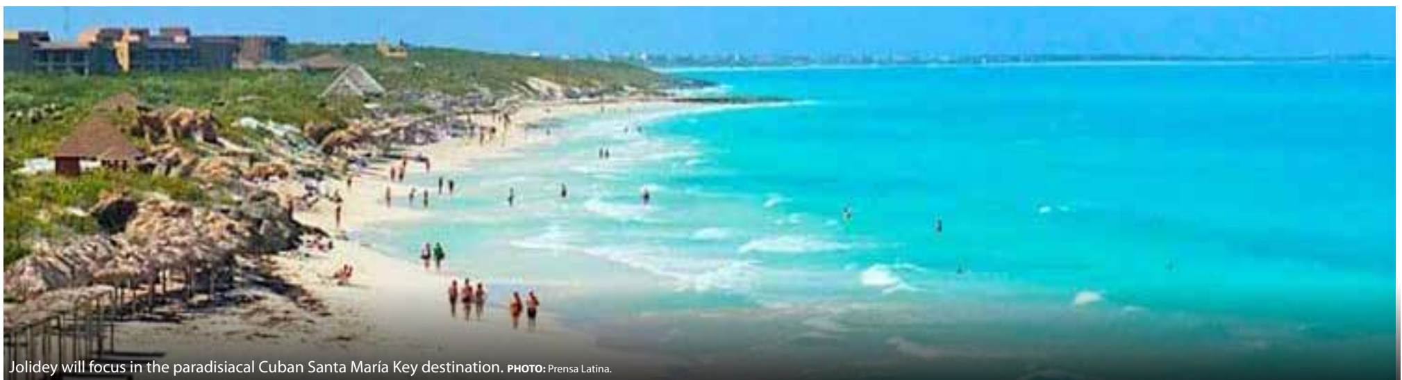
Jolidey will focus in the paradisiacal Cuban Santa María Key destination.

Jolidey also foresees to promote the Trinidad destination, a city declared a UNESCO World Heritage Site. This Cuban colonial center, with an extraordinary historical site, includes in its surroundings beautiful beaches such as Ancón and also offers access to hiking in the Topes de Collantes heights. Direct flights to Santa María Key will increase the number of Spanish tourists, who find in Cuba one of their preferred tourist destinations.