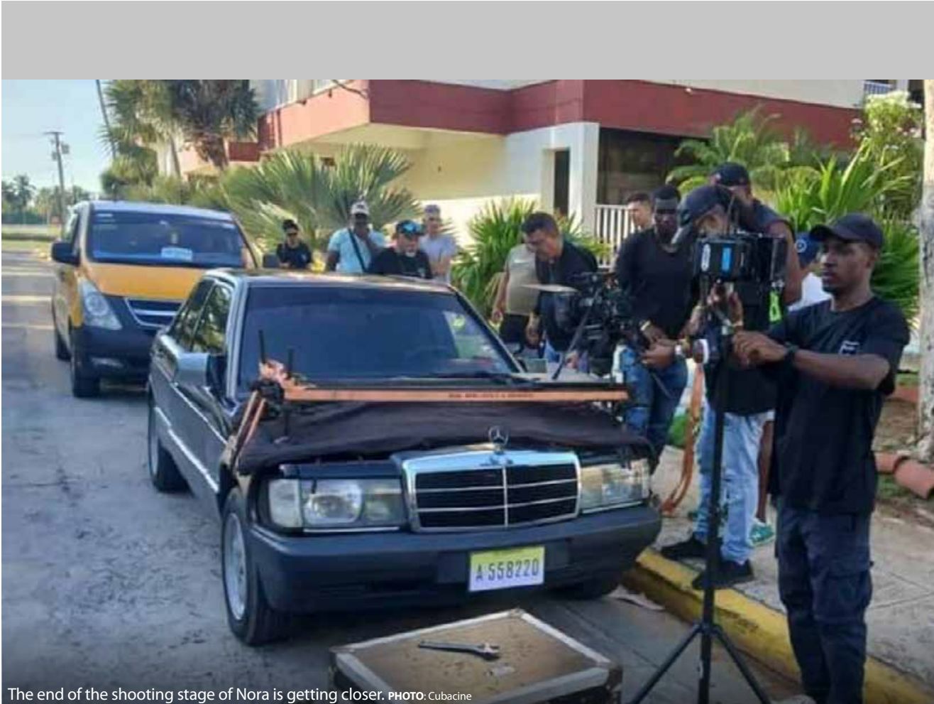
The end of the shooting stage of Nora is getting closer.