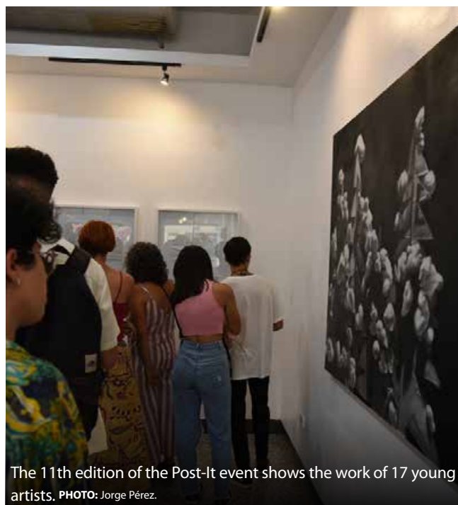
The 11th edition of the Post-It event shows the work of 17 young artists.

Our gallery has a research profile and as venue of this event every year, we are very selective when making an assessment, she noted.