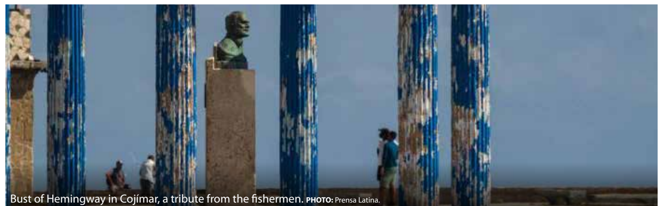
Bust of Hemingway in Cojimar, a tribute from the fishermen.

He came accompanied by his second wife, Pauline Pfeiffer, in a trip from France to Key West, with stopover in Havana.