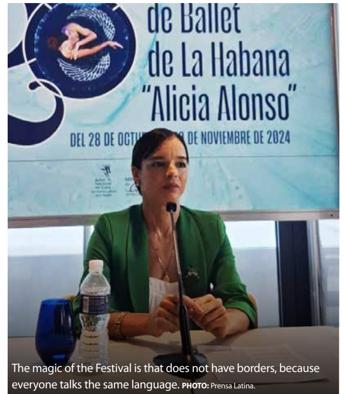
The magic of the Festival is that does not have borders, because everyone talks the same language.