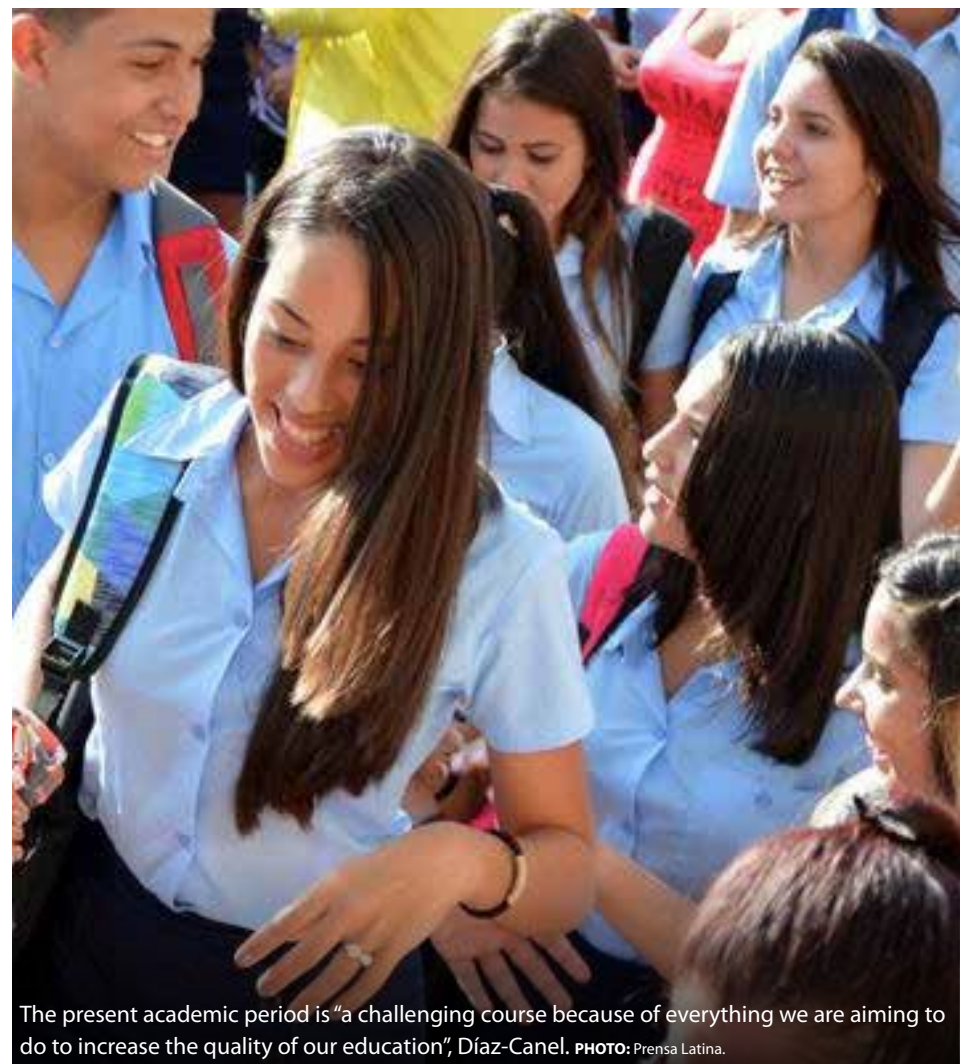
The present academic period is "a challenging course because of everything we are aiming to do to increase the quality of our education", Díaz-Canel.

In addition to the over 1,600,000 students of the general education who went to classrooms last September 2, the universities welcomed over 59,000 new students last September 16.