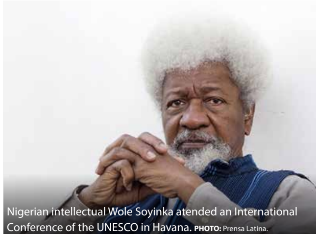
Nigerian intellectual Wole Soyinka attended an International Conference of the UNESCO in Havana.

After a period of liberation movements, both in northern Europe and Africa, we have moved back several steps, affirmed the writer, the first African to receive the Nobel Prize, in 1986.