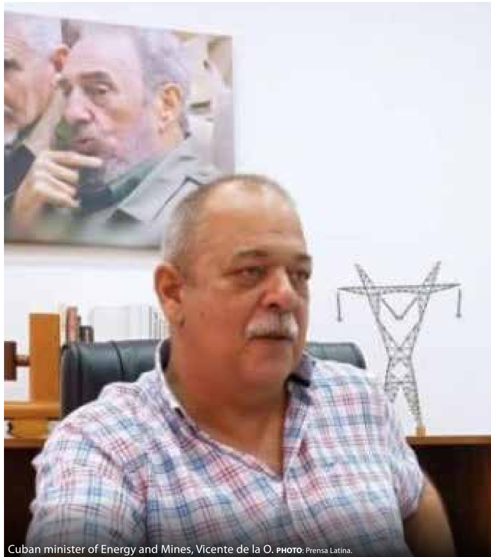
Cuban minister of Energy and Mines, Vicente de la O.

HAVANA.- Cuban minister of Energy and Mines, Vicente de la O, affirmed that the strategy to solve the difficulties the electricity system faces includes, among others, maintenances, efficient use and energy efficiency, in addition to renewable energies. The execution of maintenances will be done with the purpose to avoid power plants' total deterioration; for this reason, we will include the concept of taking units out of service for a year to conduct such works, De la O said recently at the Mesa Redonda television program.