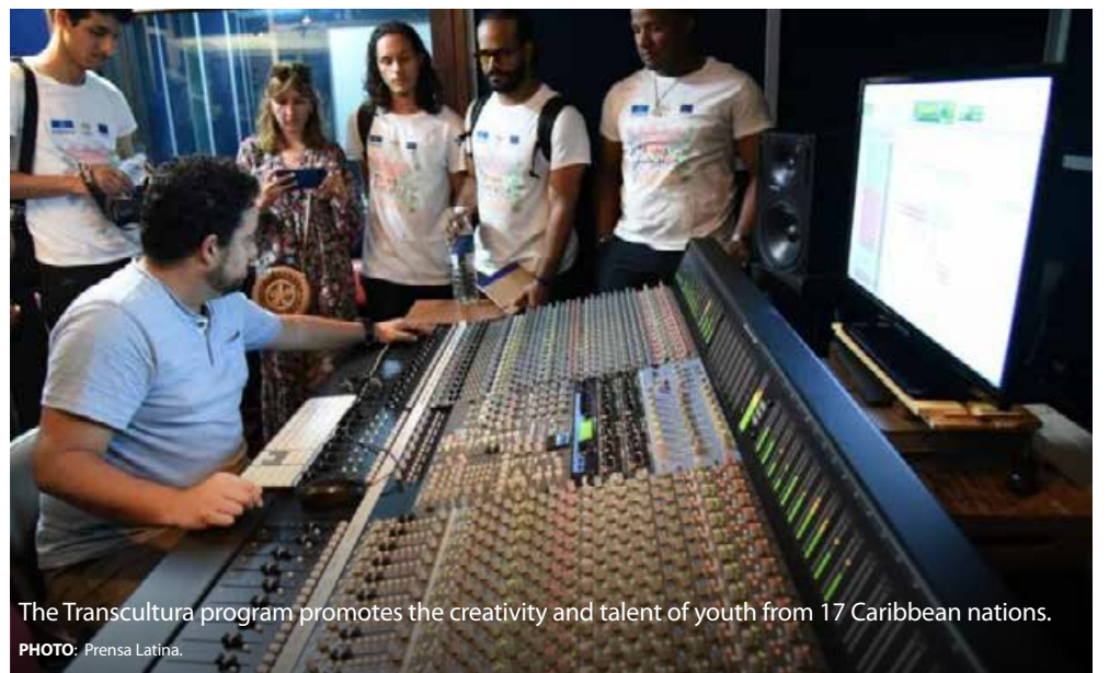
The Transcultura program promotes the creativity and talent of youth from 17 Caribbean nations.

Transcultura: Integrating Cuba, the Caribbean and the European Union through Culture and Creativity, hopes to help youth from the ages of 18 and 35 to become professionals and reach a solid level in sectors such as music, cinema, design, fashion, serigraphy, among others.