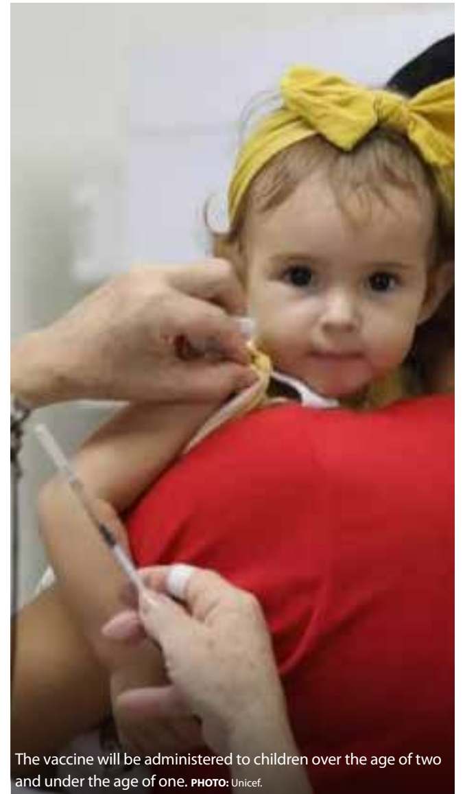
The vaccine will be administered to children over the age of two and under the age of one.

The acquisition of Pneumosil-10 Valent was possible thanks to the support of the Global Vaccine Alliance and the Pan-American Health Organization.