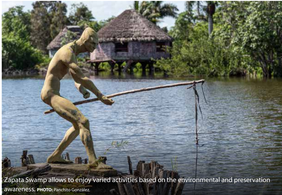
Zapata Swamp allows to enjoy varied activities based on the environmental and preservation awareness.

Opened on July 18, 1963 on the idea of leader of the Cuban Revolution Fidel Castro, the tourist complex combines the history of the indigenous people with the natural tributes of the place.