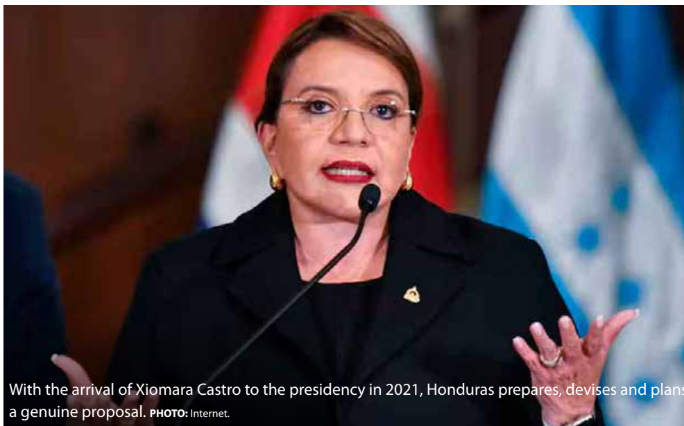
With the arrival of Xiomara Castro to the presidency in 2021, Honduras prepares, devises and plans a genuine proposal.

A significant progress in this area is the implementation of the early-harvest agreement, which allows the export of products such as the Honduran shrimp to China duty-free.