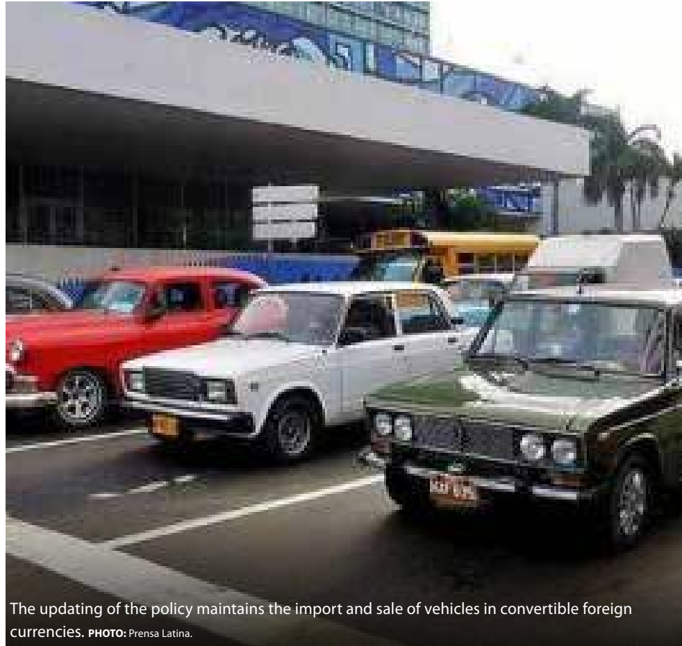
The updating of the policy maintains the import and sale of vehicles in convertible foreign currencies.

In these cases, the duty for electric motor vehicles is 100 dollars; for hybrids, 200 dollars and for combustion vehicles, 300 dollars. Special taxes in foreign currencies is eliminated to those who decide to buy the car in the country, Rodríguez stressed. At the same time, authorization is granted for the direct import of mopeds and motorcycles with internal combustion engines or hybrids with small engines, with or without sidecars, either through the passenger or shipment way, as well as the direct purchase of electric