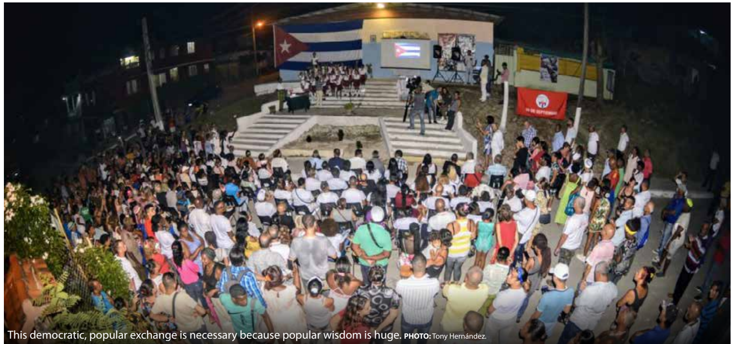
This democratic, popular exchange is necessary because popular wisdom is huge.

Such policy prevents access to fuel, resources, finances and hinders socio-economic development, which come on top of the administrative management problems within the nation.