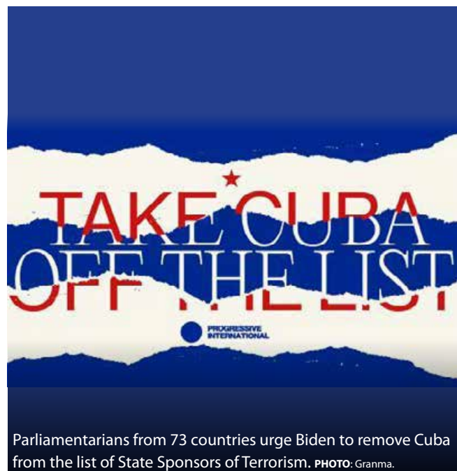
Parliamentarians from 73 countries urge Biden to remove Cuba from the list of State Sponsors of Terrorism.

WASHINGTON.- In the name of dignity and decency, 600 parliamentarians from 73 countries signed an open letter of the Progressive International (PI) addressed to U.S. president Joe Biden demanding the removal of Cuba from the list of State Sponsors of Terrorism.