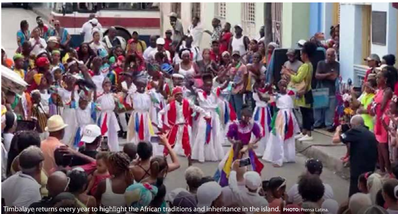
Timbalaye returns every year to highlight the African traditions and inheritance in the island.