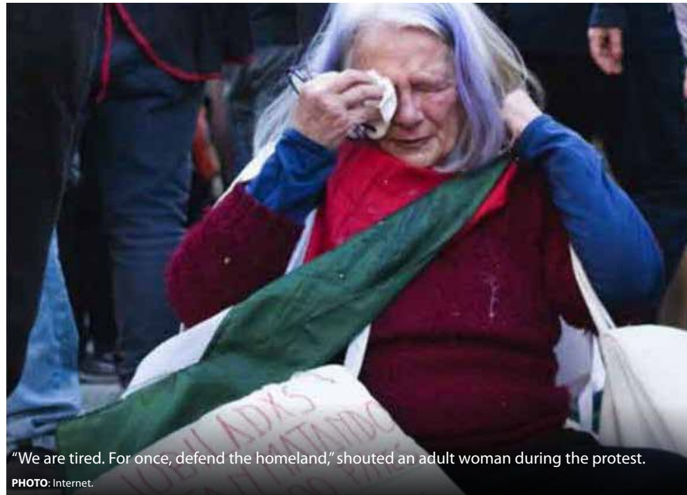
"We are tired. For once, defend the homeland," shouted an adult woman during the protest.

In spite of receiving 153 votes in favor, the opposition headed by Unión por la Patria did not receive the 172 votes needed to