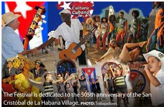
The Festival is dedicated to the 505th anniversary of the San Cristóbal de La Habana Village.

The event, to be held in parallel to the XV Havana's Visual Arts Biennial Festival, will echo the work of personalities from the field of culture with a solid career abroad and youngsters representing our identity.