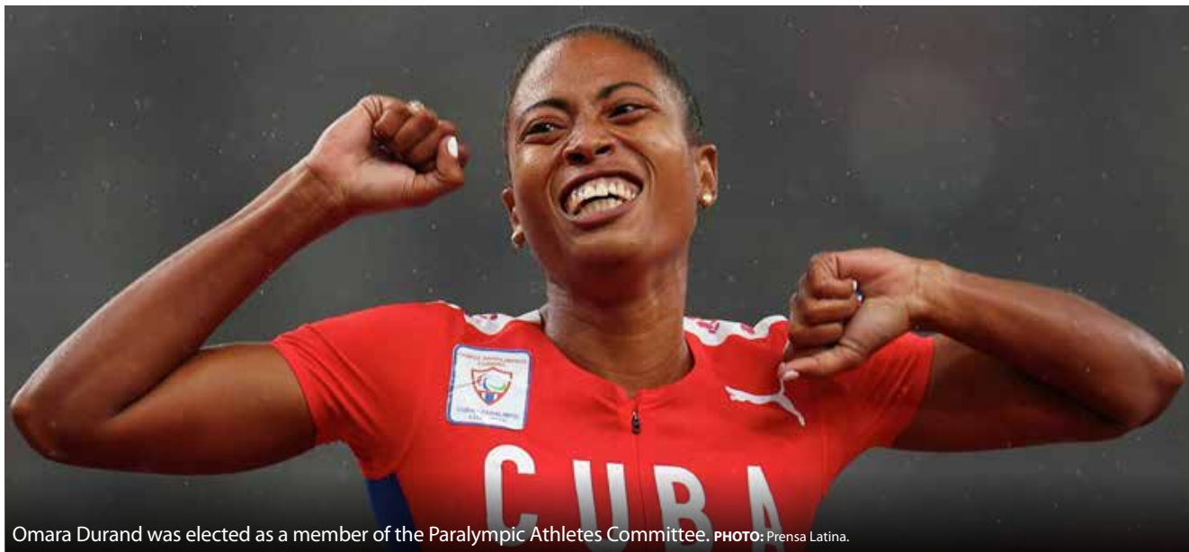
Omara Durand was elected as a member of the Paralympic Athletes Committee.

The executive also praised the Cuban athlete's attitude, their dedication and hard work and the wish to better themselves in each of the events in which they participated.