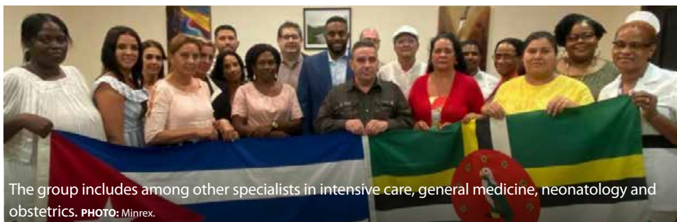
The group includes among other specialists in intensive care, general medicine, neonatology and obstetrics.