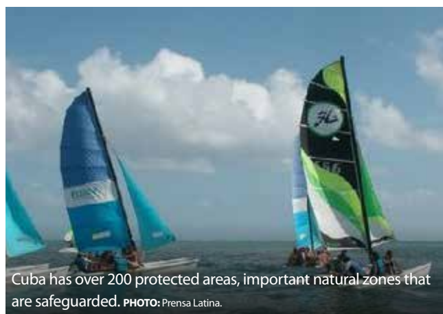
Cuba has over 200 protected areas, important natural zones that are safeguarded.

Playa Santa Lucía's huge wealth also include a better use of natural resources; thus, the Blue Tourism program includes proposals linked to health tourism and the use of medicinal mud.