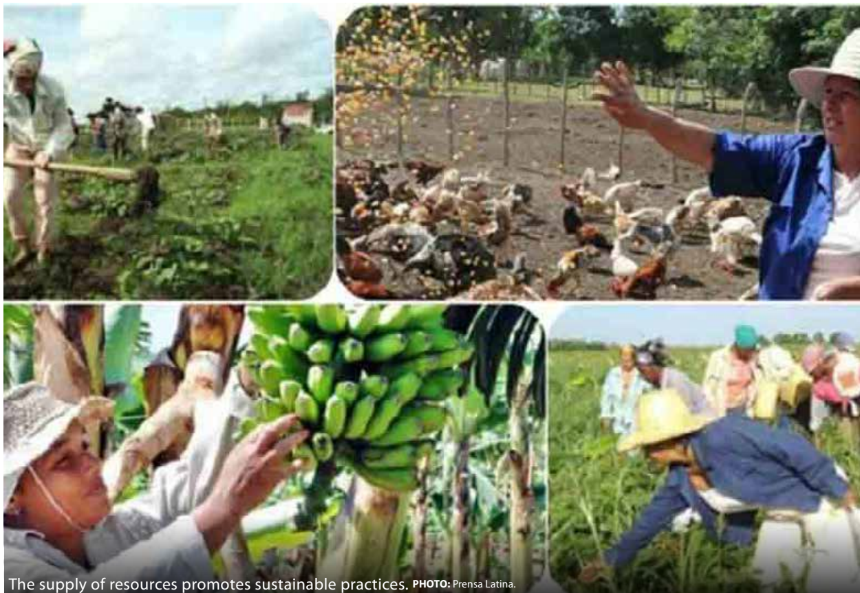
The supply of resources promotes sustainable practices.

HAVANA.- Farmers from seven Cuban municipalities highly vulnerable to climate change continue receiving agricultural technologies and tools, FAO indicated in this capital.