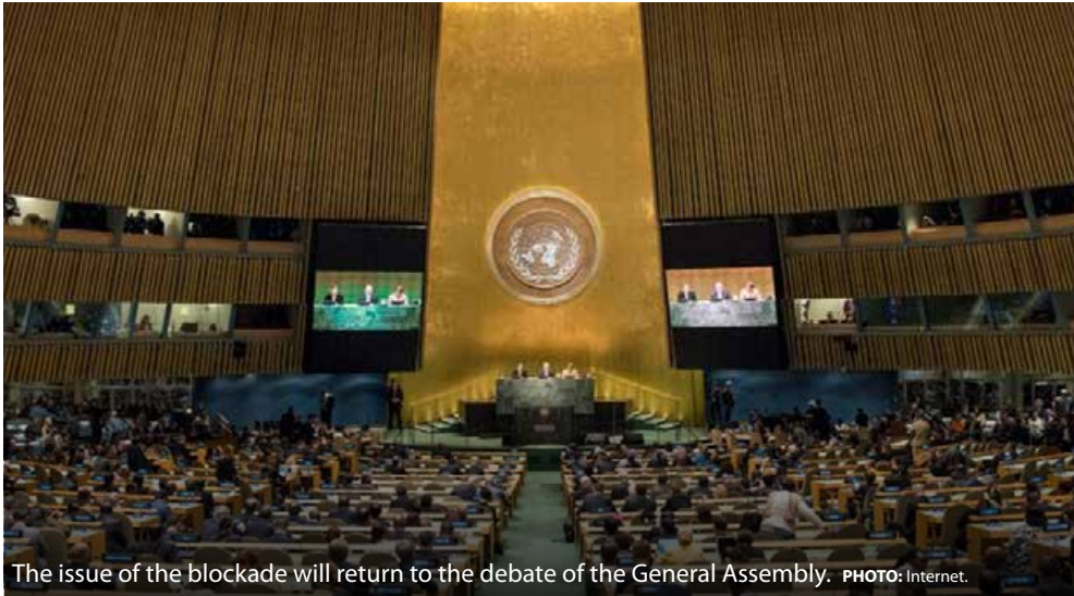
The issue of the blockade will return to the debate of the General Assembly.