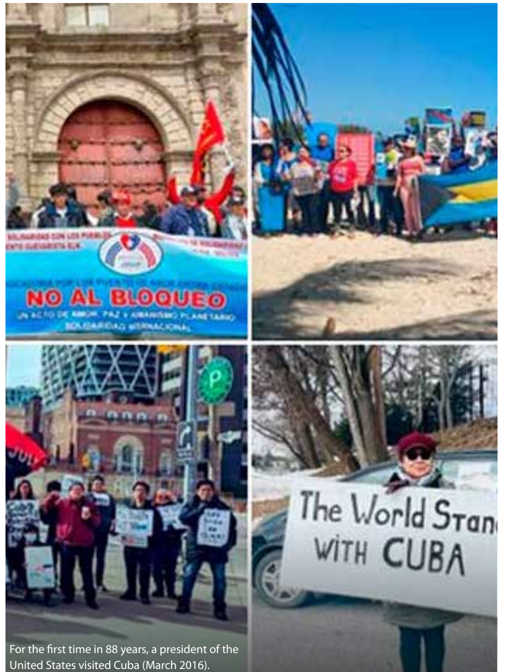
For the first time in 88 years, a president of the United States visited Cuba (March 2016).