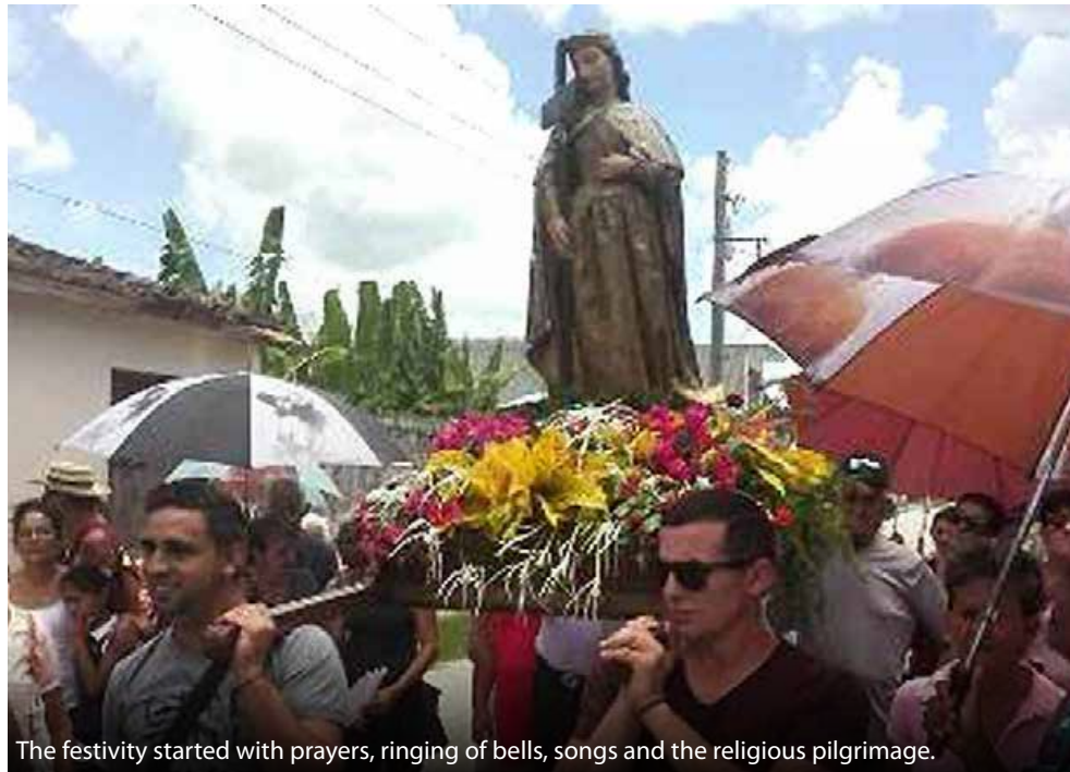
The festivity started with prayers, ringing of bells, songs and the religious pilgrimage.

As a result of people's request in 1990 and after the creation of the Casilda