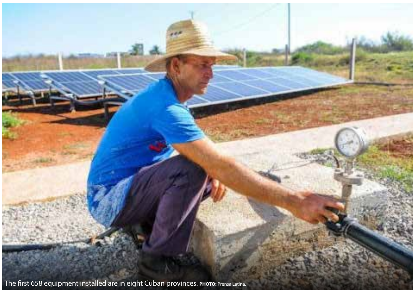
The first 658 equipment installed are in eight Cuban provinces.

At present, Cuba has about 3,600 water pumping equipment of different power and the intention is to foster, later on, the assembly of devices of up to 30 kW. The change in the energy matrix potentially saves 17 gigawatts per year, which means 10,000 tons of diesel.