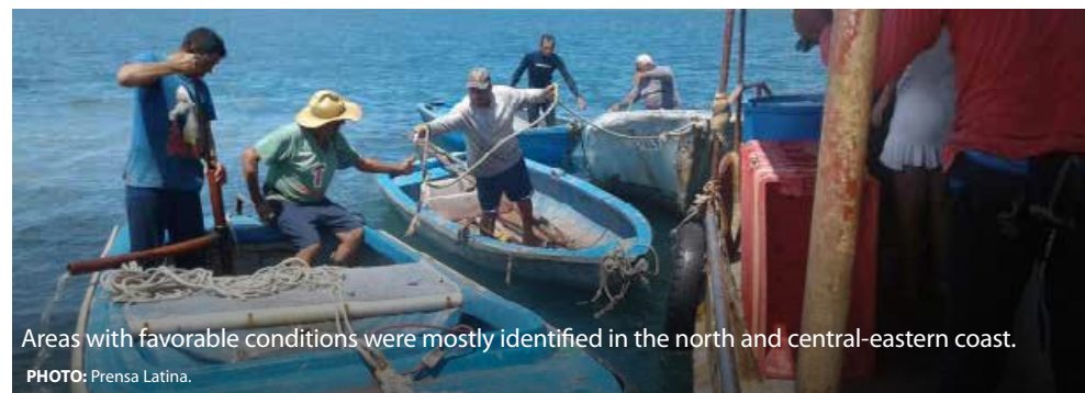
Areas with favorable conditions were mostly identified in the north and central-eastern coast.

Under the principle of blue transformation, FAO fosters the adoption of measures that strengthen aquatic food systems' efficiency, inclusiveness, resilience and sustainability to face food insecurity.