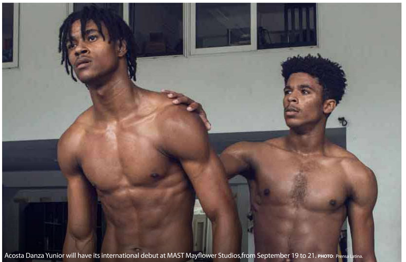
Acosta Danza Yunior will have its international debut at MAST Mayflower Studios, from September 19 to 21.

Founded in 2023, Acosta Danza Yunior's objective is to develop the next generation of dancers that serve as reserve for Carlos Acosta's company.