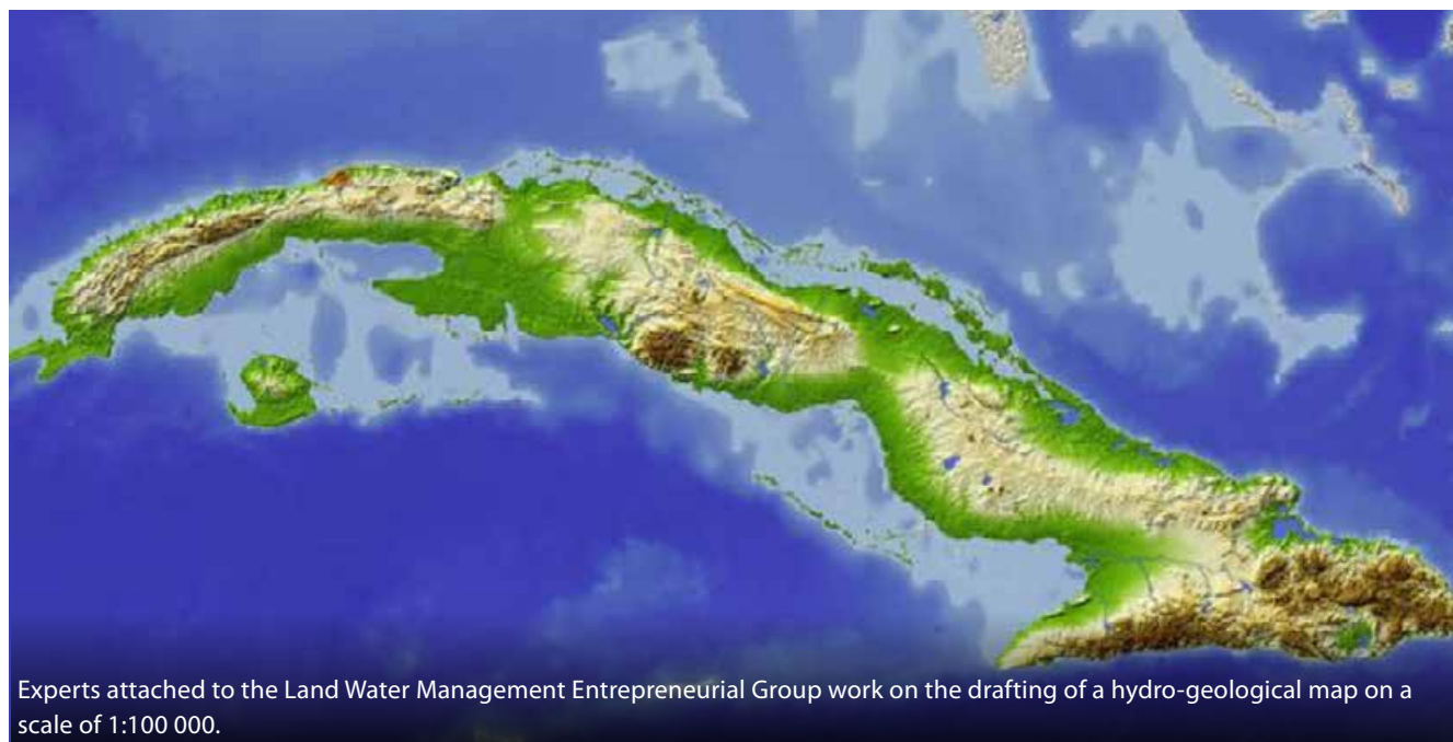
Experts attached to the Land Water Management Entrepreneurial Group work on the drafting of a hydro-geological map on a scale of 1:100 000.

According to the doctor of Sciences, this is a highly valuable work for the search and evaluation of mineral deposits, as well as for territorial planning, risk of disasters' reduction and major engineering works' design, to mention just a few of their main uses.