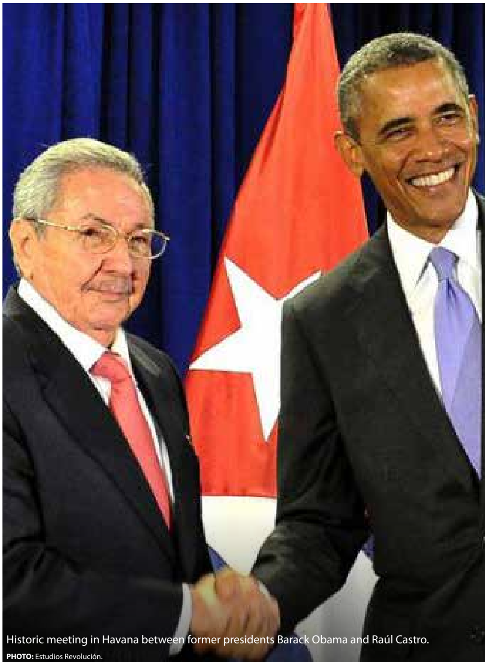
Historic meeting in Havana between former presidents Barack Obama and Raúl Castro.

A few days before leaving the post, on January 2021, Trump again included Cuba in the list of State Sponsors of Terrorism, a decision the current Democratic president Joe Biden has remained loyal to, as when his term is almost over, he has not met his campaign promise of changing his predecessor's policy on Cuba.