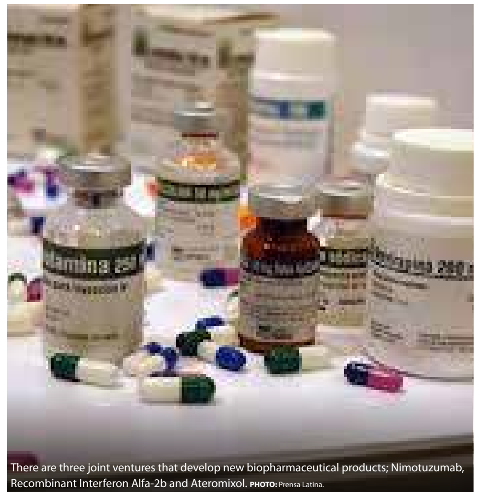
There are three joint ventures that develop new biopharmaceutical products; Nimotuzumab, Recombinant Interferon Alfa-2b and Ateromixol.

At present, antibodies are an important part of the pharmaceutical candidates developed at the giant Asian nation and many are available at the international market.