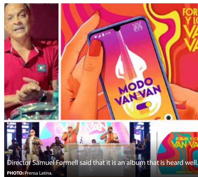
Director Samuel Formell said that it is an album that is heard well.

Modo Van Van , produced for the national market by the Bis Music Record Company and for the international market by Amboss Media, was made in memory of guitarist, bassist and composer Juan Carlos Formell (1964-2023).