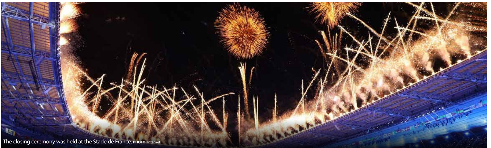
The closing ceremony was held at the Stade de France.