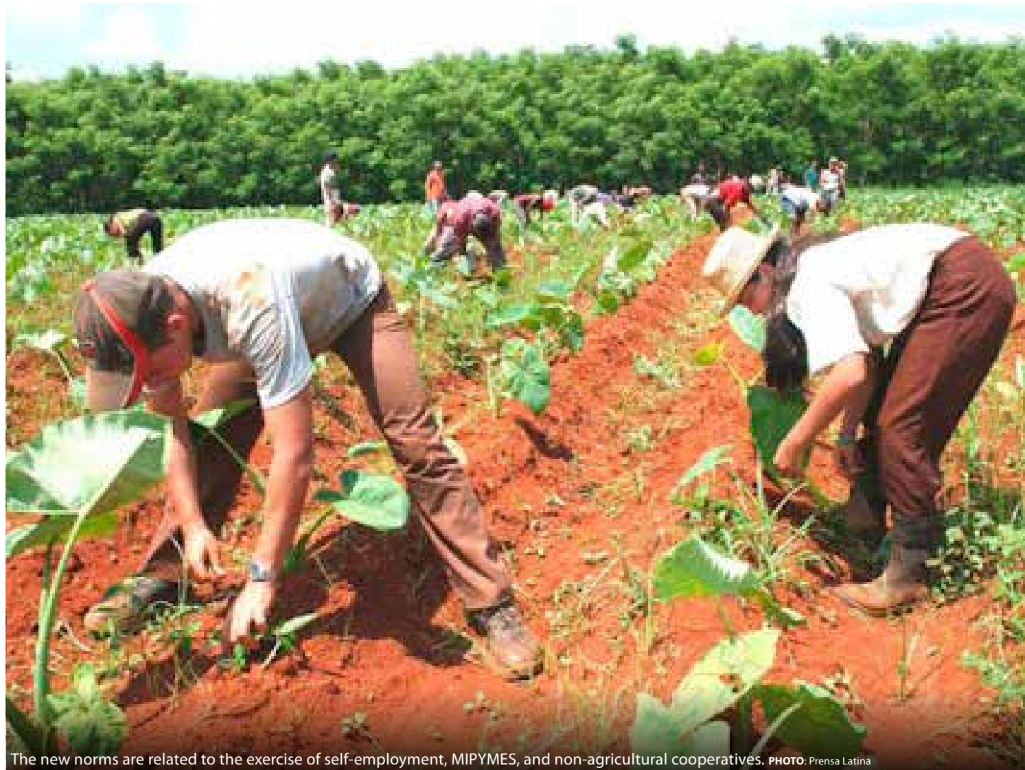
The new norms are related to the exercise of self-employment, MIPYMES, and non-agricultural cooperatives.

She added that all bodies of the State Central Administration, territorial governments, Municipal Administration Councils and a representation of economic actors, were consulted.