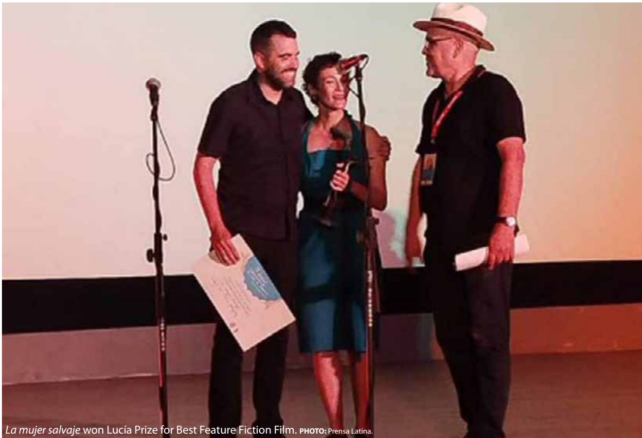
La mujer salvaje won Lucía Prize for Best Feature Fiction Film.