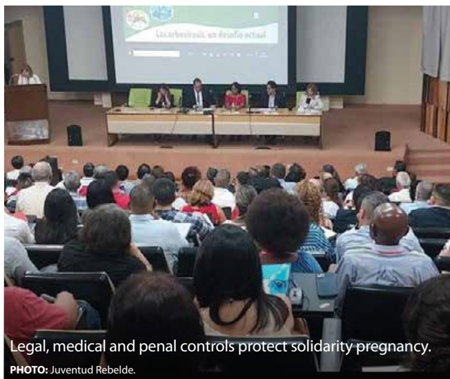
Legal, medical and penal controls protect solidarity pregnancy.

HAVANA.- Cuban health scientists and professionals' reputation was acknowledged by director of the World Health Organization Department of Epidemic and Pandemic Preparedness and Prevention, María D Van Kerkhove.