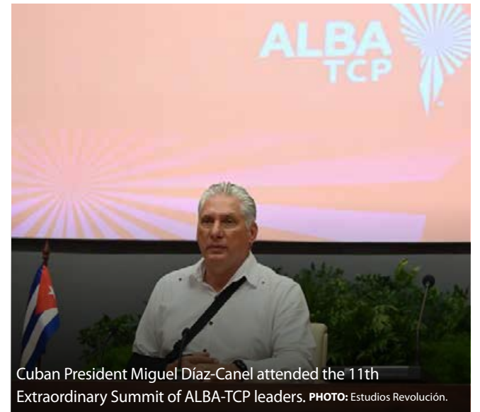
Cuban President Miguel Díaz-Canel attended the 11th Extraordinary Summit of ALBA-TCP leaders.

According to Venezuelan minister of Foreign Affairs Yvan Gil, the purpose of the event was to establish a position in solidarity with the Venezuelan government and its people, against the interference of the United States and European Union nations.