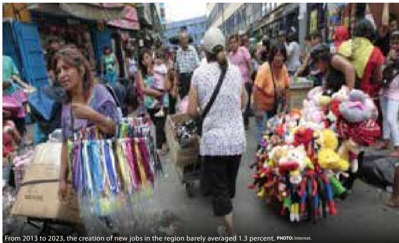
From 2013 to 2023, the creation of new jobs in the region barely averaged 1.3 percent.

This shows the importance of a significant increase of public and private investment in structural reforms, to make progress in current and future workers' qualification, stated ECLAC Executive Secretary.