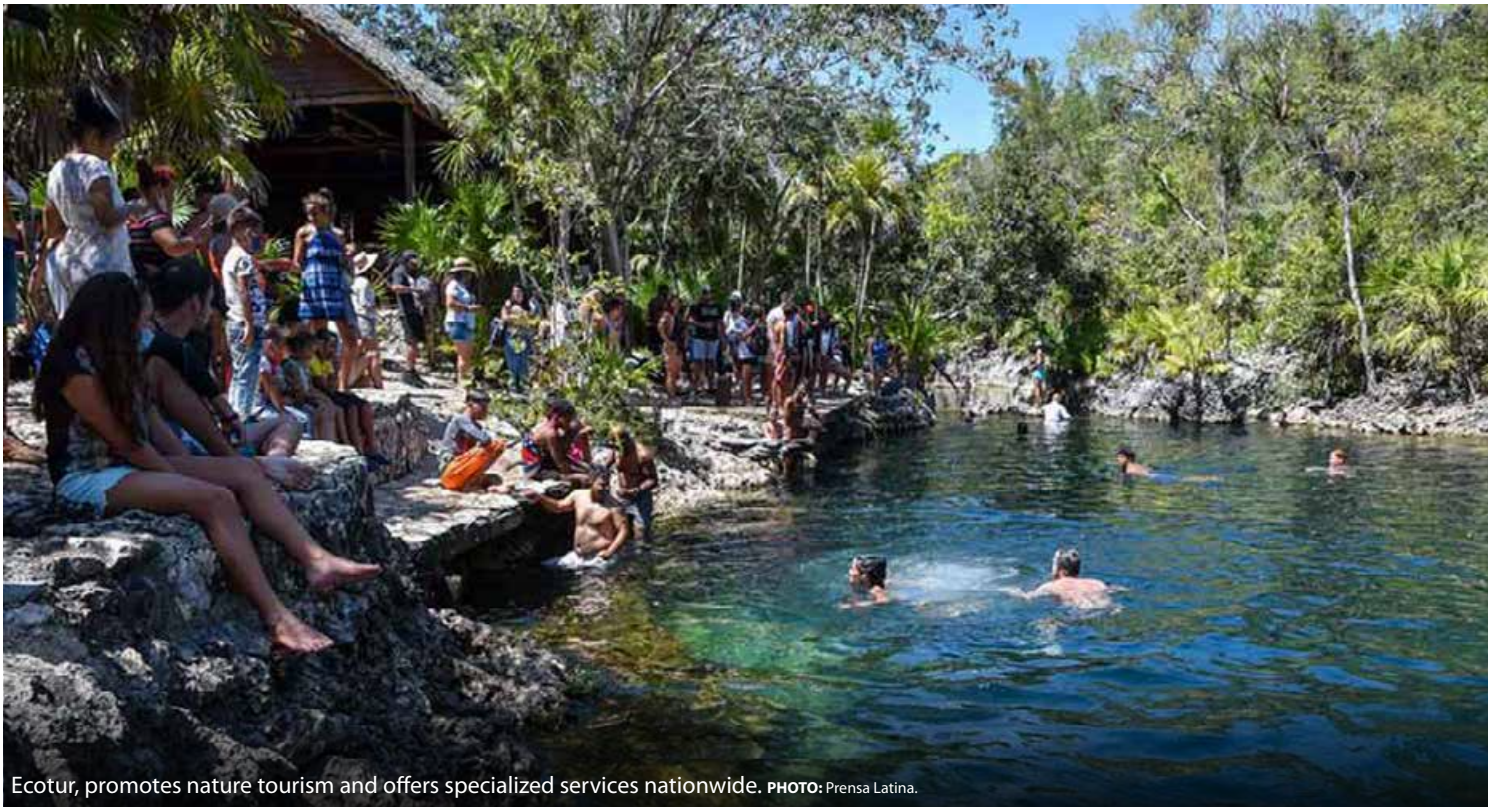
Ecotur, promotes nature tourism and offers specialized services nationwide.

The event is an opportunity to show, exchange and share opinions and experiences on nature tourism and know about the products and destinations Cuba will offer for the new season.