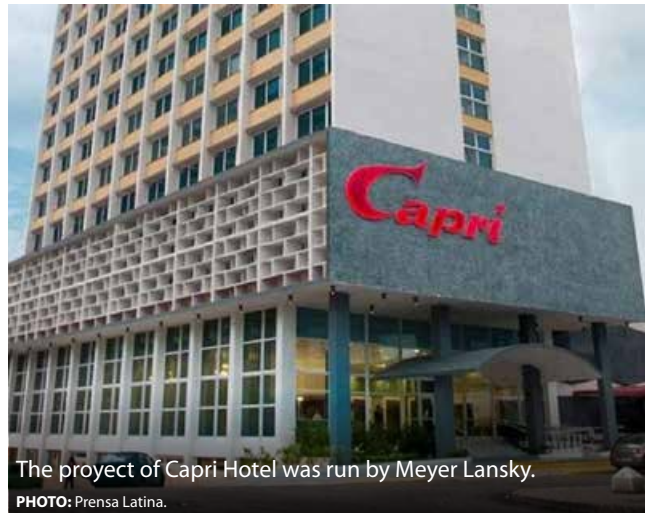
The project of Capri Hotel was run by Meyer Lansky.

The Sevilla Biltmore Hotel, next to the Prado promenade, was then known as the Gran Hotel Sevilla, which was opened on March 22, 1908 and was the first luxury establishment Havana had. Italian tenor Enrico Caruso or U.S. diva Josephine Baker were some of the celebrities that stayed there.