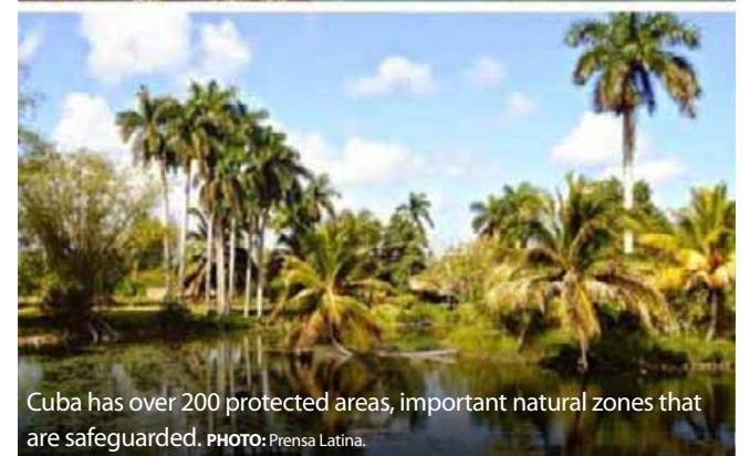
Cuba has over 200 protected areas, important natural zones that are safeguarded.

The Havana Reporter YOUR SOURCE OF NEWS & MORE