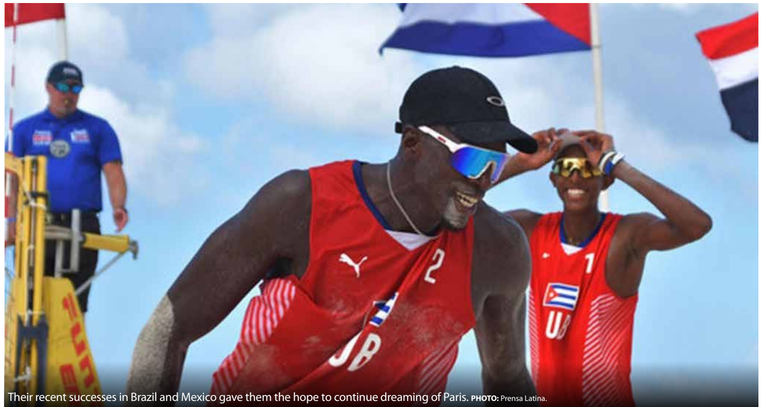
Their recent successes in Brazil and Mexico gave them the hope to continue dreaming of Paris.