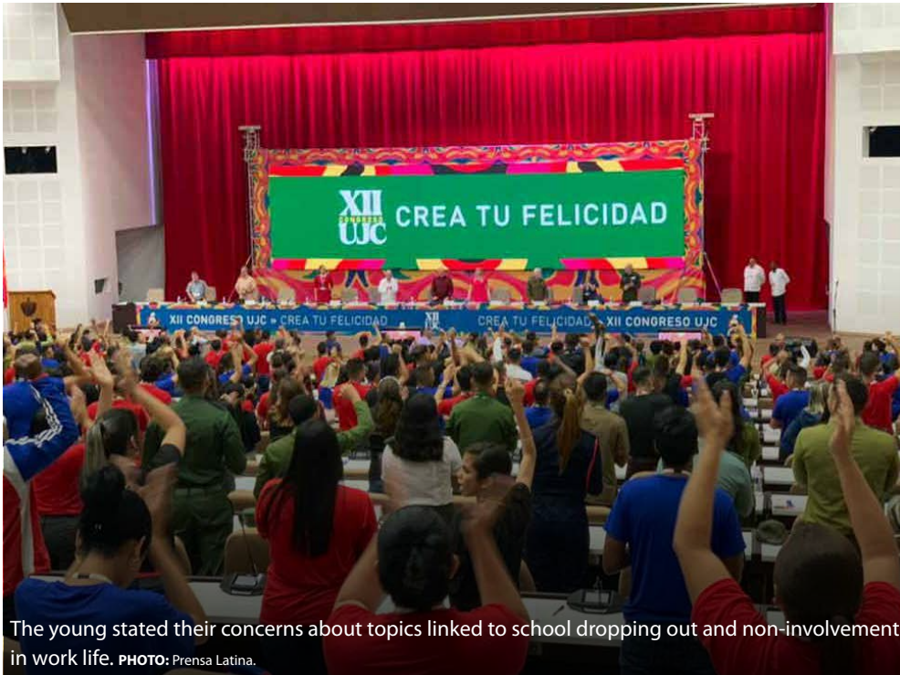
The young stated their concerns about topics linked to school dropping out and non-involvement in work life.