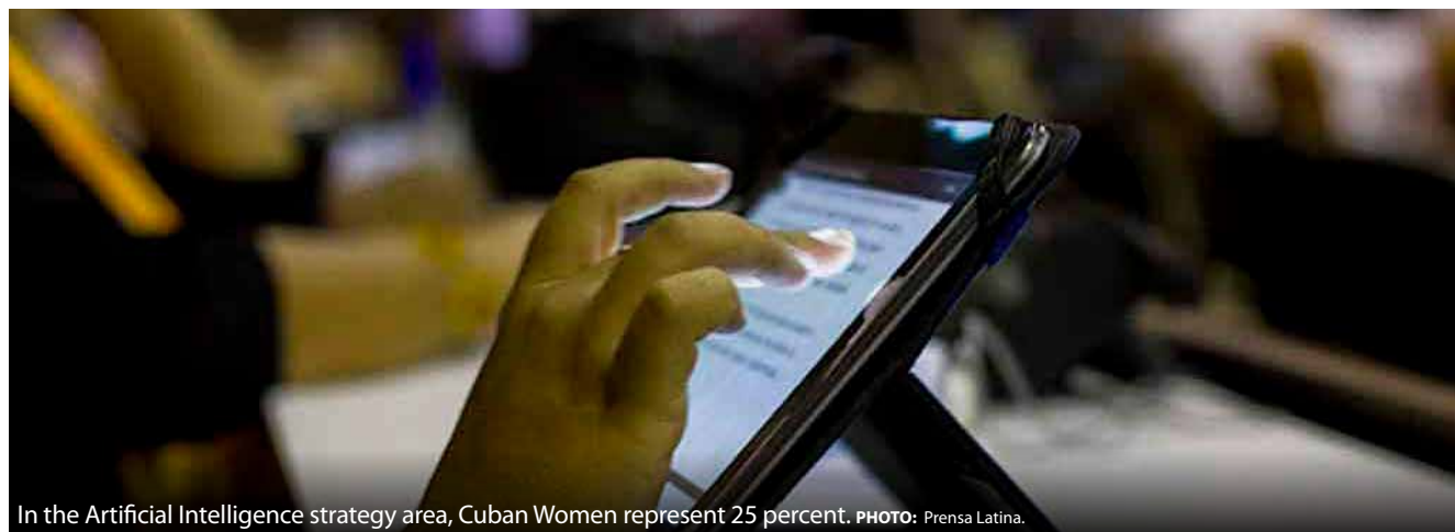
In the Artificial Intelligence strategy area, Cuban Women represent 25 percent.

Considering the national context, UN-Cuba endorsed the diagnosis of information and digital competences, as well as the RCME workshop on the strengthening of capacities, although this is just the starting point in order to contribute to digital inclusion and the economic empowerment of female entrepreneurs in Cuba.