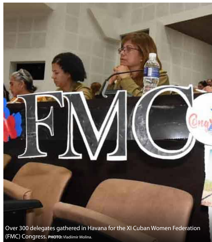
Over 300 delegates gathered in Havana for the XI Cuban Women Federation (FMC) Congress.

For his part, leader of the Cuban Revolution, Raúl Castro, who has participated in all the FMC congresses – since its creation on August 23, 1960 – stated his satisfaction and pleasure for the work the organization has conducted in difficult times resulting from the increasing aggressiveness of the U.S. imperialism.