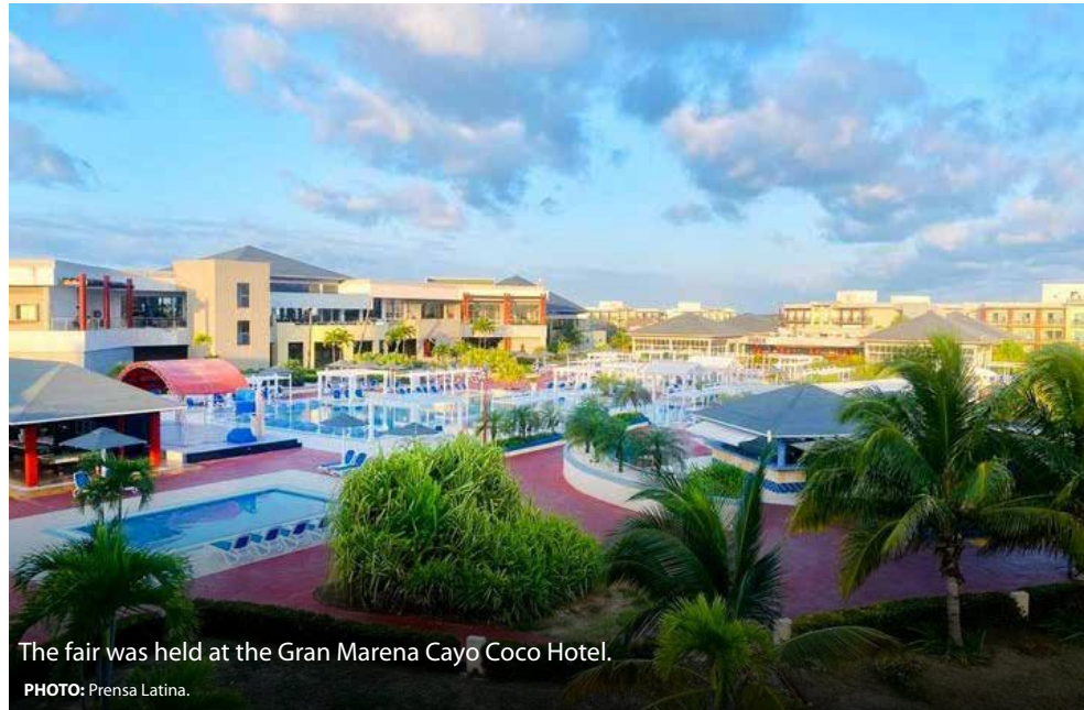
The fair was held at the Gran Marena Cayo Coco Hotel.

On that occasion, over two thousand agents from 82 countries, accompanied by their relatives, visited the Cuban capital – an unprecedented number in comparison to the eight conventions held before.