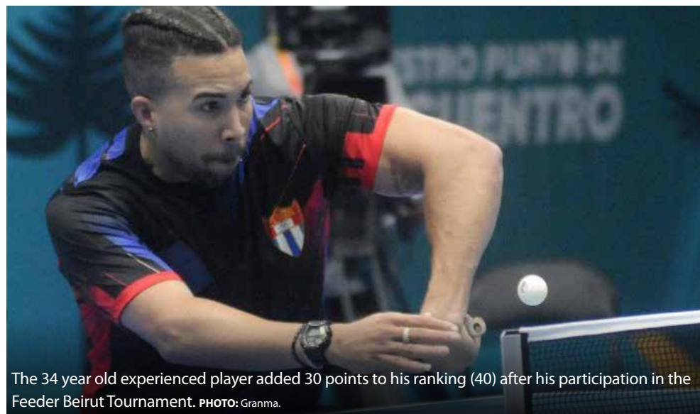
The 34 year old experienced player added 30 points to his ranking (40) after his participation in the Feeder Beirut Tournament.