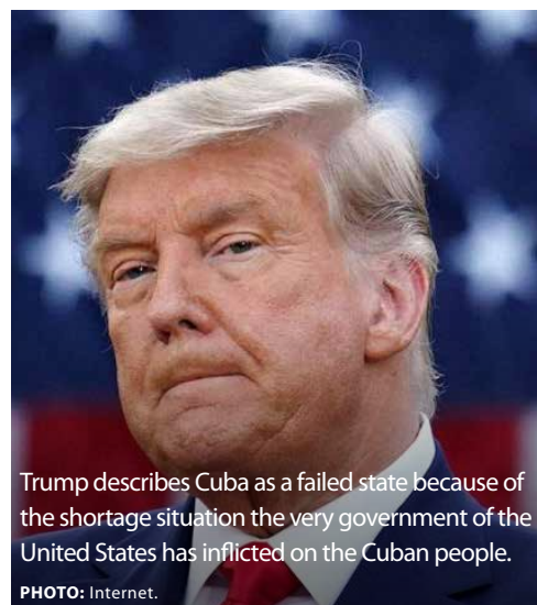
Trump describes Cuba as a failed state because of the shortage situation the very government of the United States has inflicted on the Cuban people.

WASHINGTON.- Donald Trump, the United States potential Republican presidential candidate in 2024, already showed the stance he will assume on Cuba if he returns to the White House; if he clamped down on