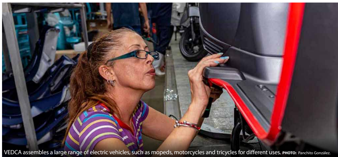
VEDCA assembles a large range of electric vehicles, such as mopeds, motorcycles and tricycles for different uses.

In relation to projections with the non-state sector in Cuba, he affirmed that it is essential to increase the sale of spare parts to private companies with assembly capacity, due to the impossibility of making retail sales, although a new shop will be opened this year in Havana to commercialize its range of electric products and load systems.