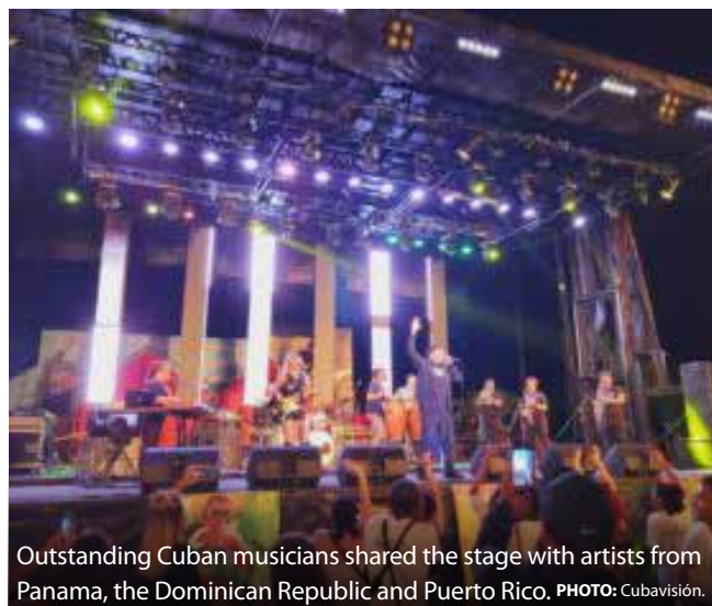
Outstanding Cuban musicians shared the stage with artists from Panama, the Dominican Republic and Puerto Rico.

Based on the homonymous story of Cuban writer and ethnologist Miguel Barnet, the piece has received great acclaim in Cuba and abroad, the reason why The Havana