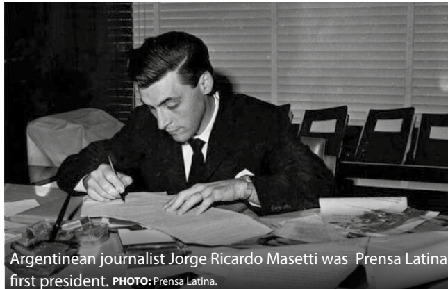
Argentinean journalist Jorge Ricardo Masetti was Prensa Latina first president.

Not only the 350 news published daily in Spanish and other five languages contribute to this result, but