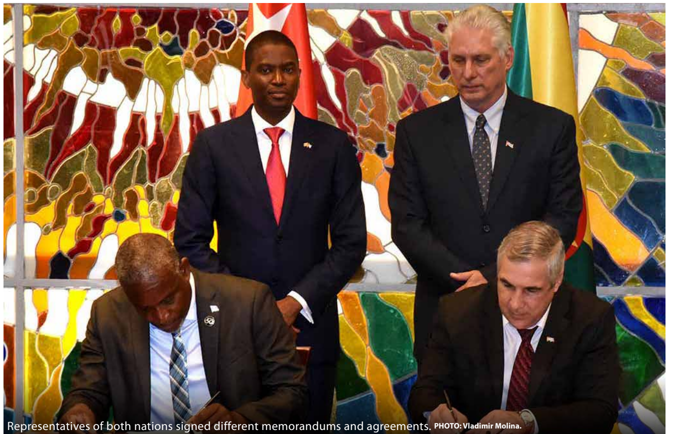
Representatives of both nations signed different memorandums and agreements.

Other activities included in the Prime Minister's agenda were a tour of the Havana's historical center and a tribute to Cuban National Hero José Martí at the monument located in Revolution Square, where he laid a floral wreath.