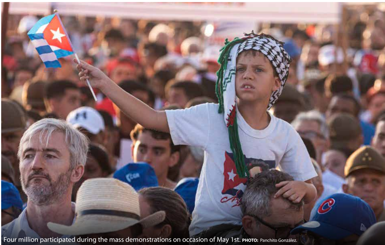
Four million participated during the mass demonstrations on occasion of May 1st.

In Santa Clara, a city located in the country's central region, the people and workers gathered at the Che Guevara Square, at the memorial where the Argentinean-Cuban commander's remains are kept.