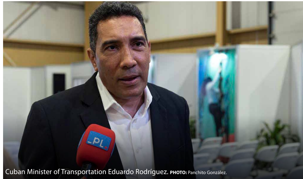
Cuban Minister of Transportation Eduardo Rodríguez.

He added that there are other agreements addressed at developing charge stations based on renewable energies, in order to move forward with the transportation electrification process at a time in which oil is a limitation.