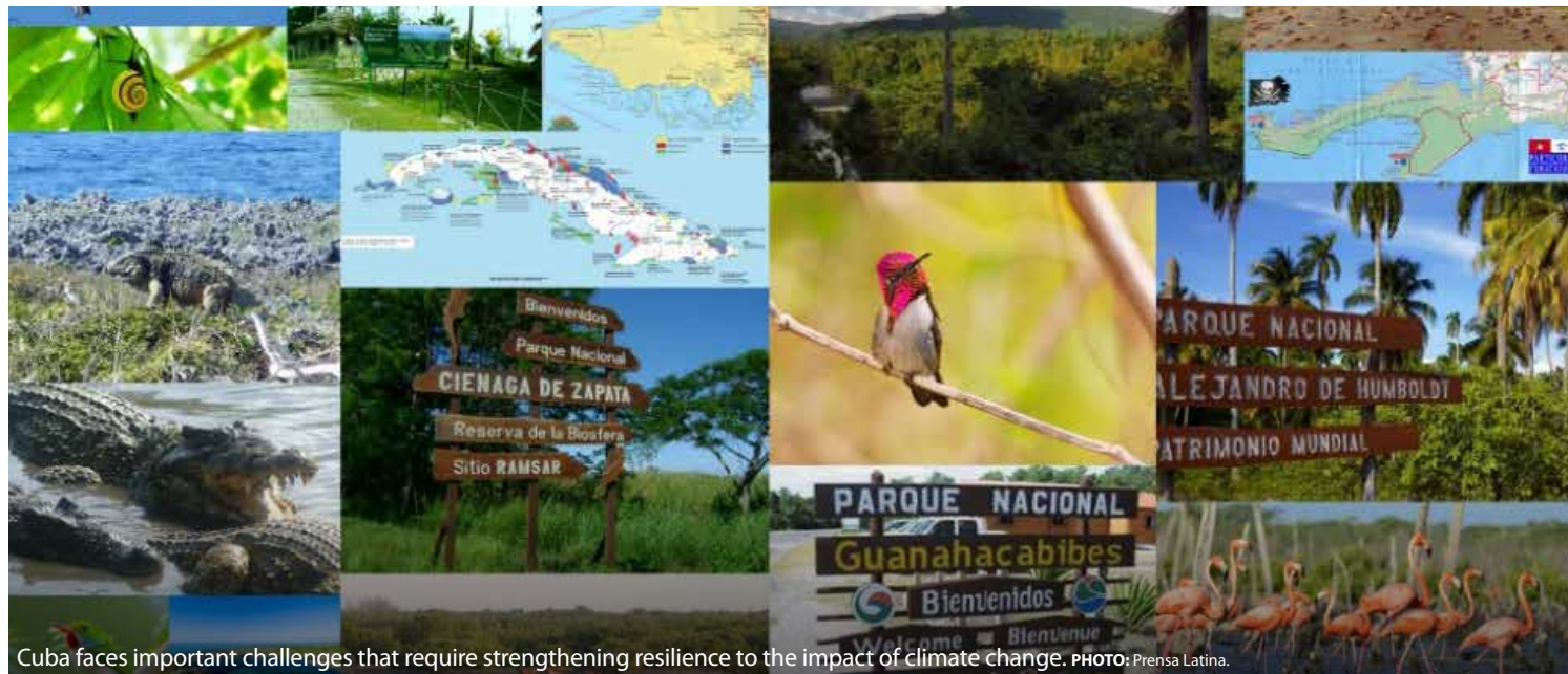
Cuba faces important challenges that require strengthening resilience to the impact of climate change.

Some of Cuba's most important protected areas are the Alejandro de Humboldt and Desembarco del Granma national parks, both, a Heritage Site; Baconao; Ciénaga de Zapata; Cuchillas del Toa, and Sierra del Rosario, all a Biosphere Reserve, in addition to Viñales and the Topes de Collantes natural park.