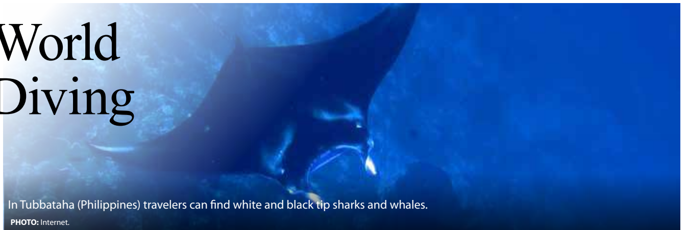
In Tubbataha (Philippines) travelers can find white and black tip sharks and whales.

Bonaire, a Dutch island in the Caribbean, is also famous for its iconic Blue Hole, a 125-meter deep drain that can even be seen from the space.