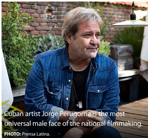
Cuban artist Jorge Perugorría is the most universal male face of the national filmmaking.

HAVANA.- Cuban artist Jorge Perugorría started his career as a visual artist at a Community Culture Center; he then became a famous actor in Cuba and today is the 2024 National Cinema awardee who makes painting exhibits.