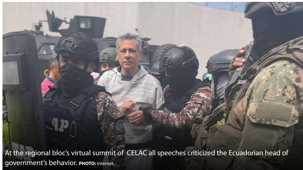
At the regional bloc's virtual summit of CELAC all speeches criticized the Ecuadorian head of government's behavior.

At the beginning of this year, the justice ordered his detention for alleged embezzlement in the so-called Manabí Reconstruction case, which investigates an alleged public works embezzlement after the 2016 earthquake