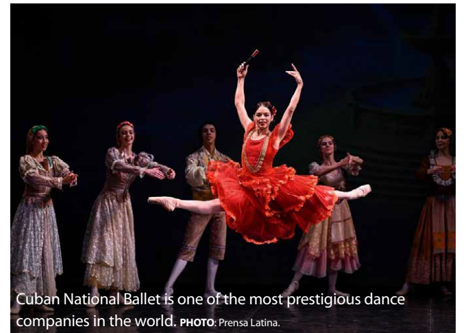
Cuban National Ballet is one of the most prestigious dance companies in the world.

It has been announced that this intense tour will also include León, Salamanca, Torrejón de Ardoz and Zaragoza, with four performances at the Main Theater.